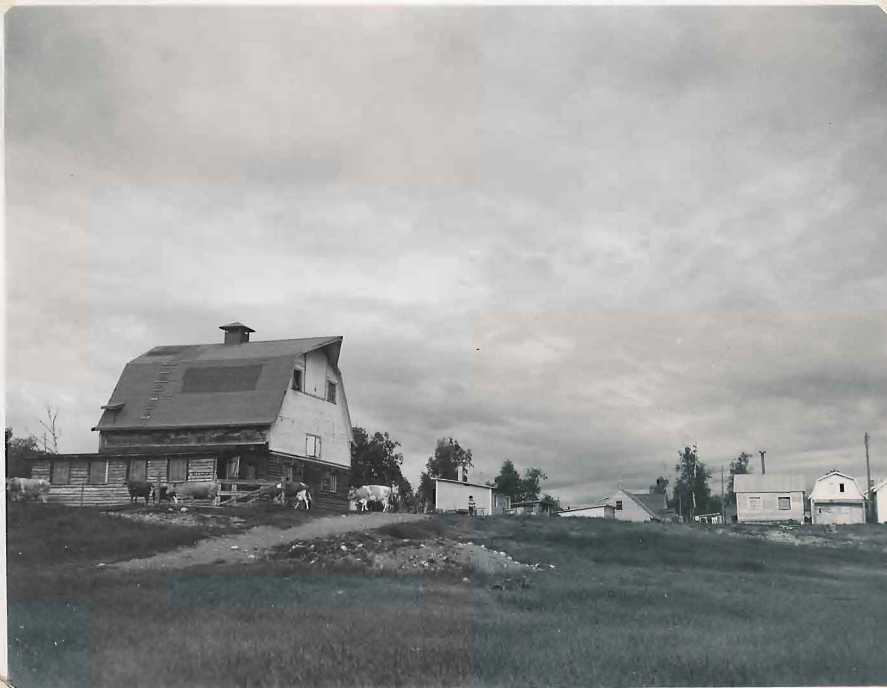
VALLEY CHRISTIAN HOME