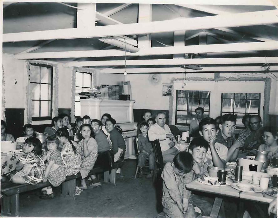
VALLEY CHRISTIAN HOME