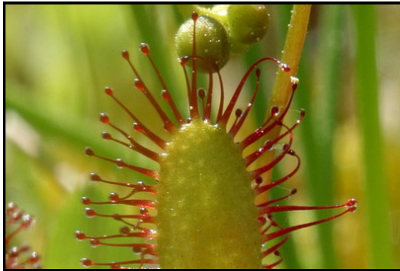
Drosera anglica Huds. (English Sundew)