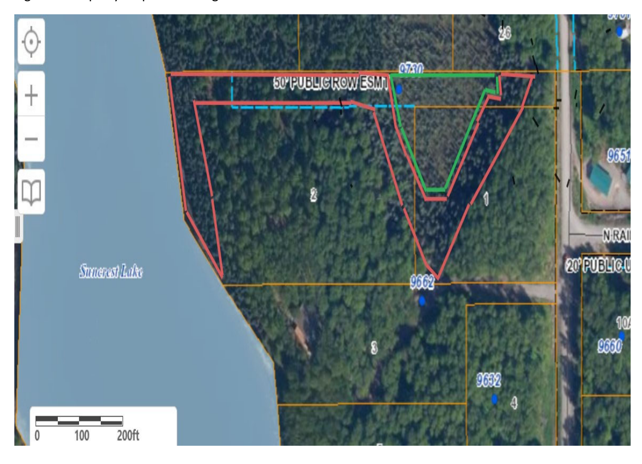
Figure 1: Property map delineating wetlands