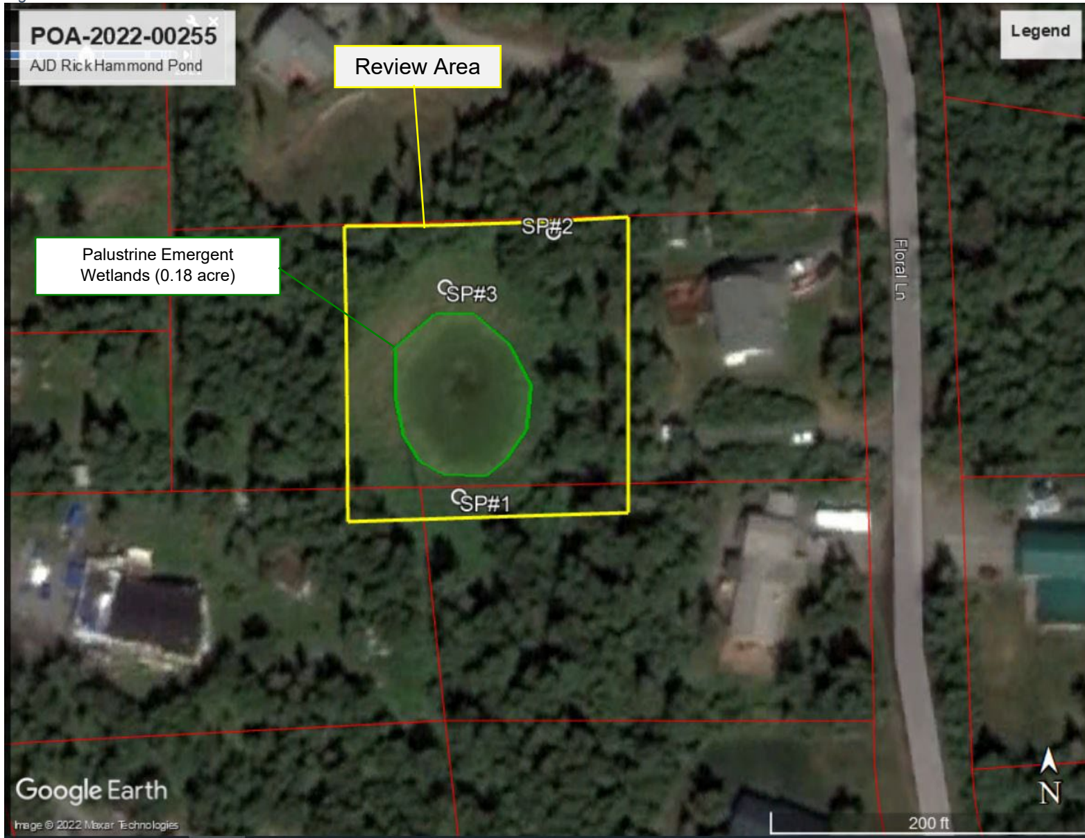
Figure 1: Review Area.