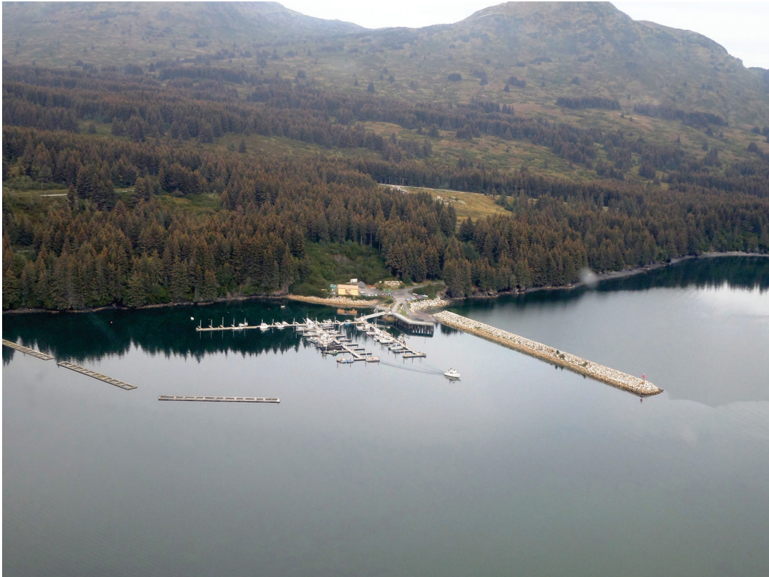
Northwest oblique of Port Lions Harbor, 24 September 2014.