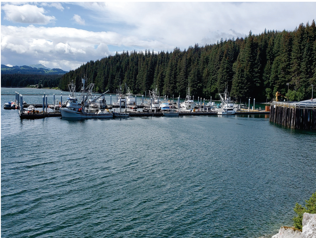
Port Lions Harbor, October 2020