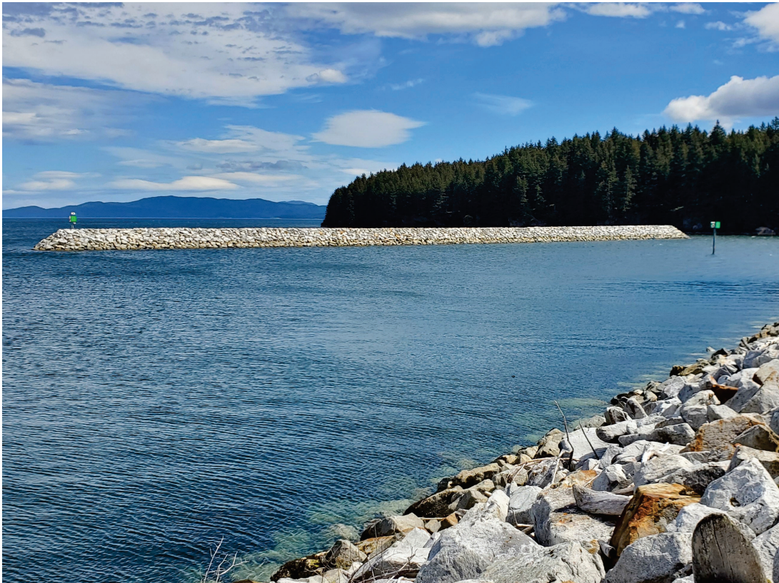
New Breakwater, October 2020