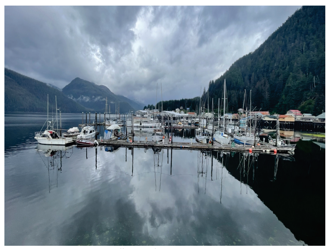
Pelican Harbor, August 2022