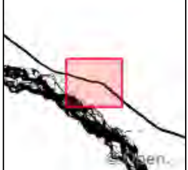
US Army Corps of Engineers This map was produced using the SimSuite web application on: 08 May 2018 @ 1226