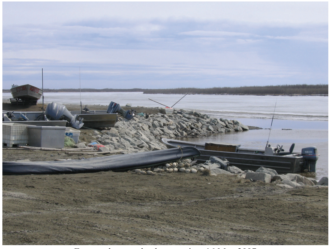
Emmonak streambank protection, 16 May 2007