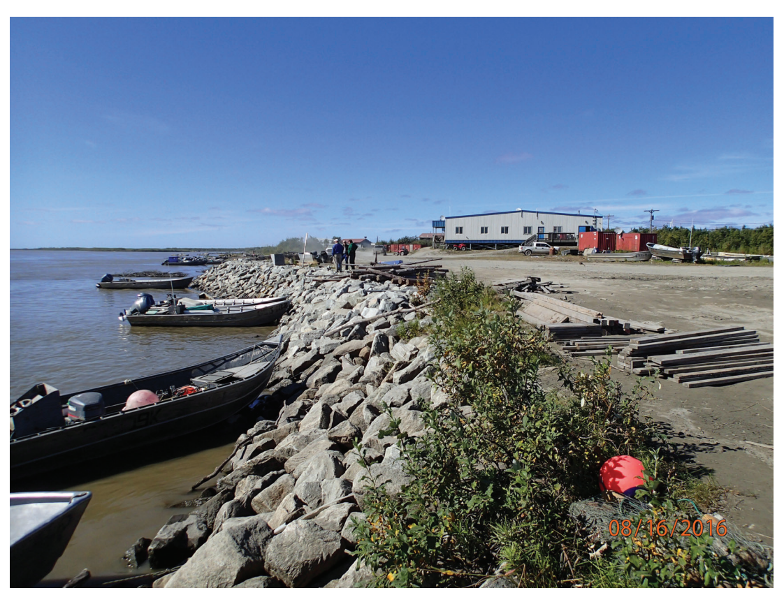
Emmonak revetment downstream of fish processor, August 2016