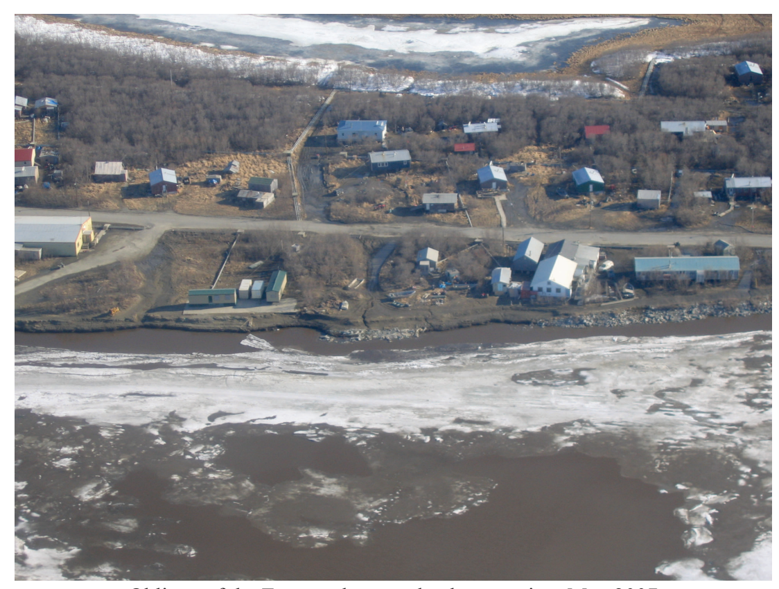
Oblique of the Emmonak streambank protection, May 2007