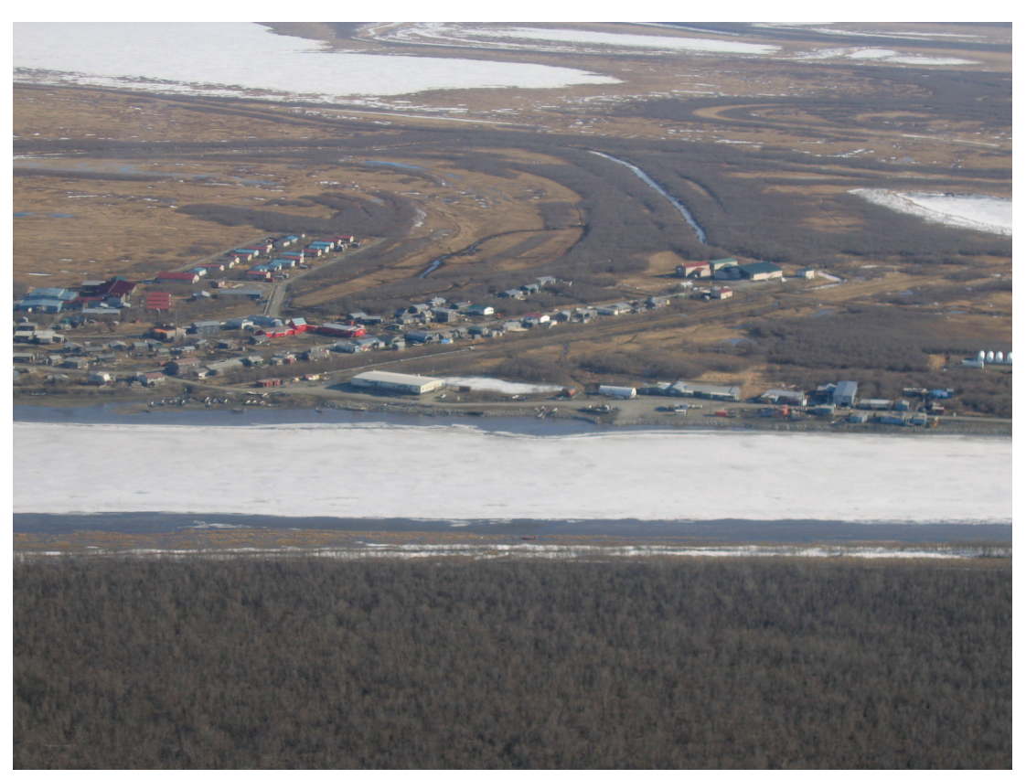
Oblique of the Emmonak streambank protection, May 2007