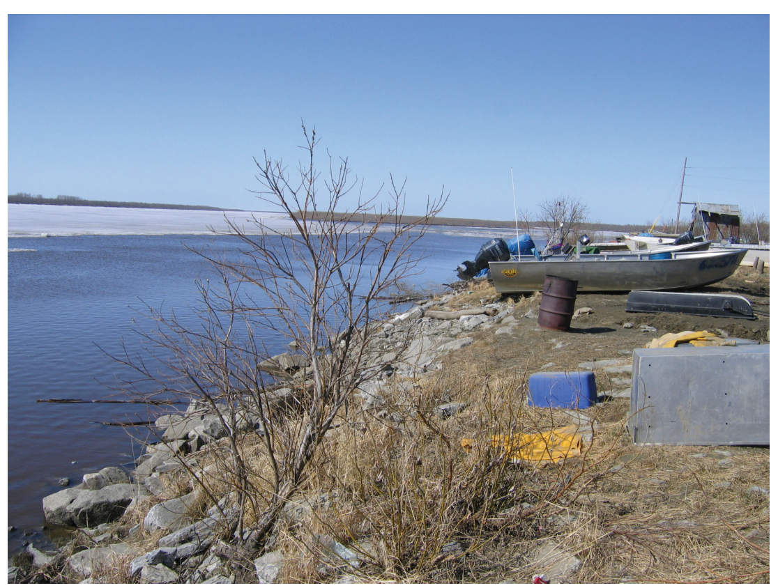
Emmonak streambank protection, 16 May 2007