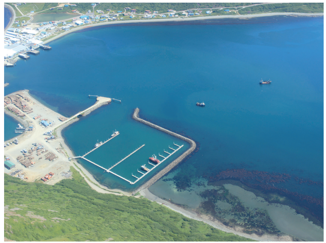
Oblique Babe Newman Harbor, July 2014