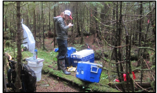
Remedial Investigation Activities

The US Army Corps of Engineers (USACE) – Alaska District completed an environmental remedial investigation, feasibility study, and decision document for the Fort Babcock Formerly Used Defense Site located on Kruzof Island, Alaska. USACE has assessed the risk to human health and the environment resulting from past military activities and determined the remedy for the site to be removal of contaminated soil with offsite disposal.