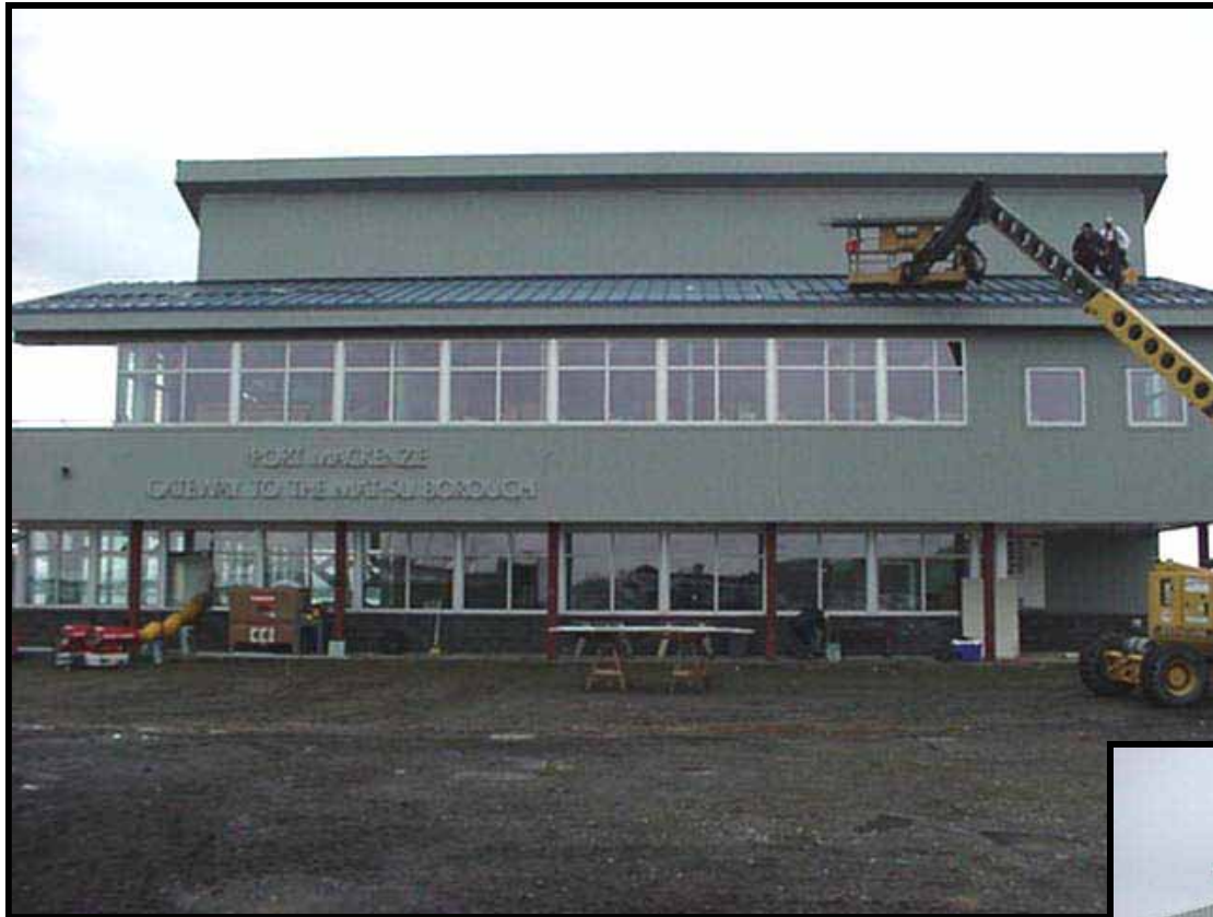
Ferry Terminal Building