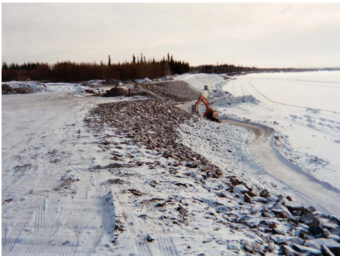
Construction of the emergency bank stabilization, April 2005