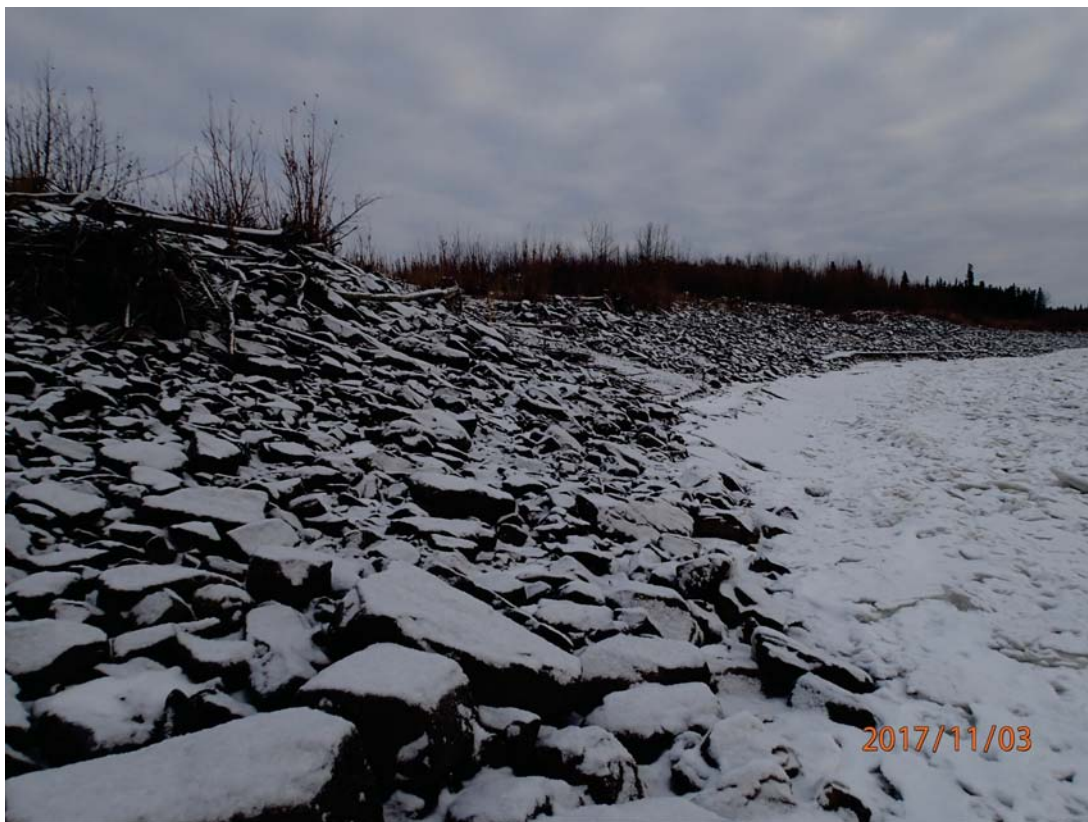
Revetment at access ramp, looking upstream, November 2017