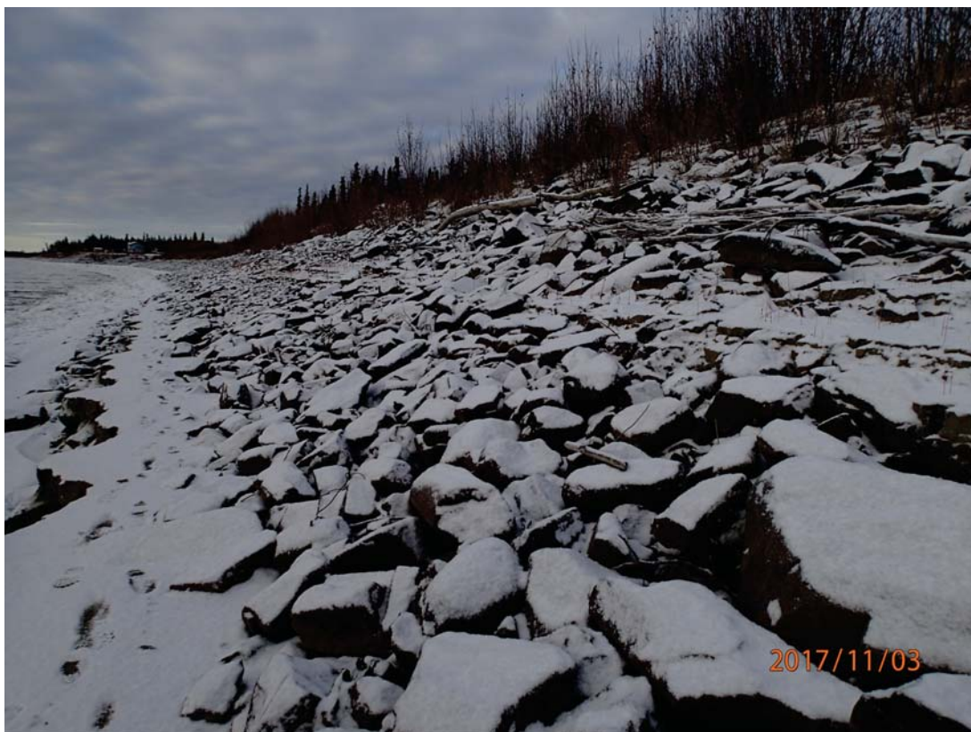
Revetment near upstream end, looking downstream, November 2017