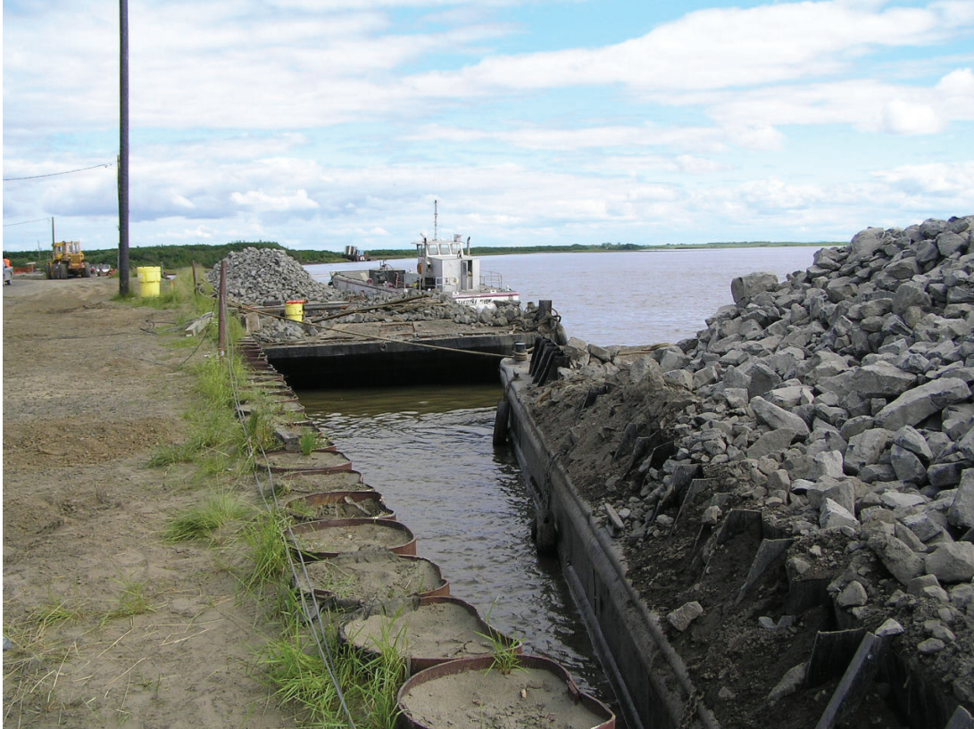
Riprap transport for the Bethel Bank Stabilization project, July 2007