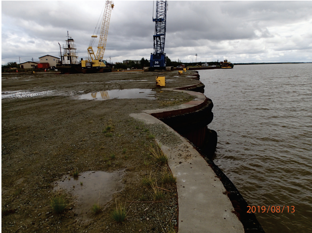
The Port of Bethel along the Kuskokwim River, August 2019