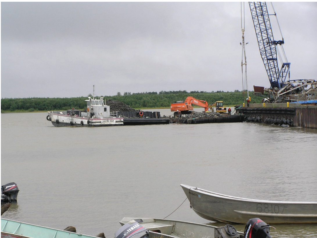
Placement of riprap, August 2007