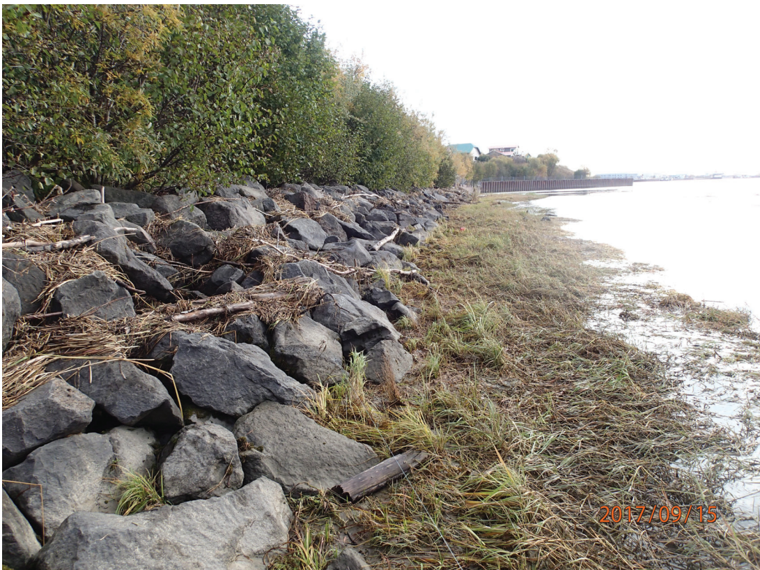
Typical rock revetment and seawall at downstream end of Mission Road, 2017