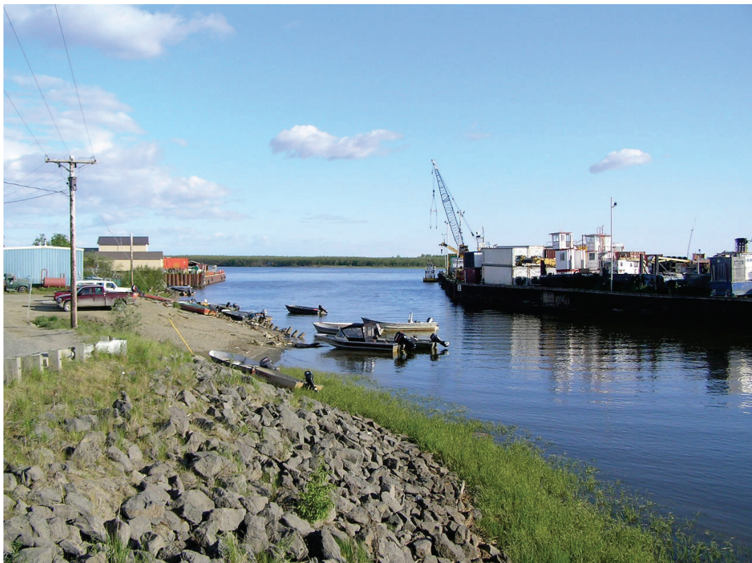
Bethel Bank Stabilization along Brown's Slough, June 2007