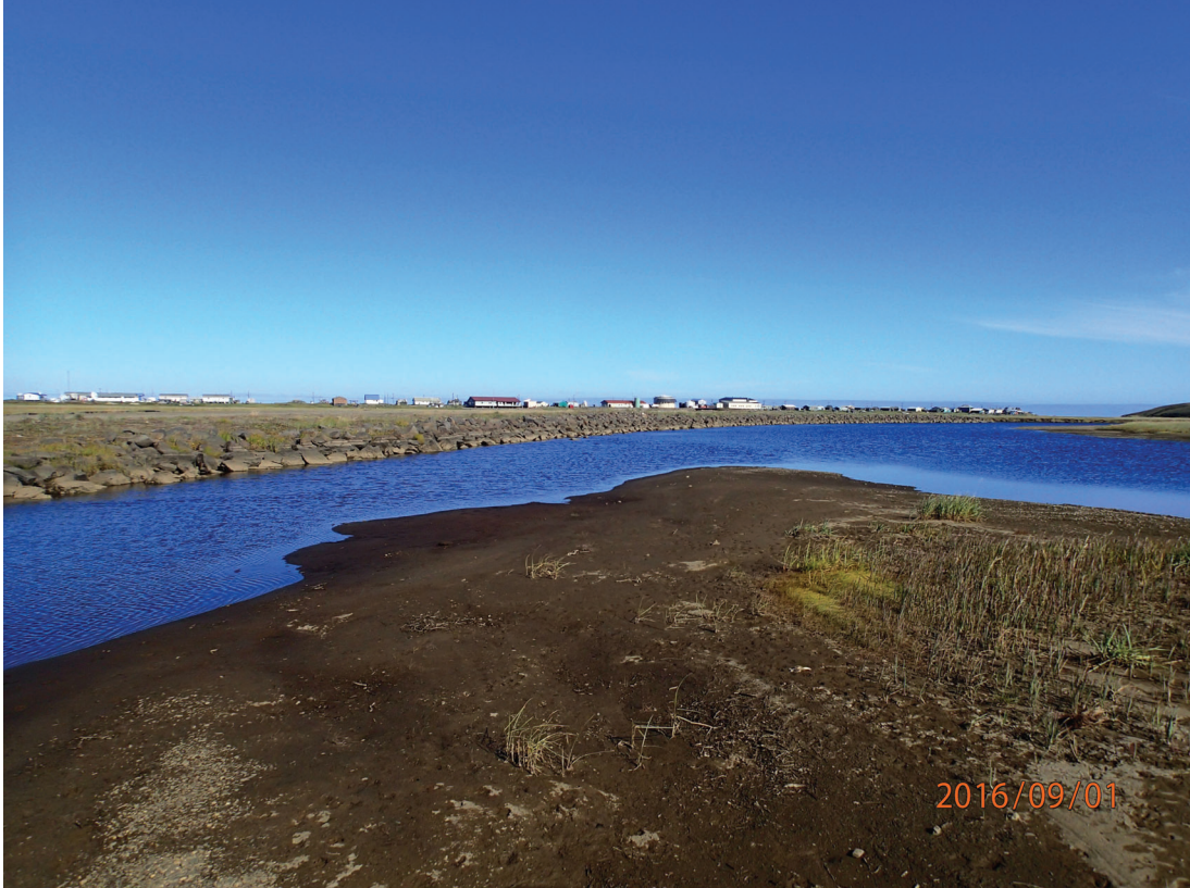
Looking at the revetment along the airport road, September 2016