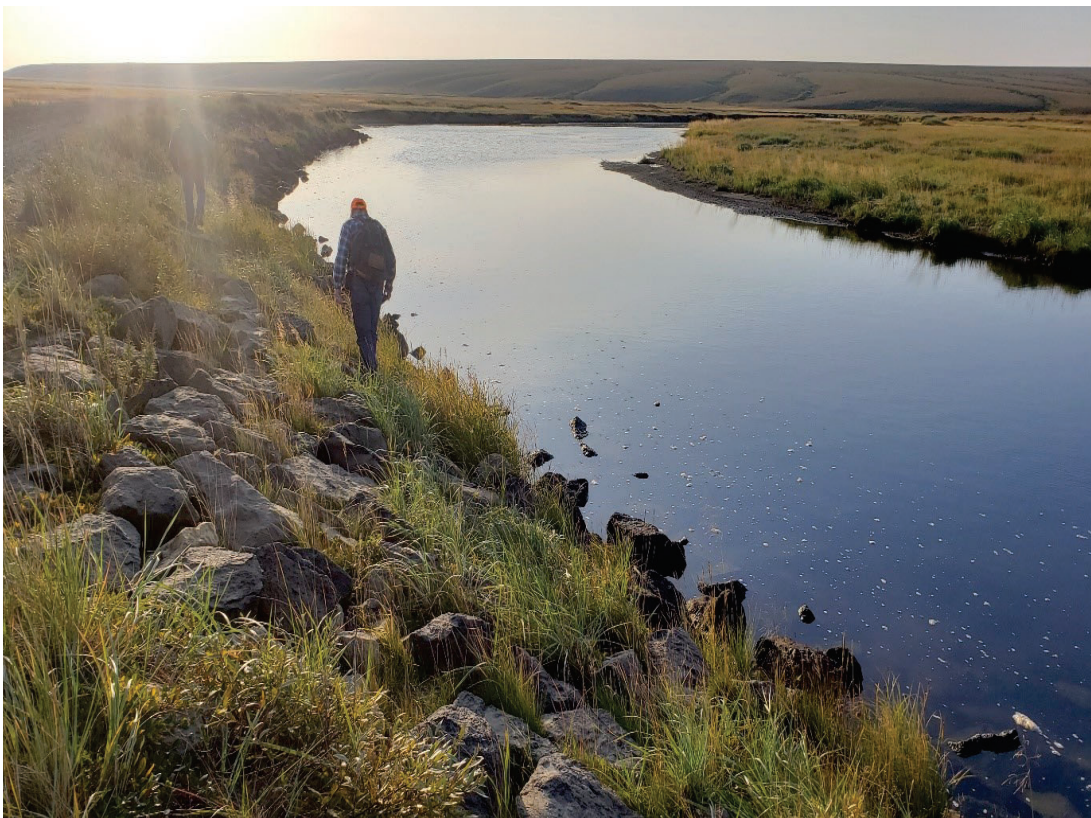
Looking downstream at the approximately 800-ft long revetment, August 2019