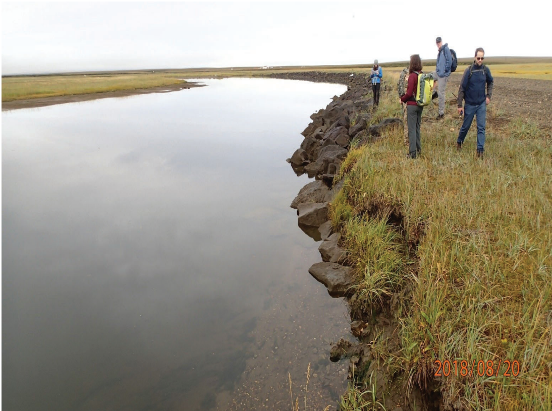
Revetment near the airport, August 2018