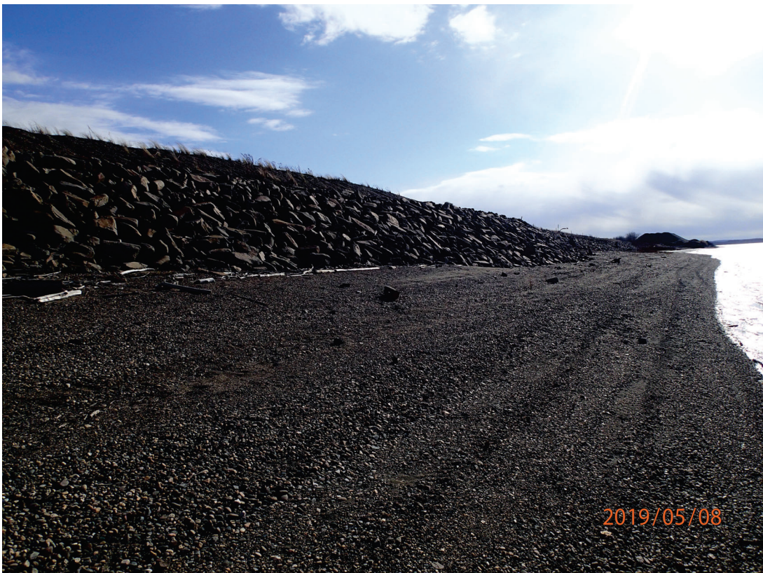
Revetment near downstream end, looking upstream, May 2019