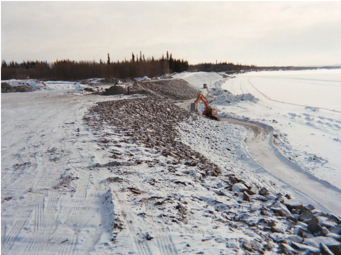
Construction of the emergency bank stabilization, April 2005