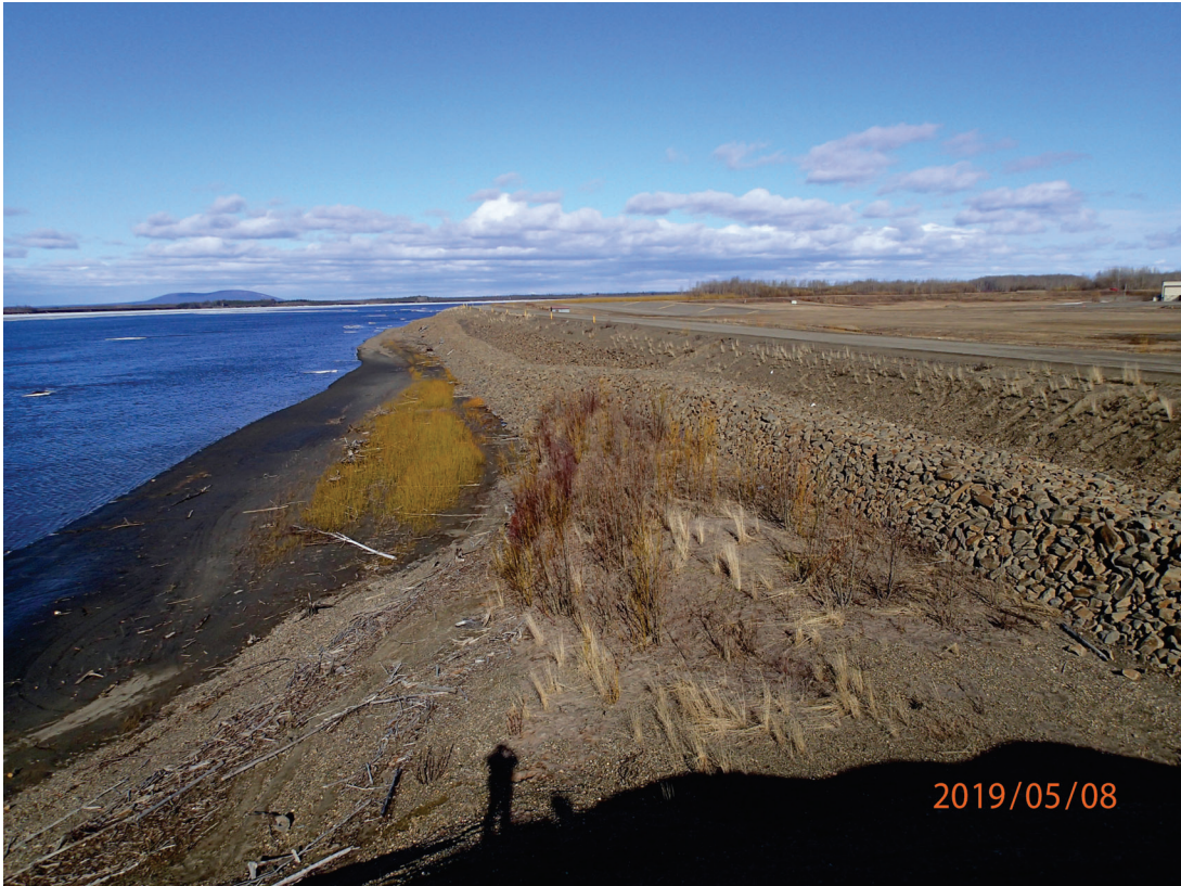
Revetment looking downstream, May 2019