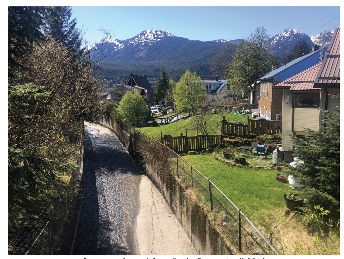
Concrete channel from Irwin Street, April 2019