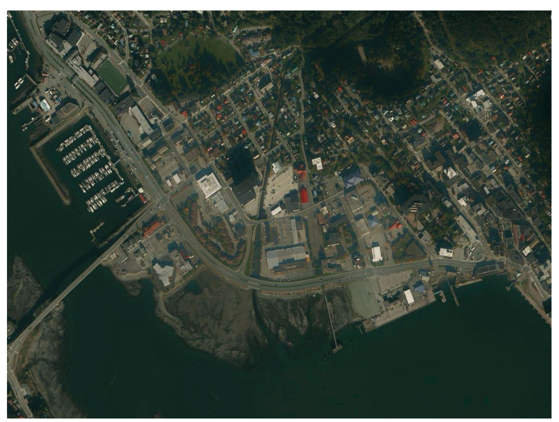
Aerial of Gold Creek and Juneau, 2014