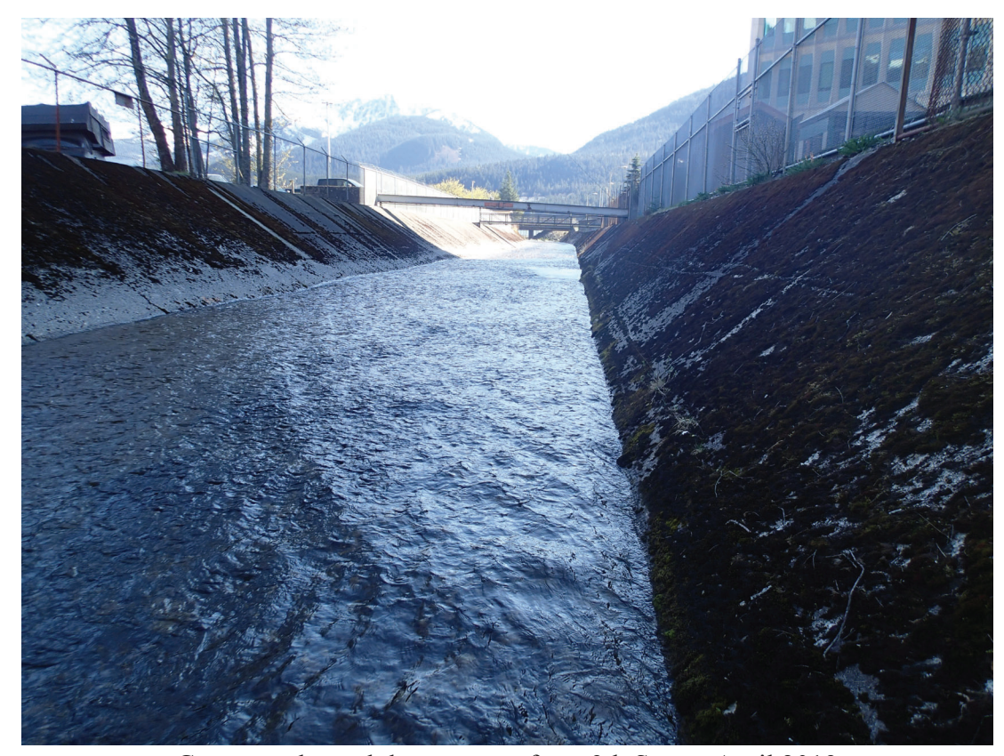
Concrete channel downstream from 9th Street, April 2019