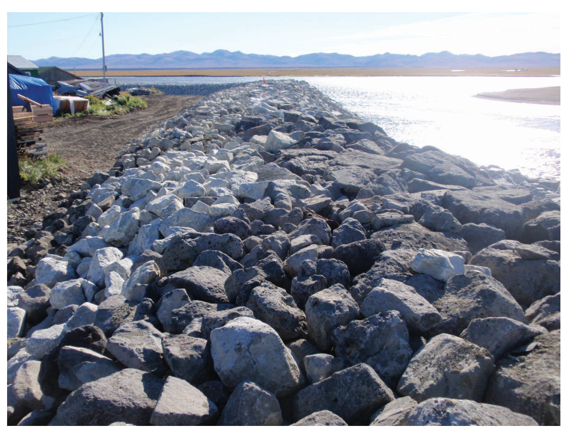
Tie-in to Phase I Project, September 2014