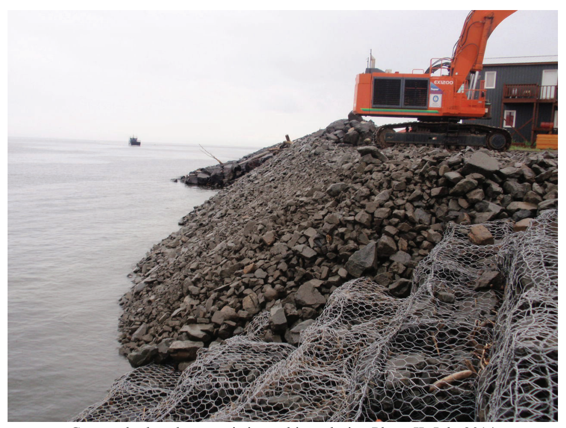
Core rock placed over existing gabions during Phase II, July 2014