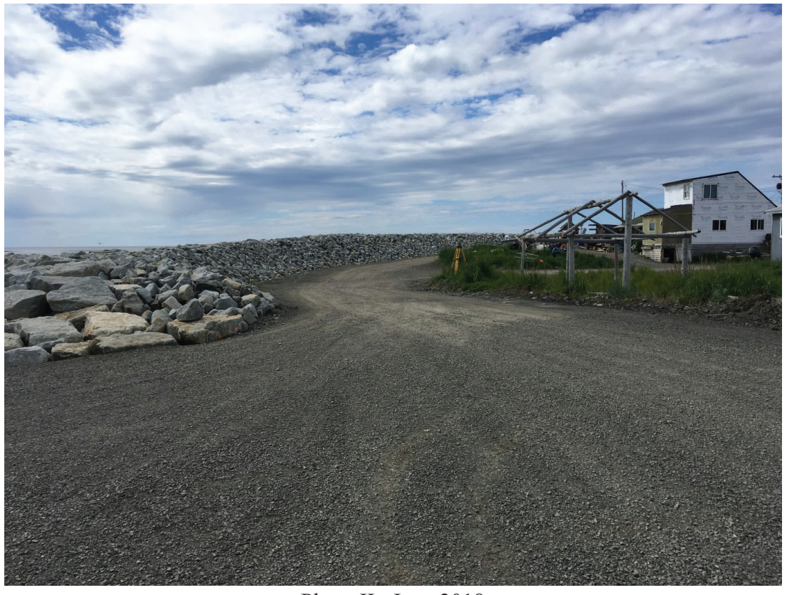
Phase II, June 2018