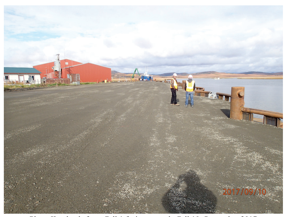
Phase II uplands from Cell 1 facing towards Cell 10, September 2017