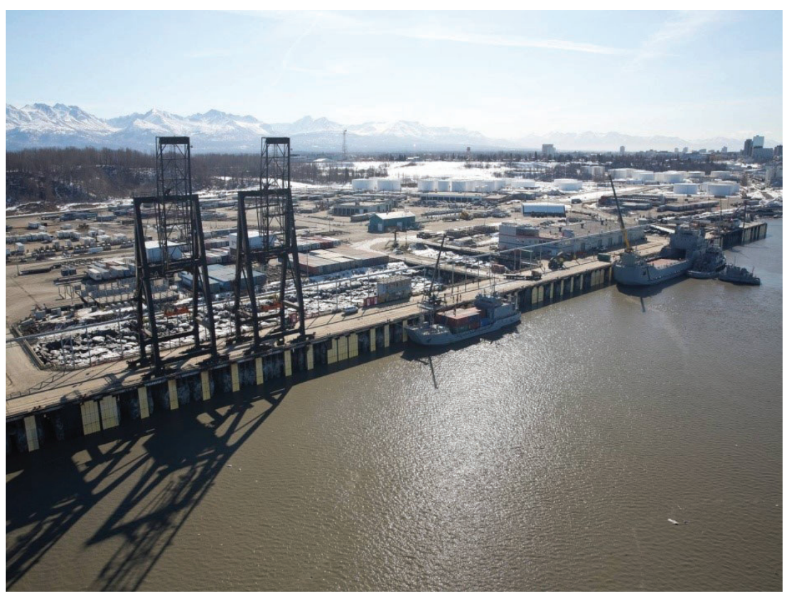
Terminal 1& 2 Port of Alaska