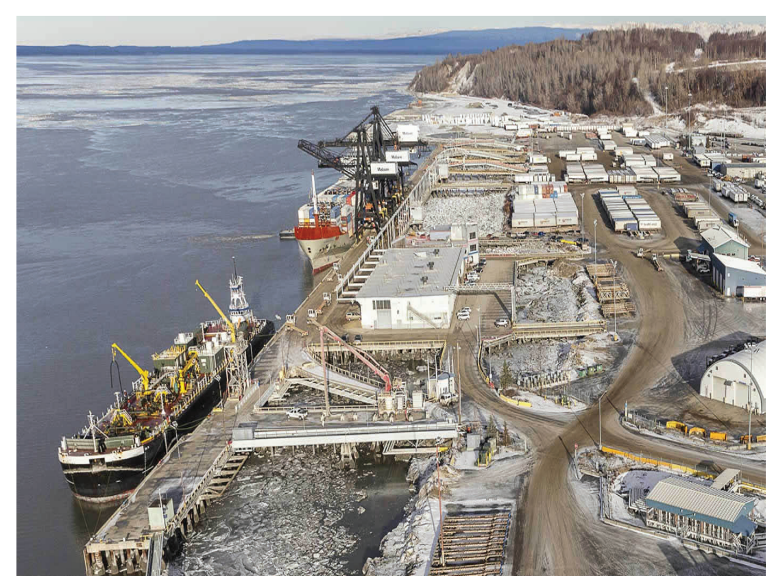
Terminal 1& 2 Port of Alaska