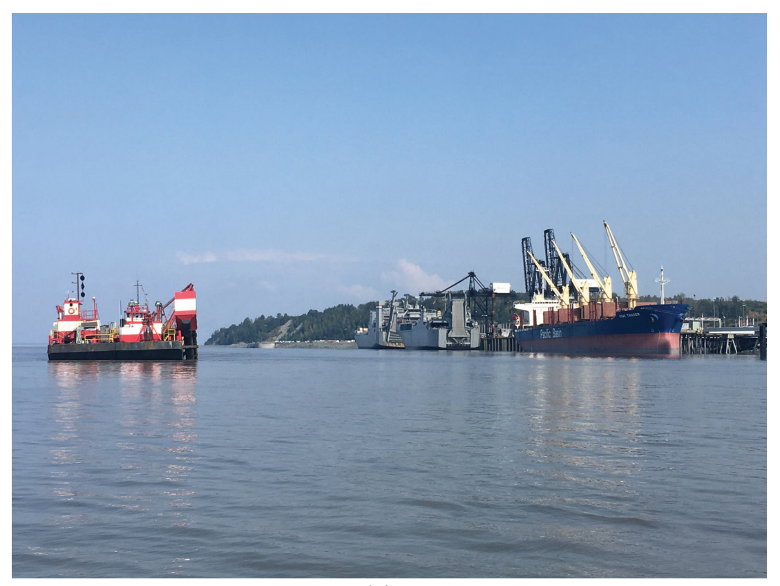
Westport Dredging, August 2019