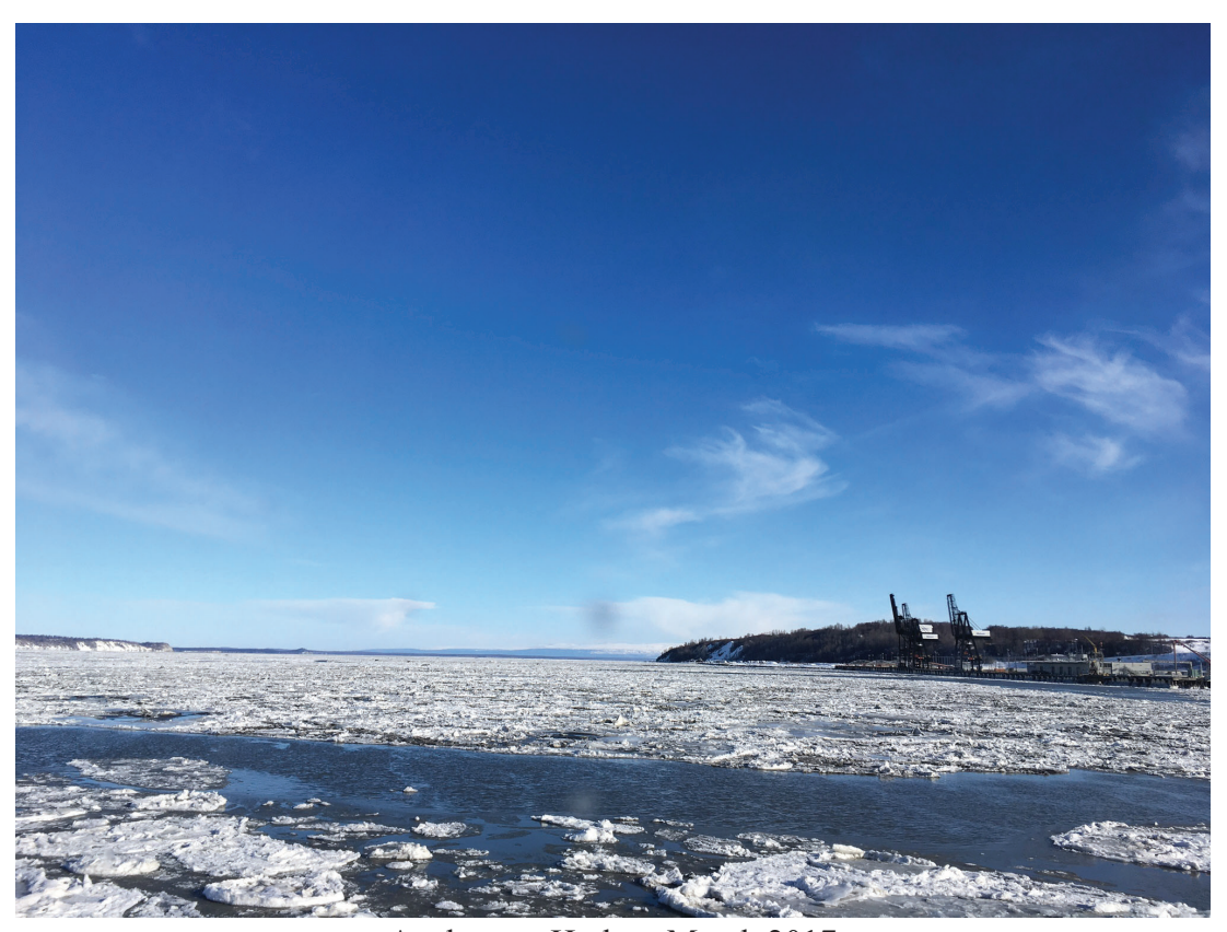
Anchorage Harbor, March 2017