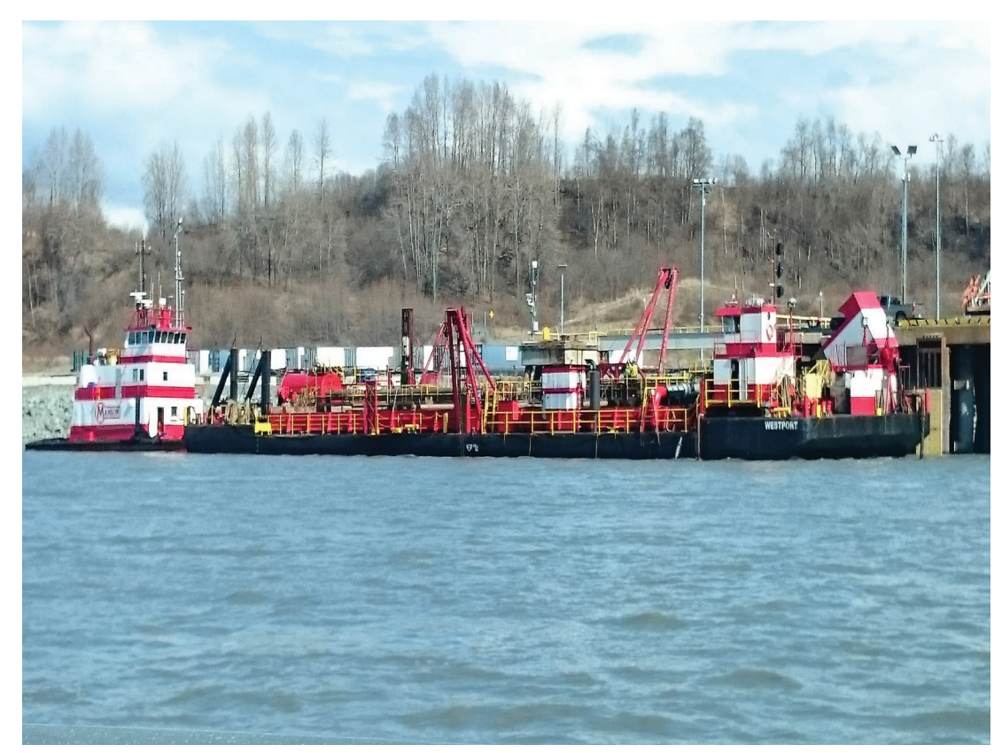
Westport Dredging in Terminal 3, May 2015