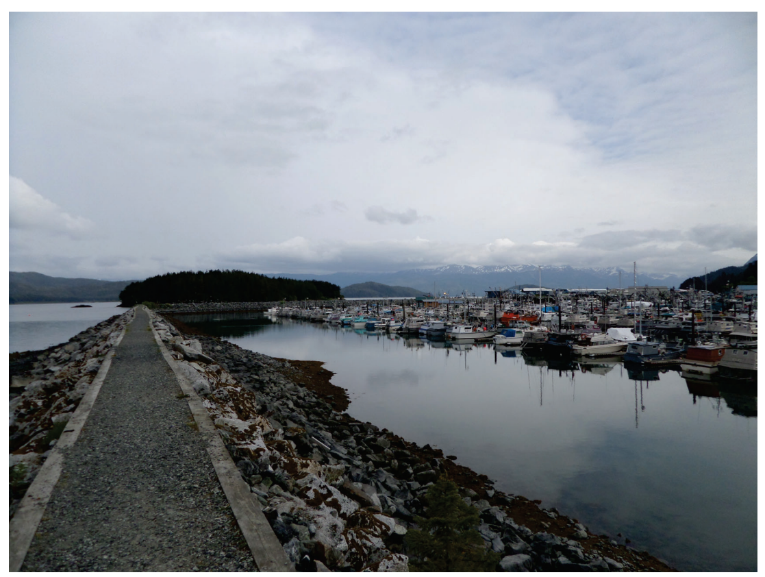
Condition of the western breakwater during May, 2014