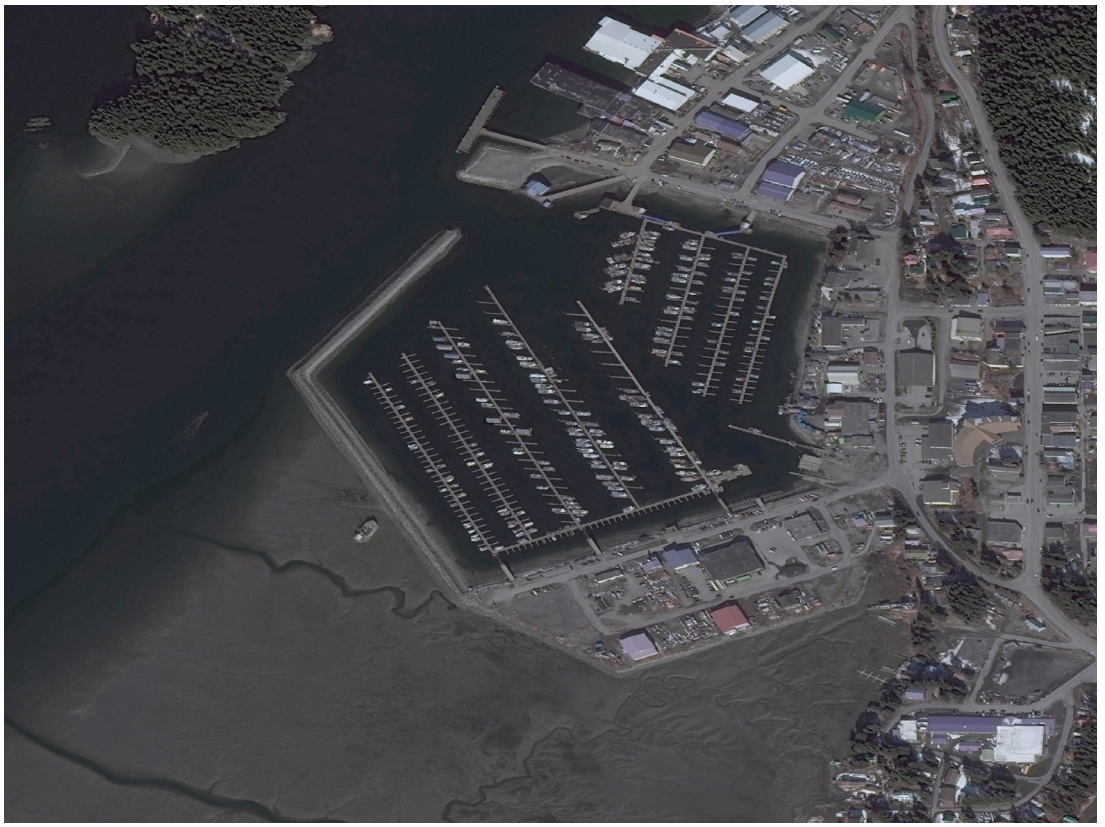
Aerial of the Cordova Small Boat Harbor, April 2014