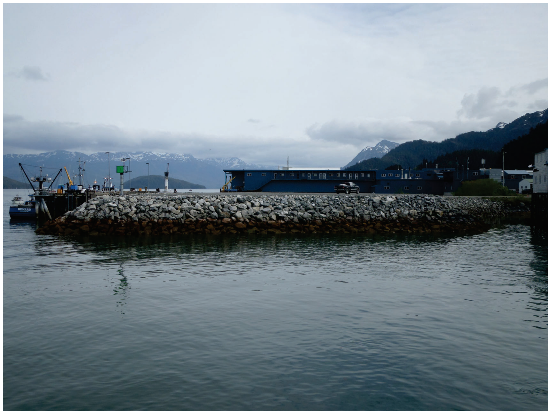
View of the entrance breakwater extension in May, 2014