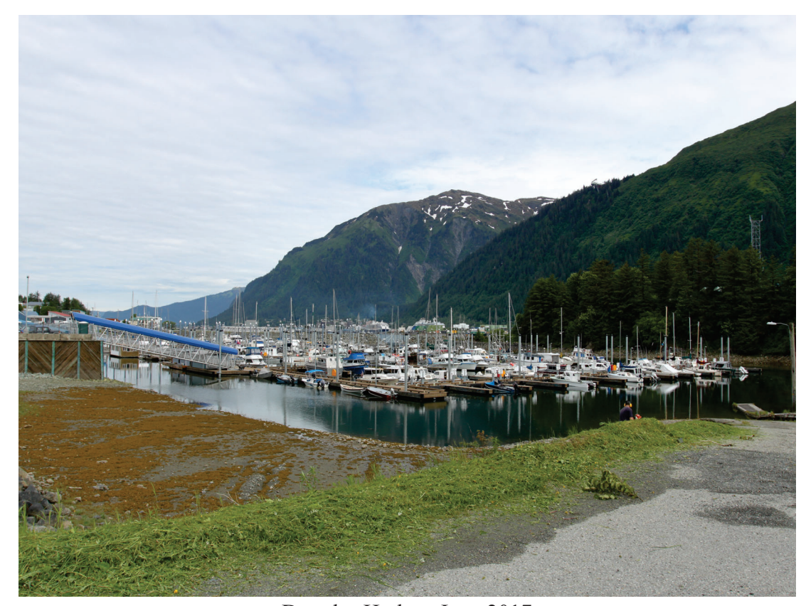
Douglas Harbor, June 2017