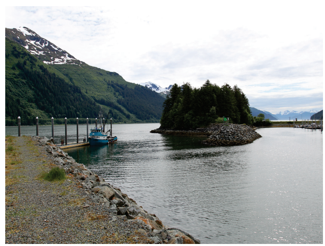
Entrance Channel, June 2017