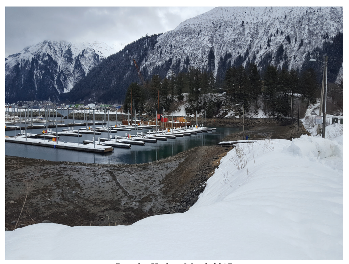
Douglas Harbor, March 2017