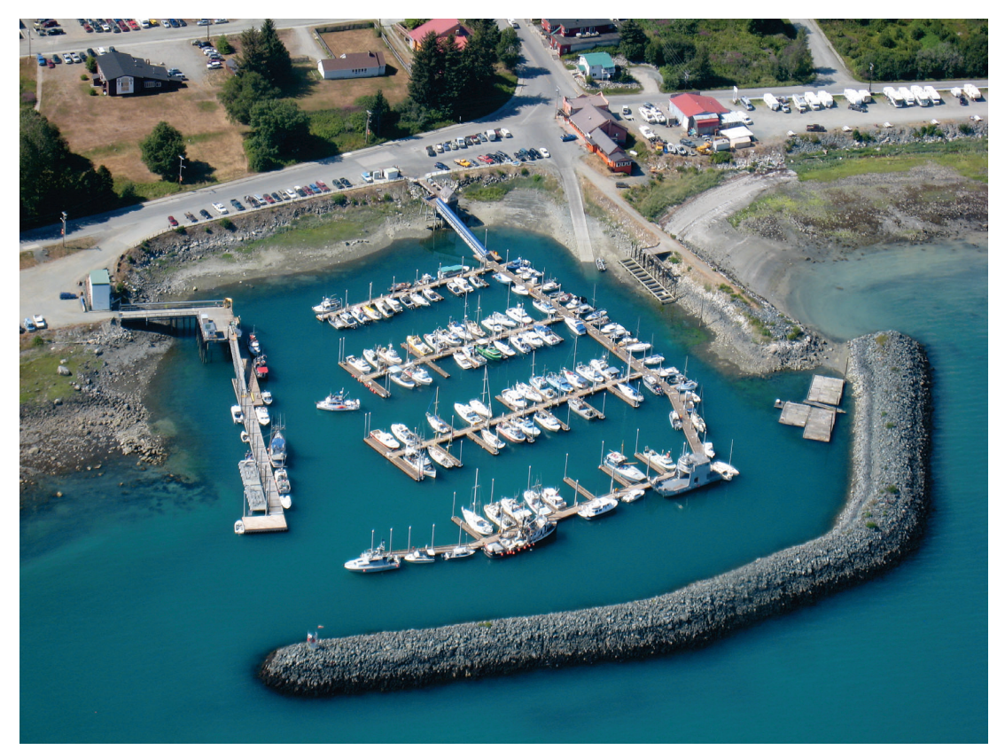
Aerial of Haines Harbor, July 2011