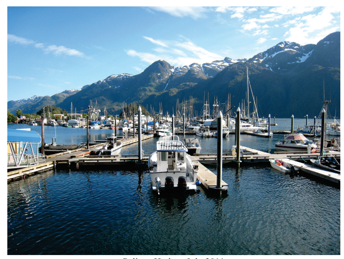
Pelican Harbor, July 2011