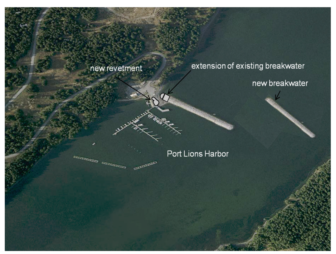
2015 Rendering Port Lions Harbor Navigation Improvements