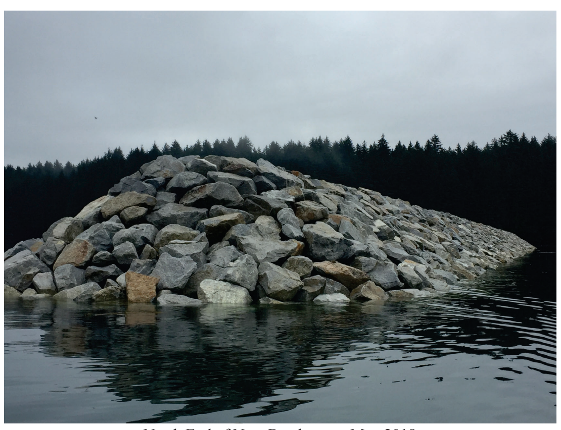
North End of New Breakwater, May 2018