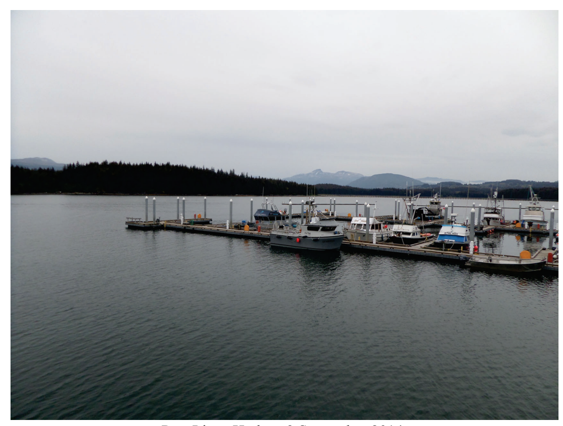
Port Lions Harbor, 3 September 2014.