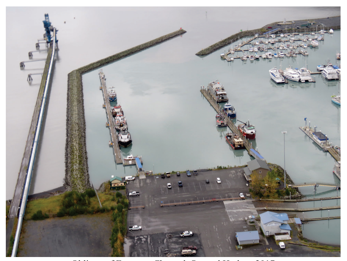
Oblique of Entrance Channel, Seward Harbor, 2017