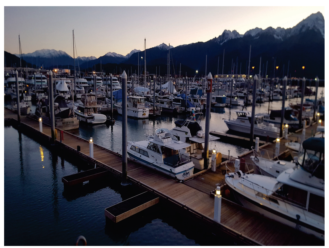
Seward Harbor, 2017