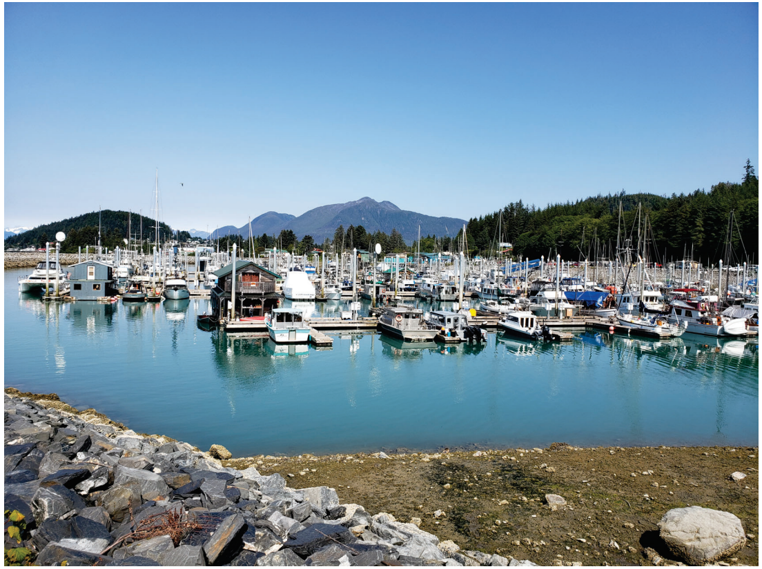
Heritage Harbor, August 2019