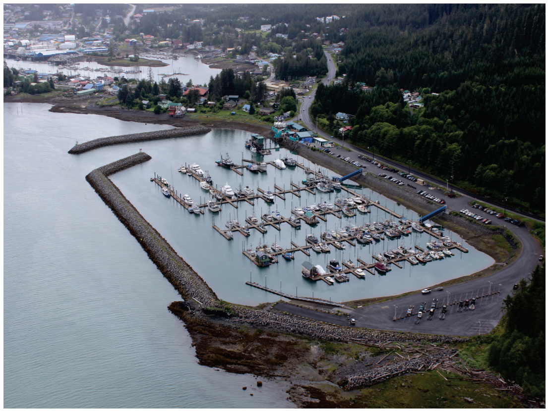
Oblique of Heritage Harbor, July 2015.