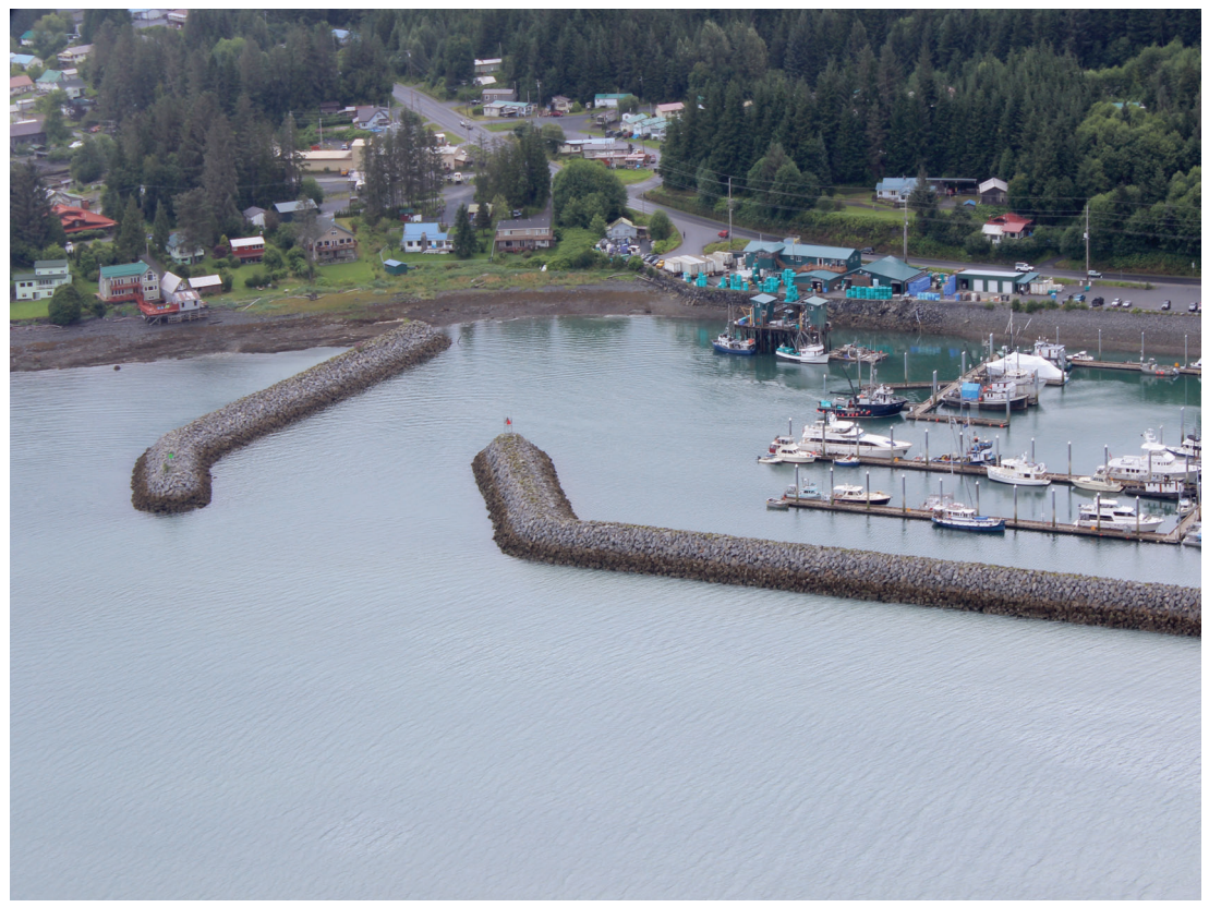
Heritage Harbor Entrance Channel and Breakwaters, July 2015.