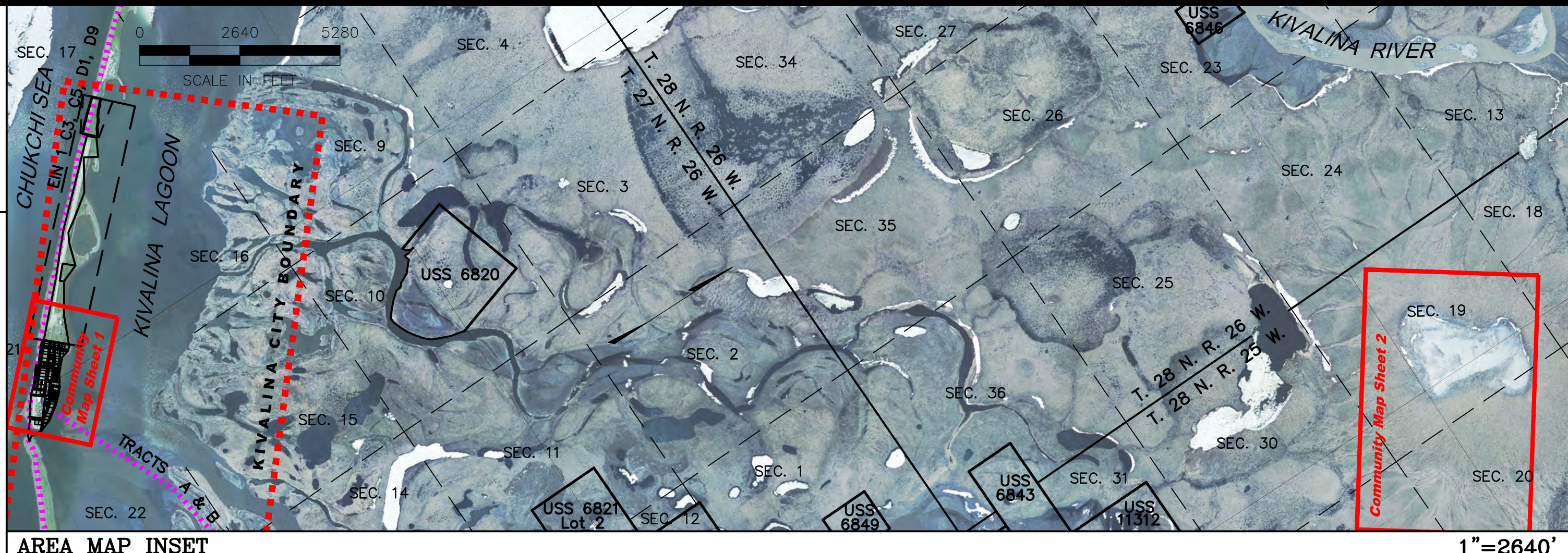
AREA MAP INSET