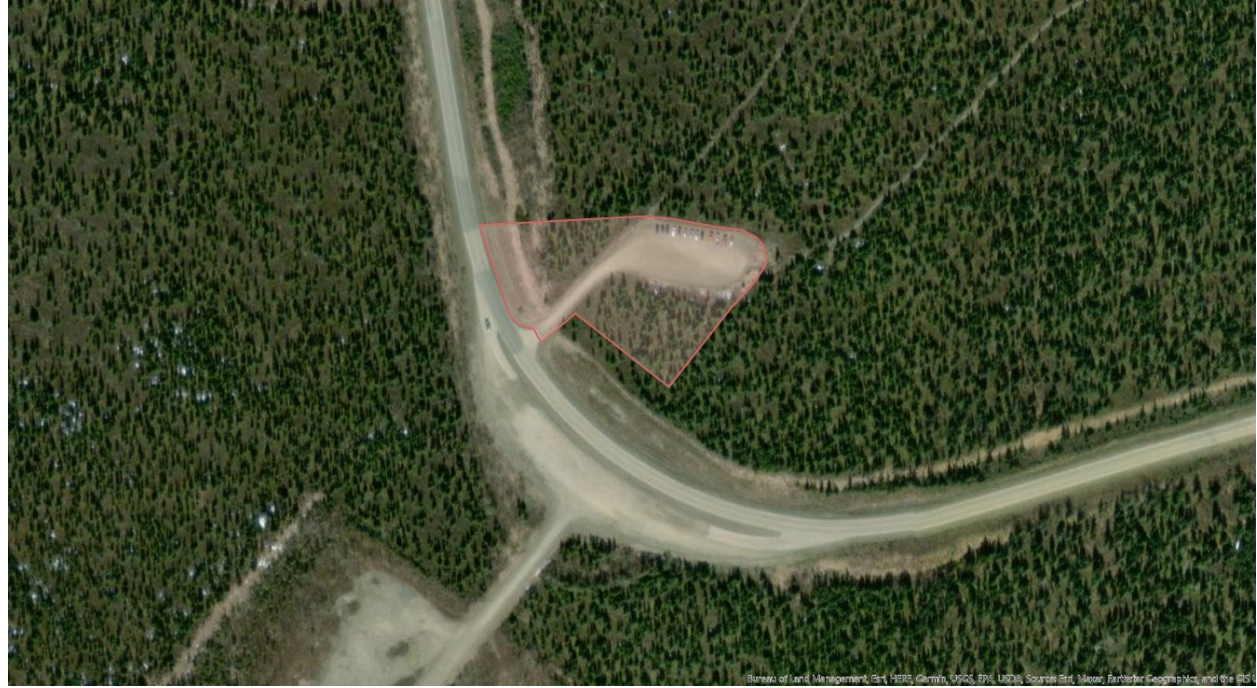
Figure 1: Review Area

SUBJECT: Pre-2015 Regulatory Regime Approved Jurisdictional Determination in Light of Sackett v. EPA , 143 S. Ct. 1322 (2023), POA-2023-00277