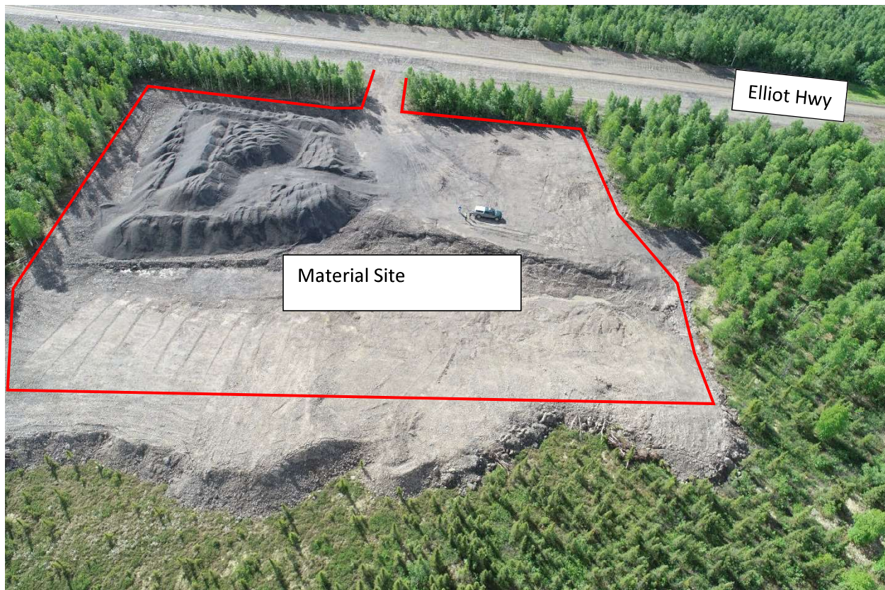
Material site 680-052-2 located at MP 105.5 of the Elliot Highway.