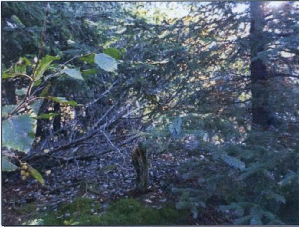
Site 48: Vegetation. Photo taken September 30, 2016