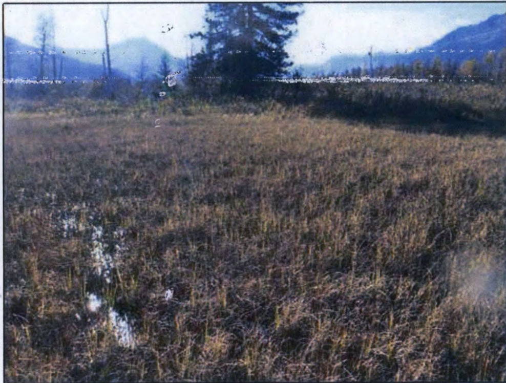
Site 61: Vegetation. Photo taken September 30, 2016