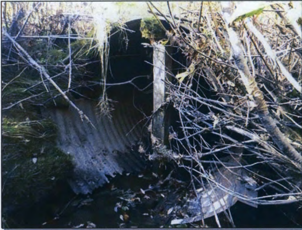
Site 9: Culvert. Photo taken September 29, 2016