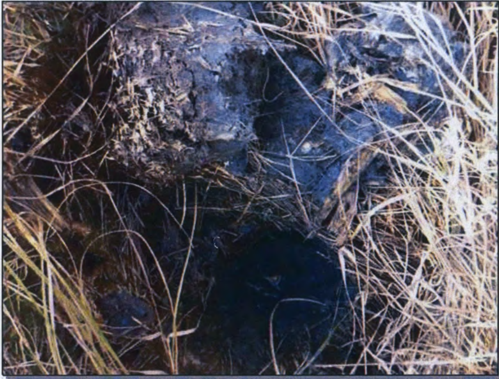
Site 25: Soil. Photo taken September 29, 2016