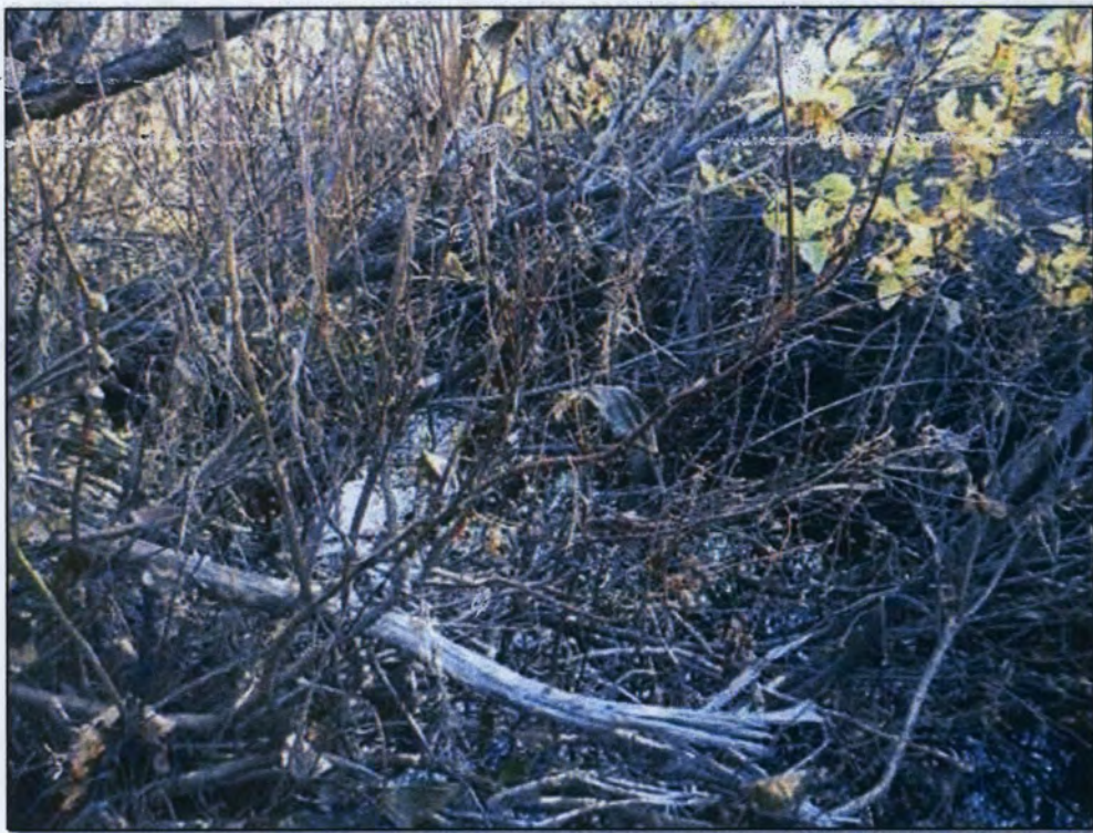
Site 9: Upstream. Photo taken September 29, 2016