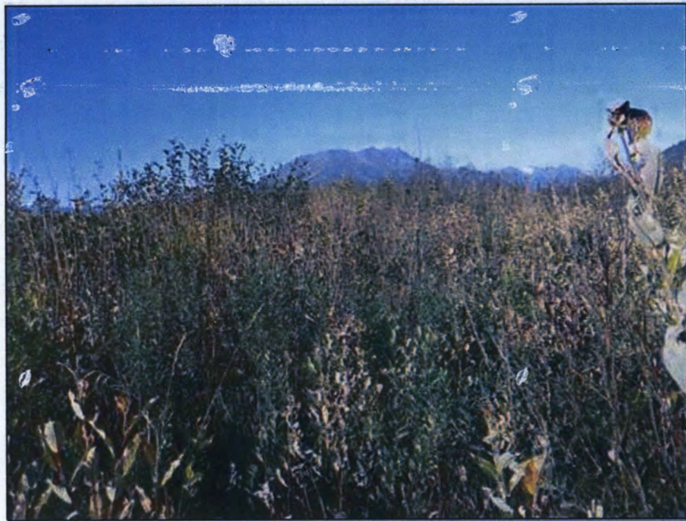
Site 26: Vegetation. Photo taken September 29, 2016