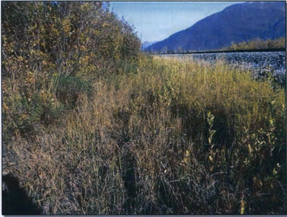
Site 12: Vegetation. Photo taken September 29, 2016