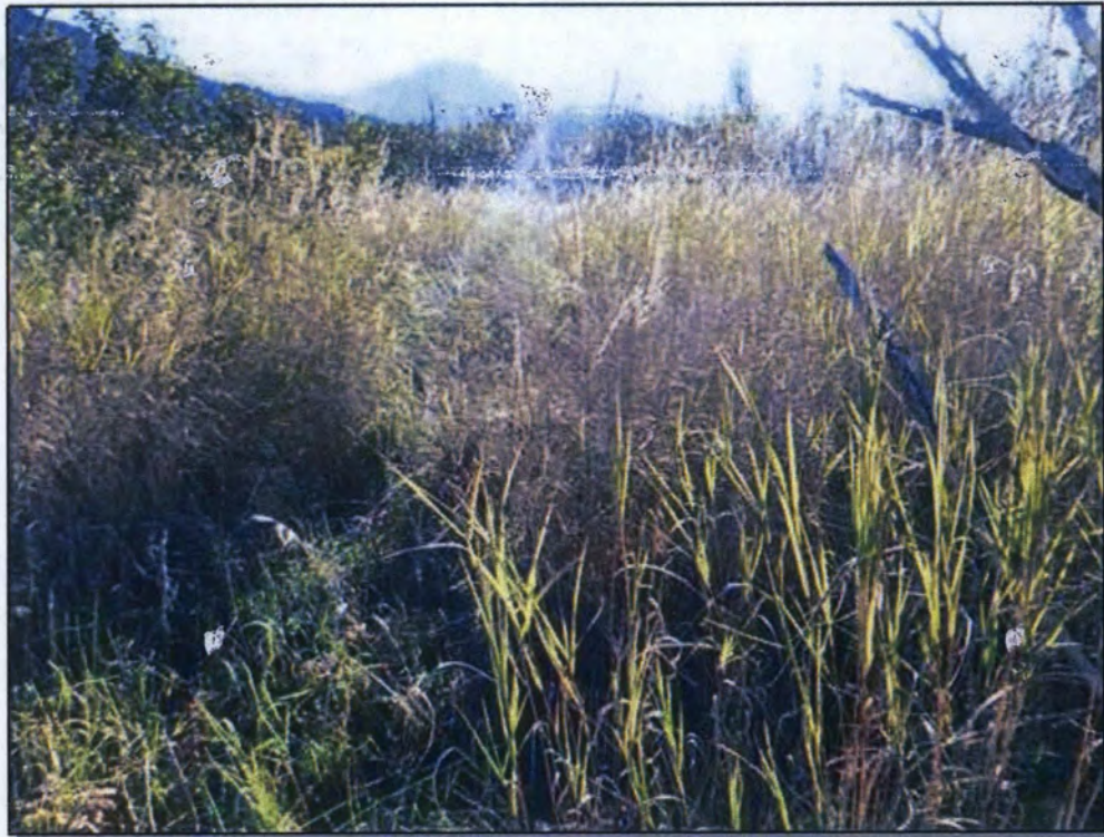
Site 20: Vegetation. Photo taken September 29, 2016