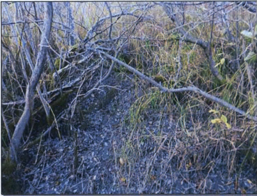
Site 45: Vegetation. Photo taken September 29, 2016