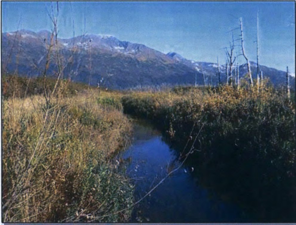
Site 23: Waterbody, upstream. Photo taken September 29, 2016