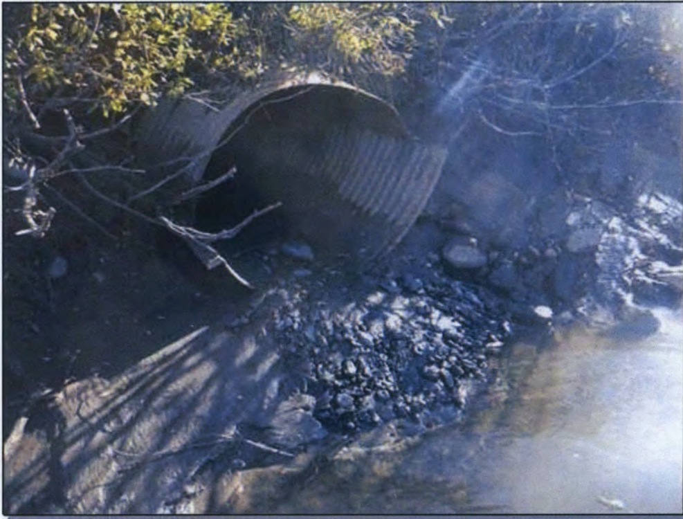
Site 15: South culvert. Photo taken September 29, 2016