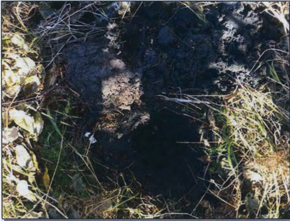
Site 64: Soil. Photo taken September 30, 2016