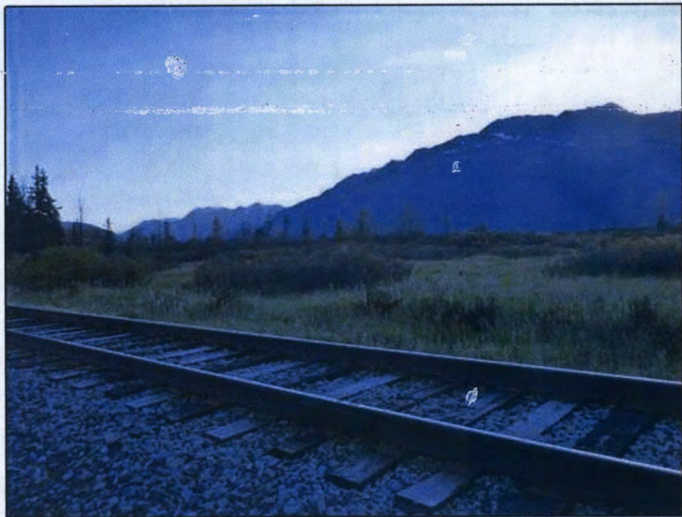
Site 40: West. Photo taken September 29, 2016