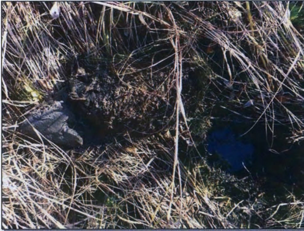
Site 14: Soil. Photo taken September 29, 2016