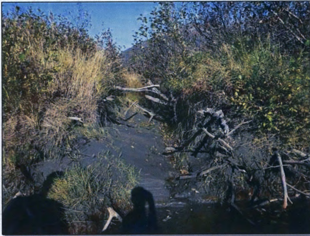
Site 27: Channel. Photo taken September 29, 2016