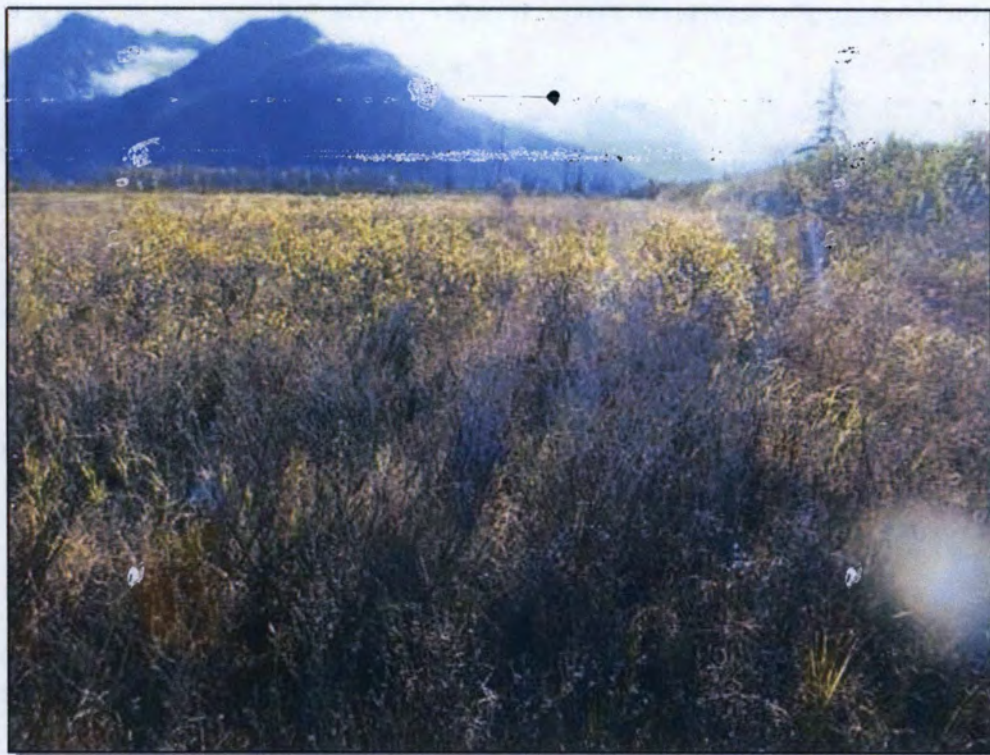
Site 67: Vegetation. Photo taken September 30, 2016