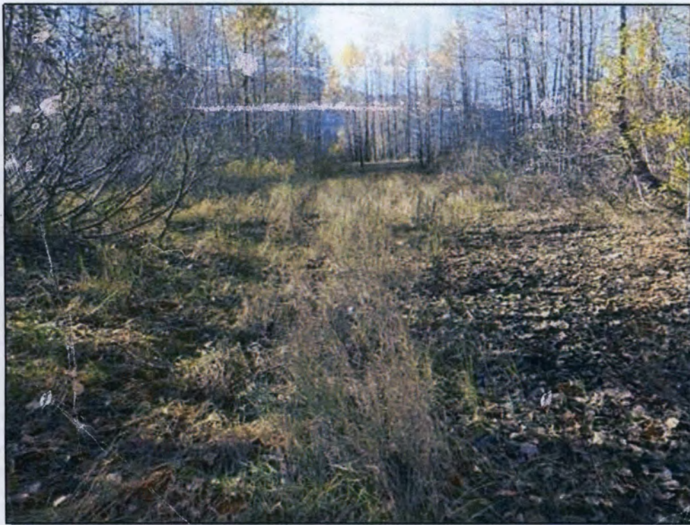
Site 71: Vegetation. Photo taken September 30, 2016