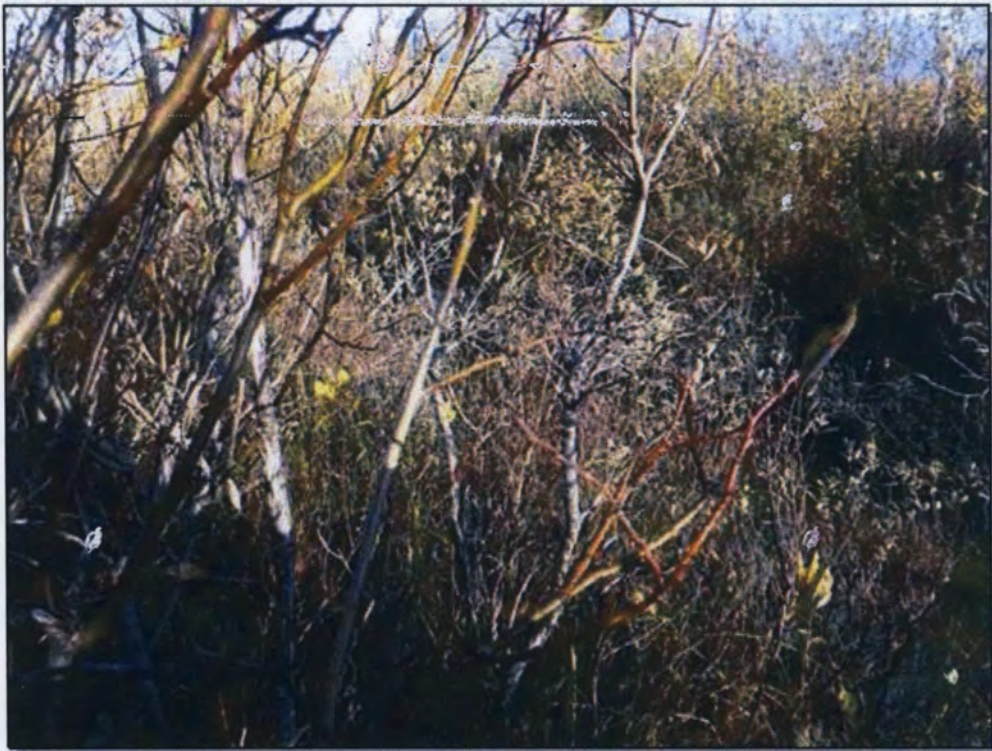
Site 50: Vegetation. Photo taken September 30, 2016