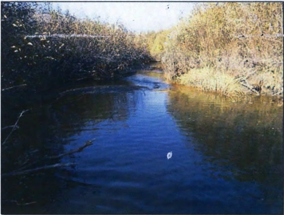
Site 17: Waterbody, downstream. Photo taken September 29, 2016