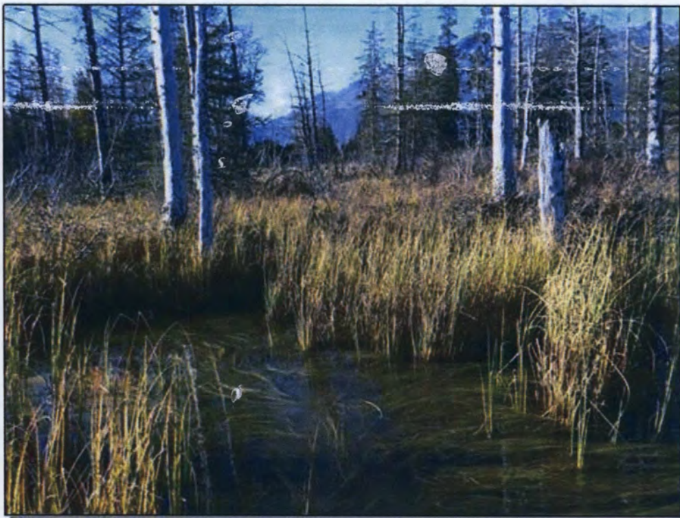
Site 54: Vegetation. Photo taken September 30, 2016