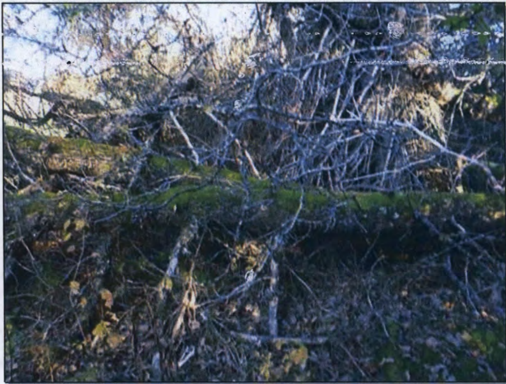
Site 48: Vegetation. Photo taken September 30, 2016