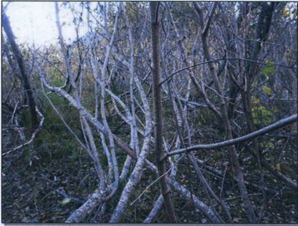
Site 42: Vegetation. Photo taken September 29, 2016