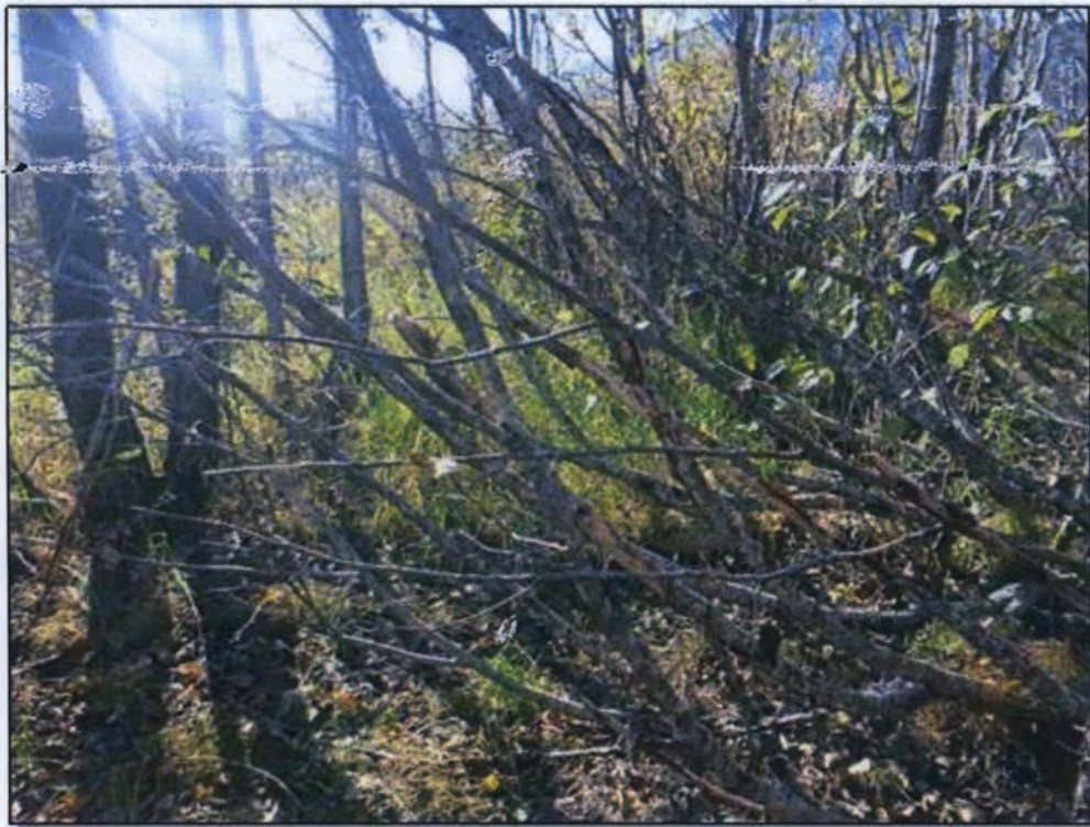
Site 69: Vegetation. Photo taken September 30, 2016