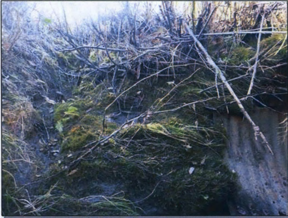
Site 9: Vegetation. Photo taken September 29, 2016