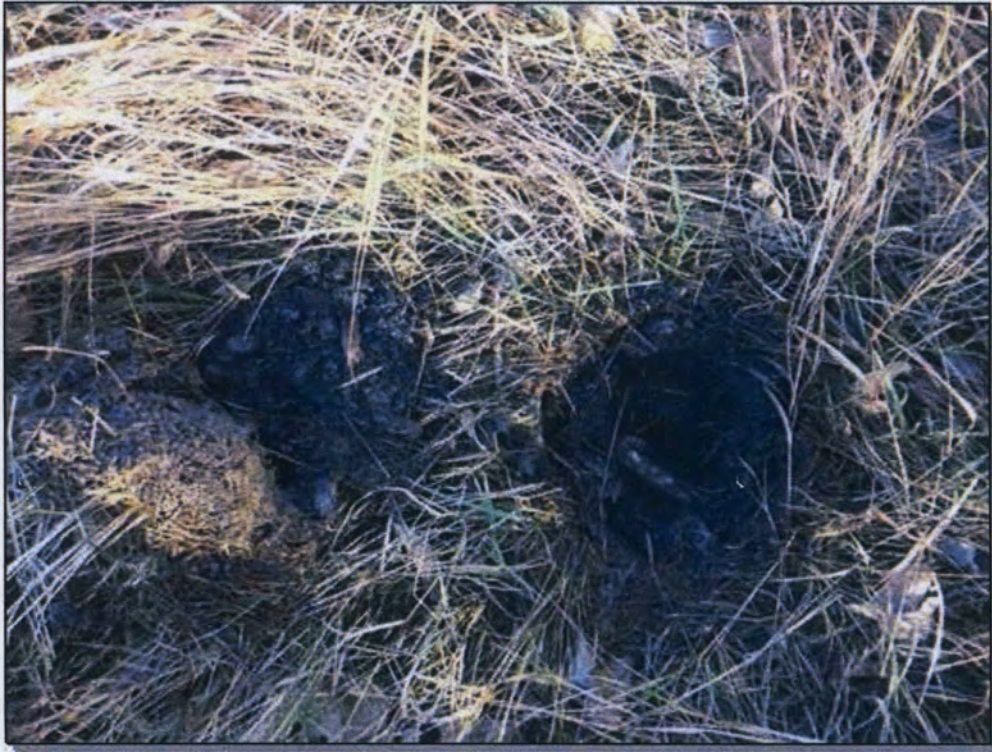
Site 53: Soil. Photo taken September 30, 2016