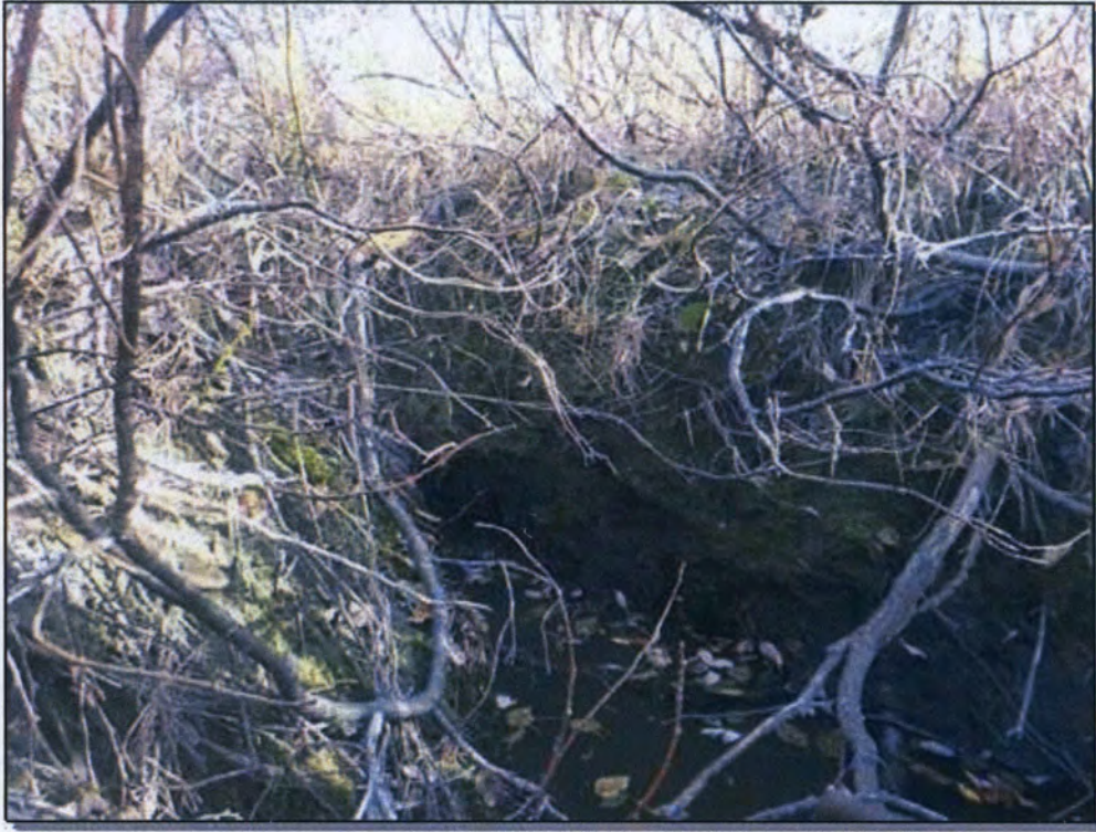
Site 4: Waterbody, upstream north. Photo taken September 29, 2016