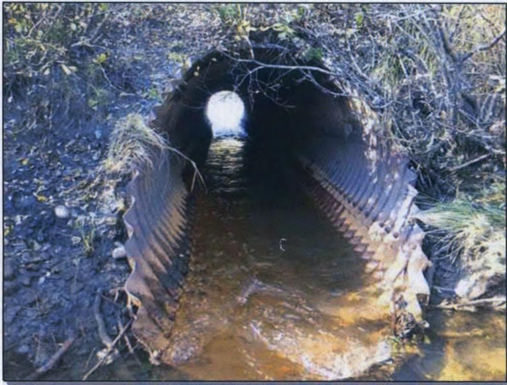
Site 16: Culvert. Photo taken September 29, 2016