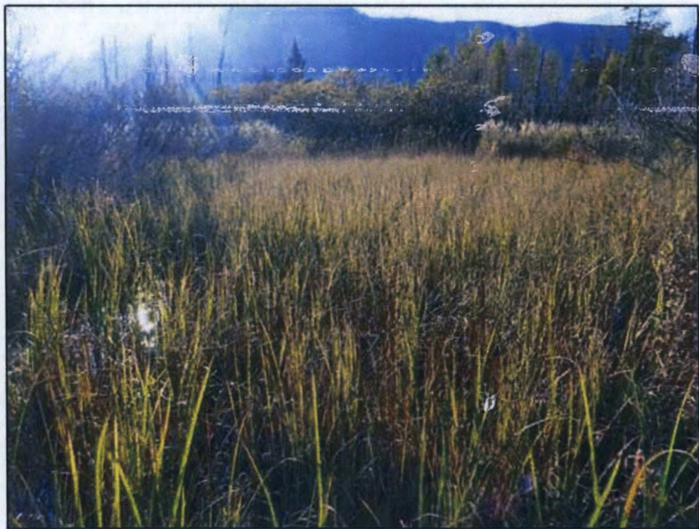
Site 34: Waterbody, downstream. Photo taken September 29, 2016