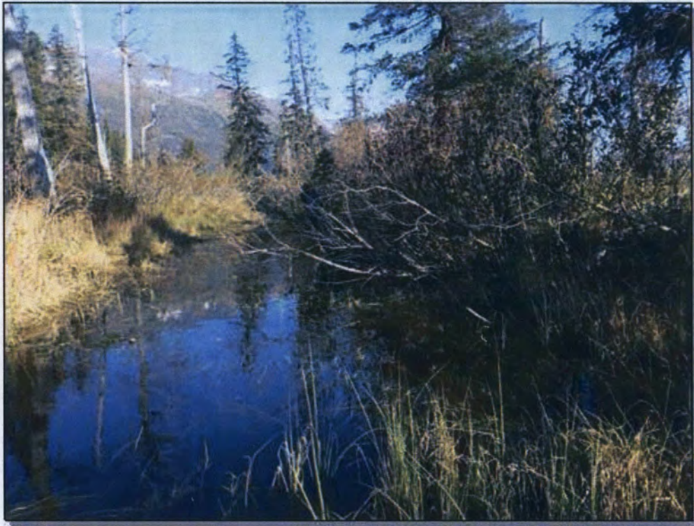
Site 34: Waterbody, upstream. Photo taken September 29, 2016