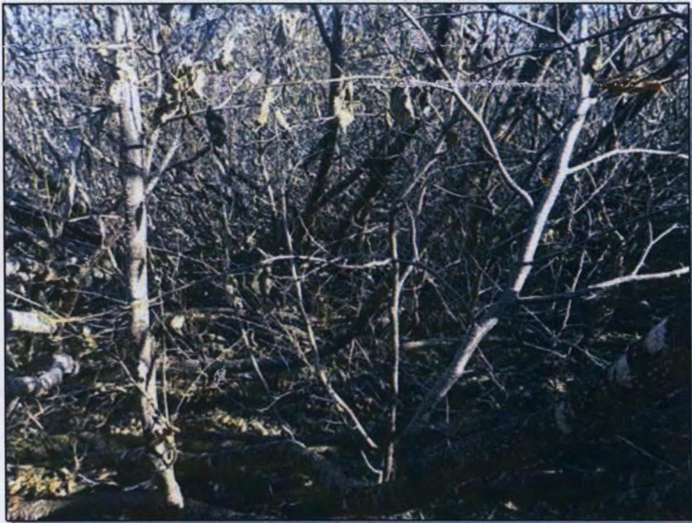
Site 11: Vegetation. Photo taken September 29, 2016