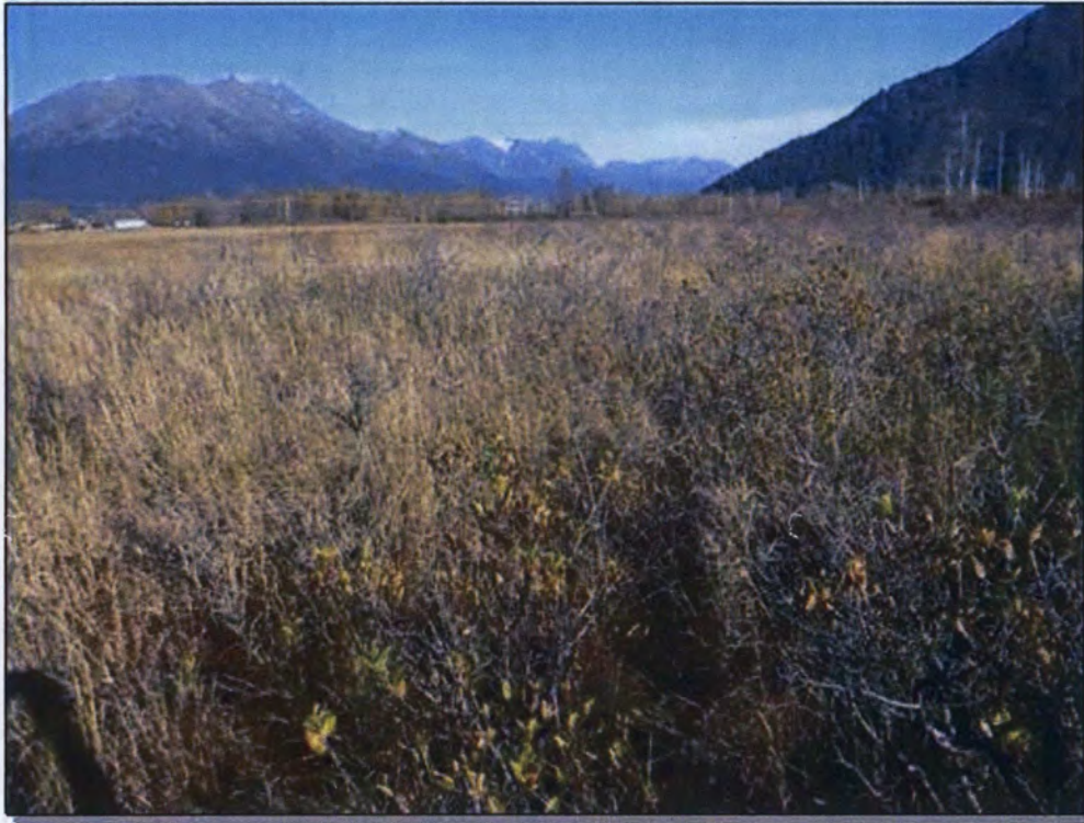
Site 58: Vegetation. Photo taken September 30, 2016