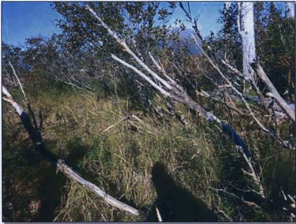
Site 60: Vegetation. Photo taken September 30, 2016