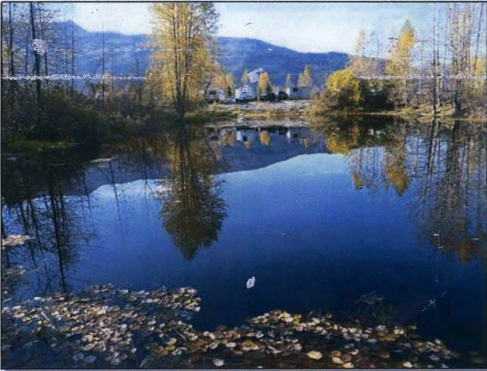
Site 70: Waterbody. Photo taken September 30, 2016