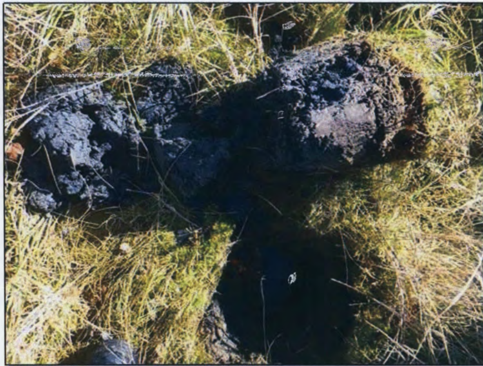
Site 62: Soil. Photo taken September 30, 2016