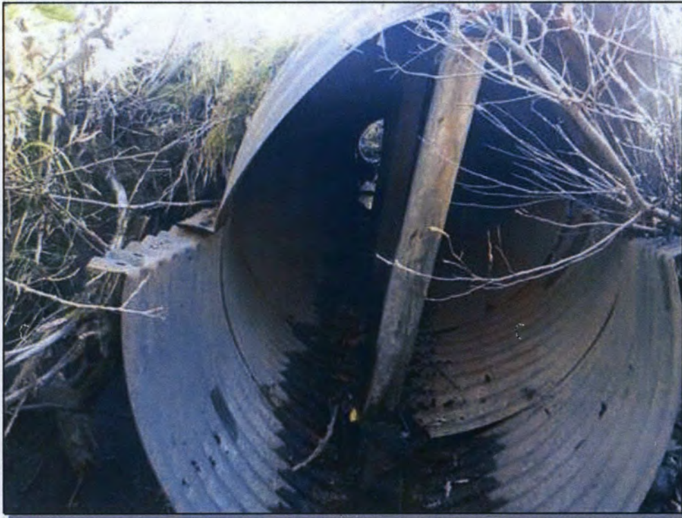
Site 10: Culvert. Photo taken September 29, 2016