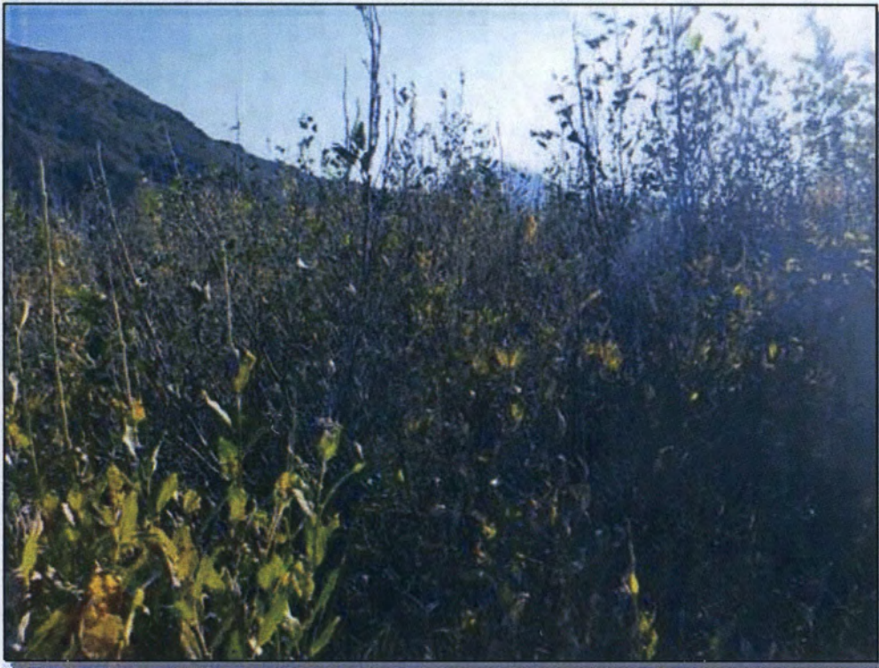
Site 26: Vegetation. Photo taken September 29, 2016