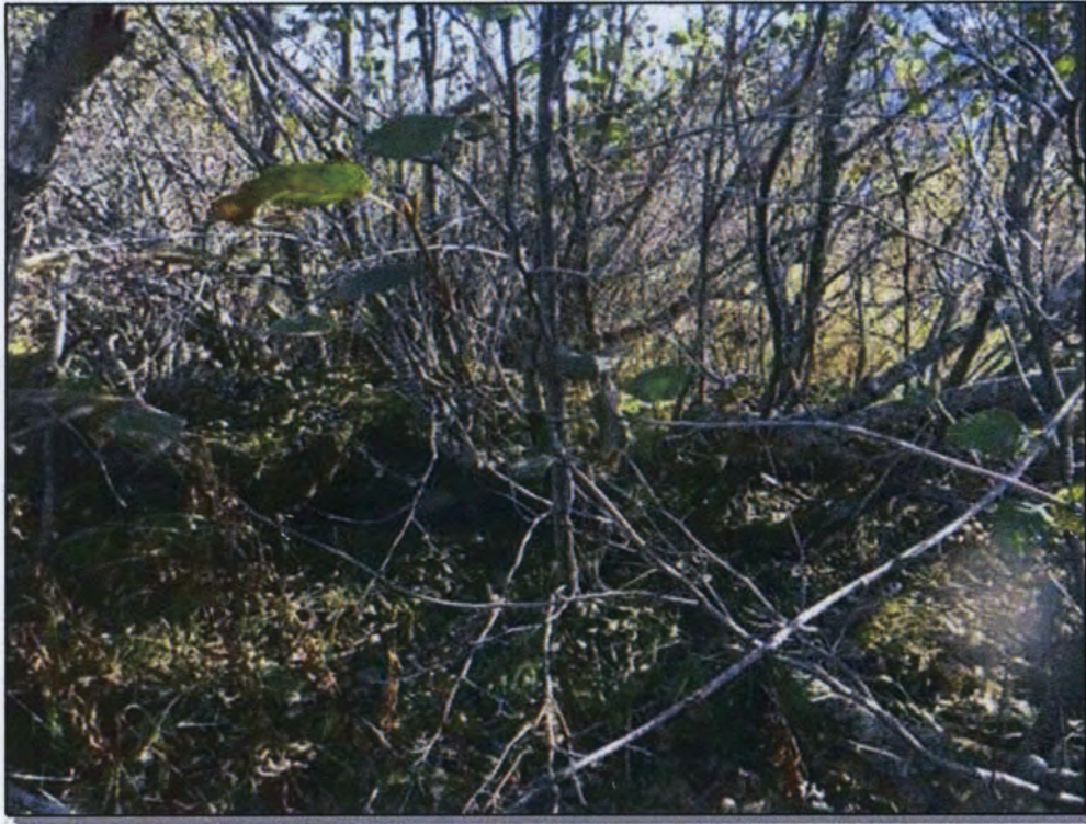
Site 64: Vegetation. Photo taken September 30, 2016