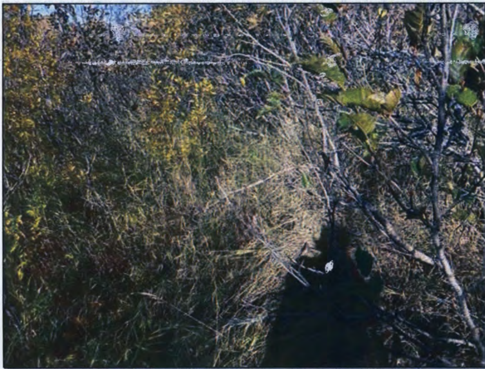
Site 14: Vegetation. Photo taken September 29, 2016