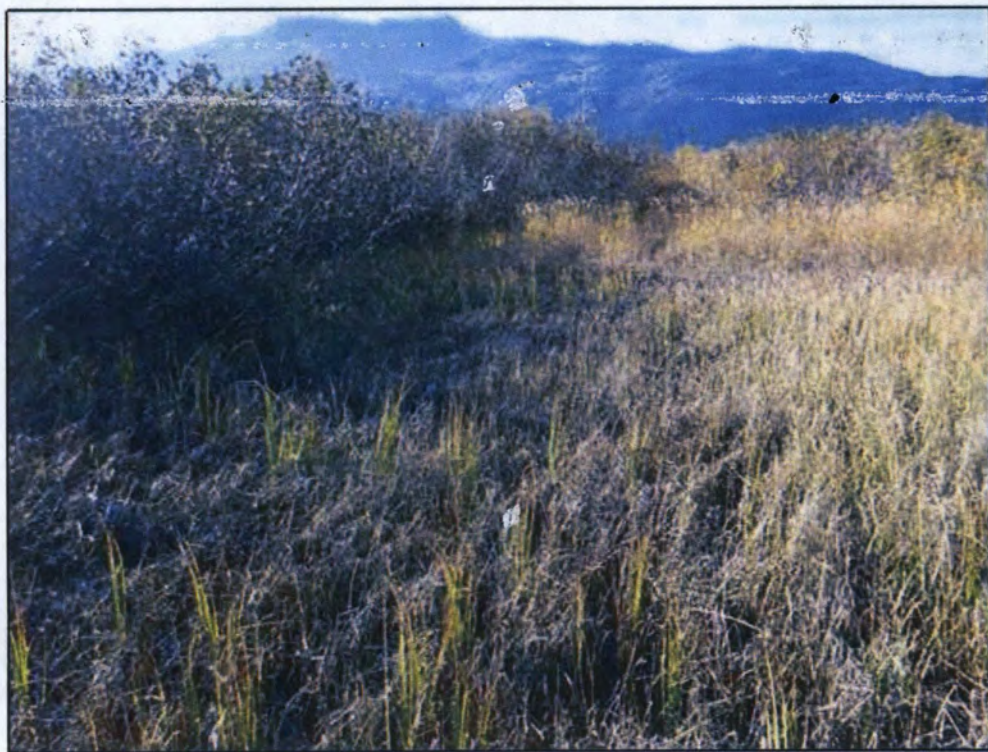
Site 22: Vegetation. Photo taken September 29, 2016