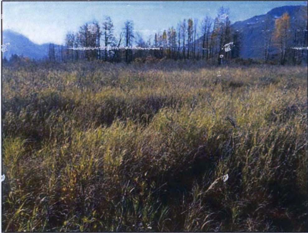
Site 58: Vegetation. Photo taken September 30, 2016