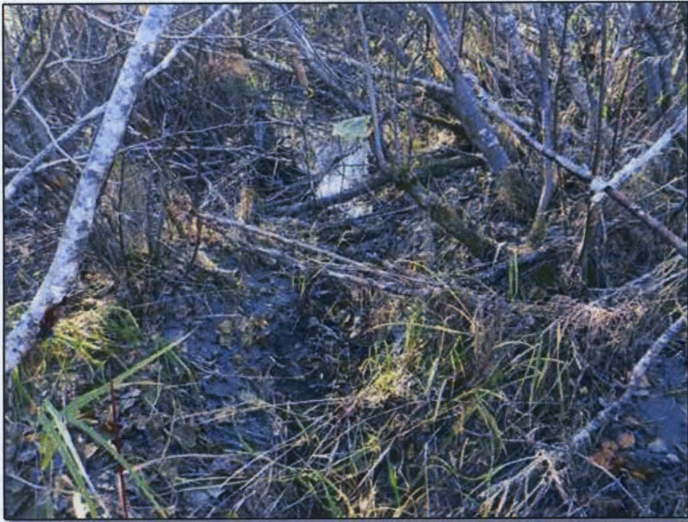
Site 35: Towards larger channel. Photo taken September 29, 2016