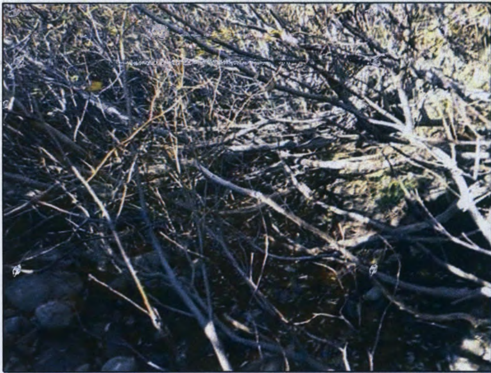
Site 10: Vegetation. Photo taken September 29, 2016