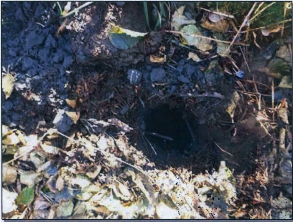
Site 28: Soil. Photo taken September 29, 2016