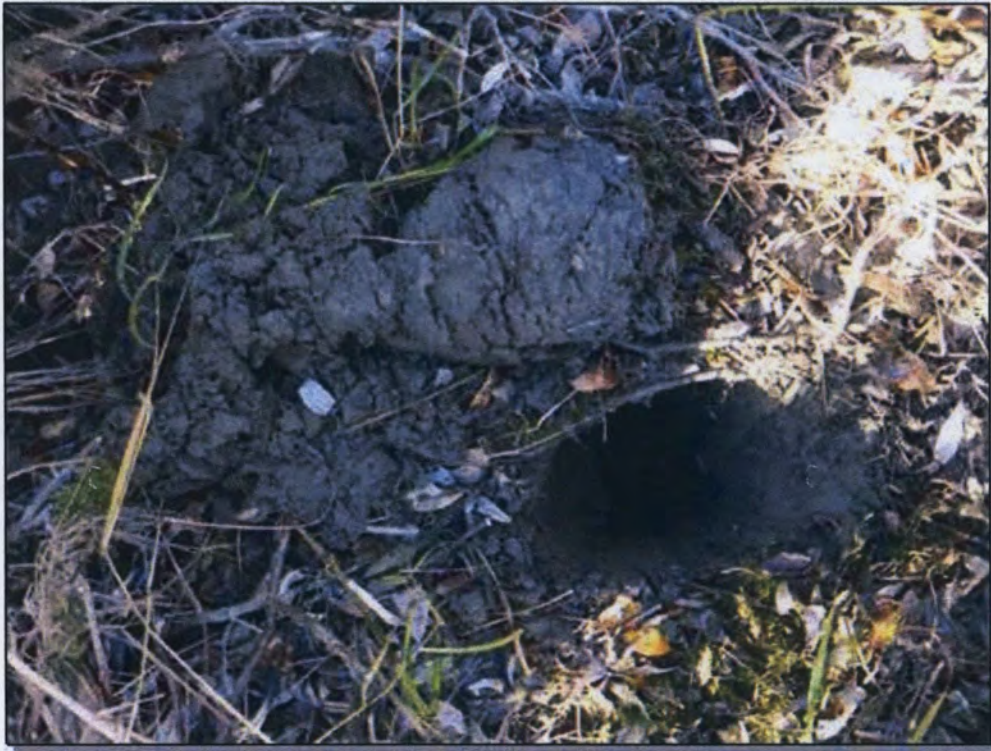
Site 50: Soil. Photo taken September 30, 2016