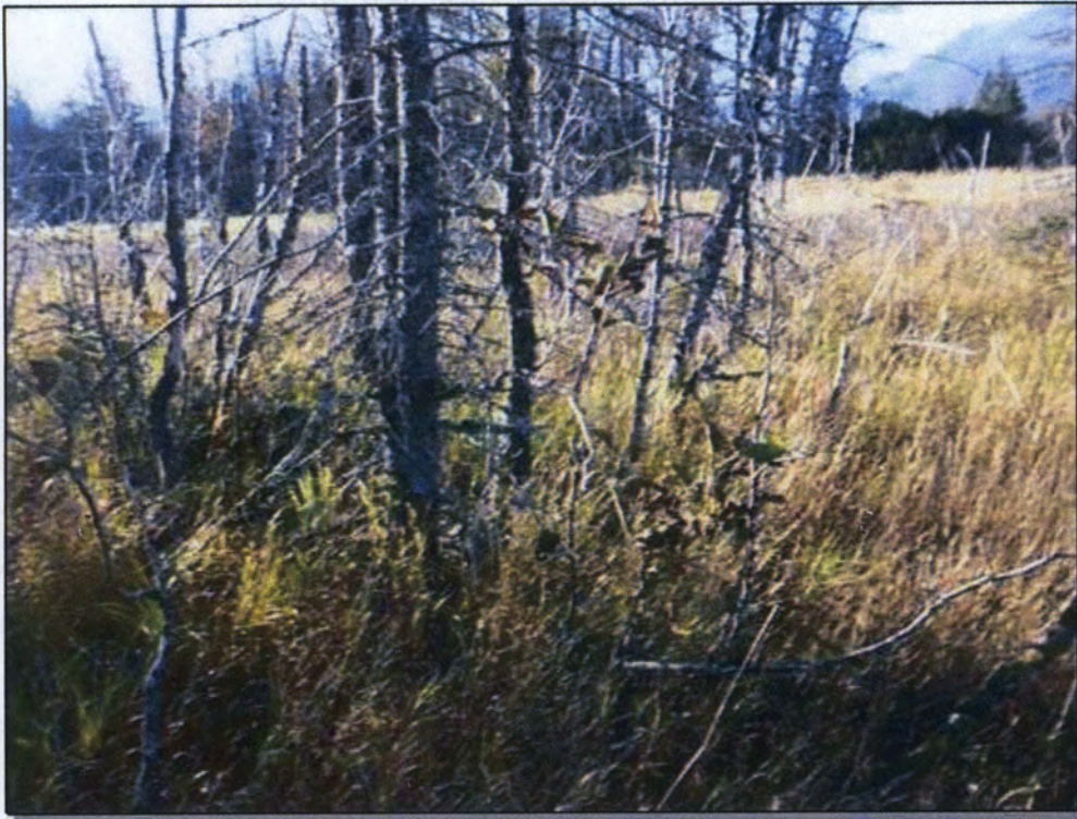
Site 53: Vegetation. Photo taken September 30, 2016