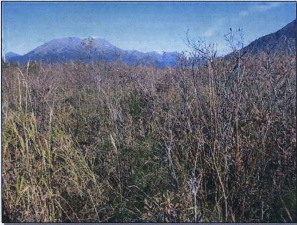
Site 57: Vegetation. Photo taken September 30, 2016