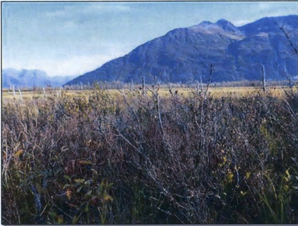
Site 52: Vegetation. Photo taken September 30, 2016