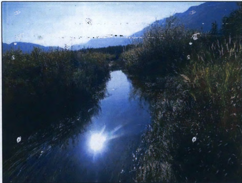
Site 23: Waterbody, downstream. Photo taken September 29, 2016