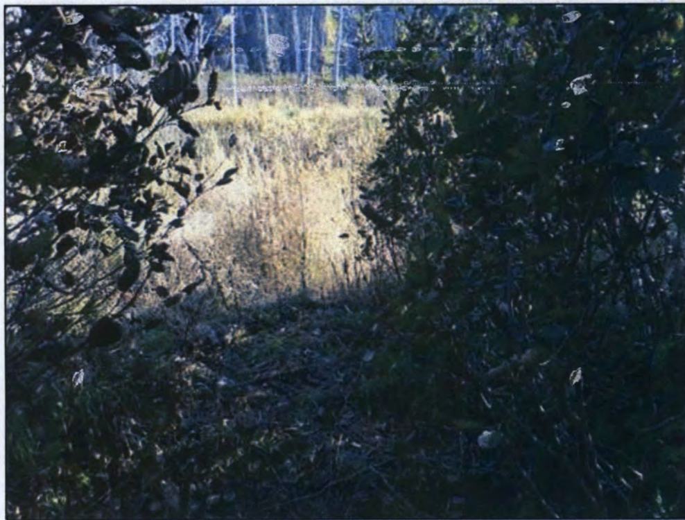
Site 24: Vegetation. Photo taken September 29, 2016