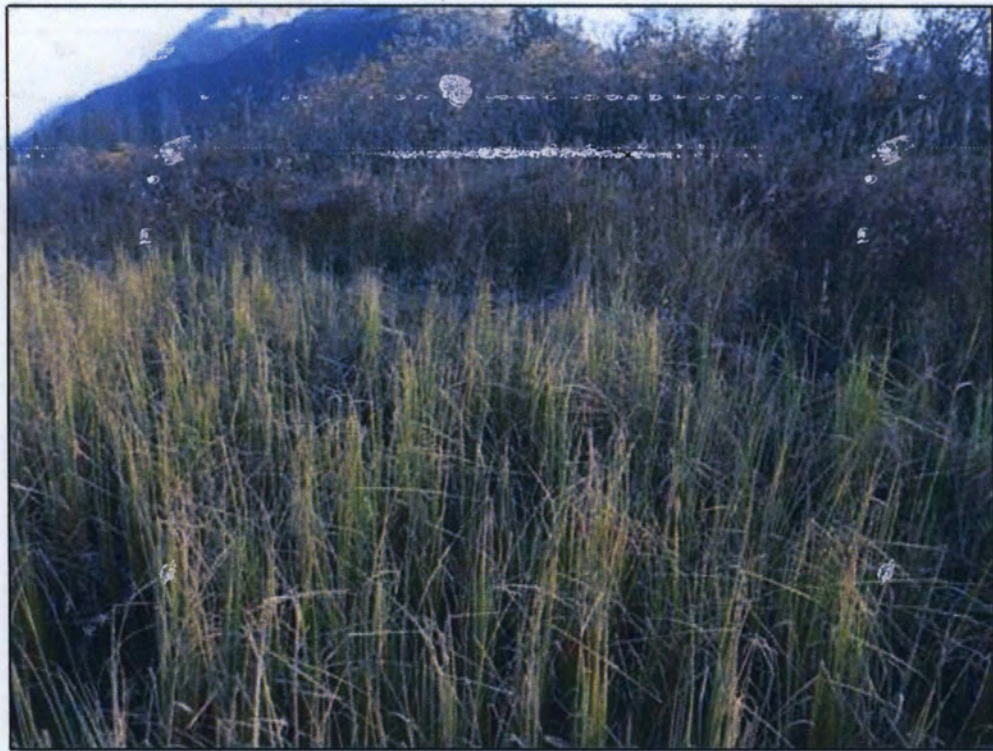
Site 44: Vegetation. Photo taken September 29, 2016