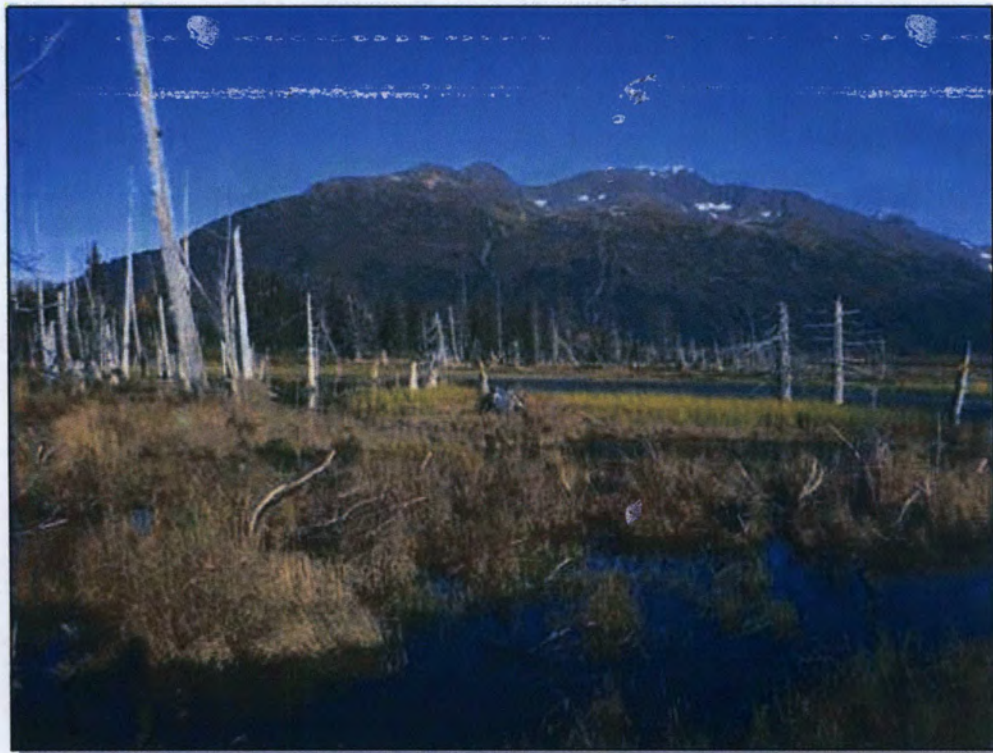
Site 29: Vegetation. Photo taken September 29, 2016