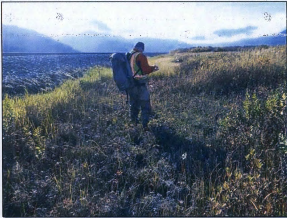
Site 12: Vegetation. Photo taken September 29, 2016