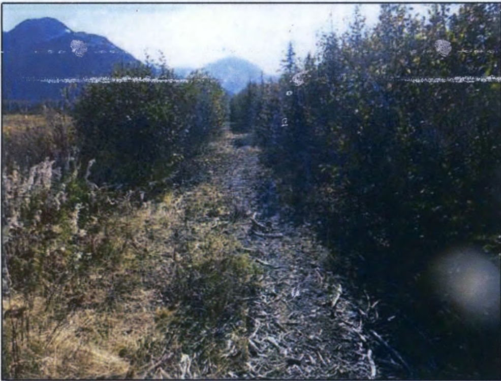
Site 66: Vegetation. Photo taken September 30, 2016