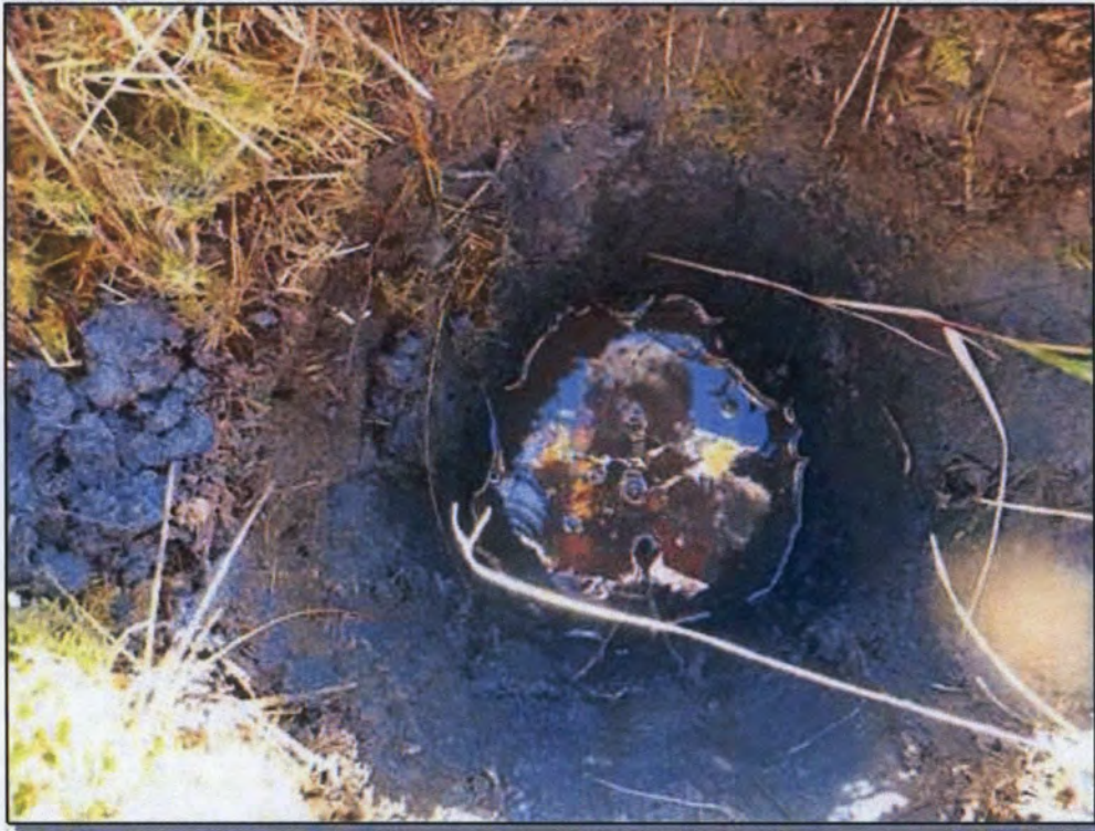
Site 62: Soil. Photo taken September 30, 2016