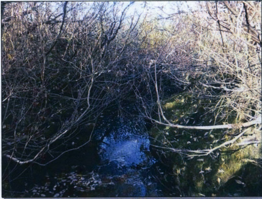
Site 4: Waterbody, downstream. Photo taken September 29, 2016