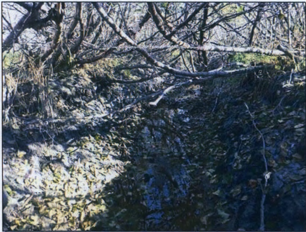
Site 18: Waterbody, downstream. Photo taken September 29, 2016