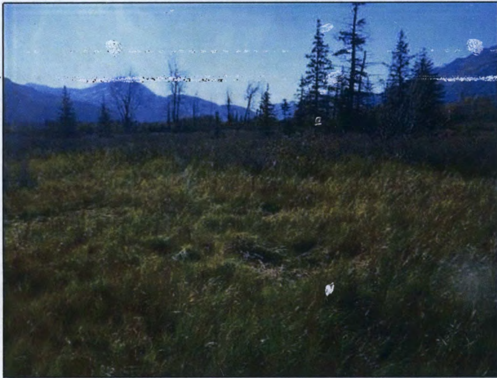
Site 62: Vegetation. Photo taken September 30, 2016