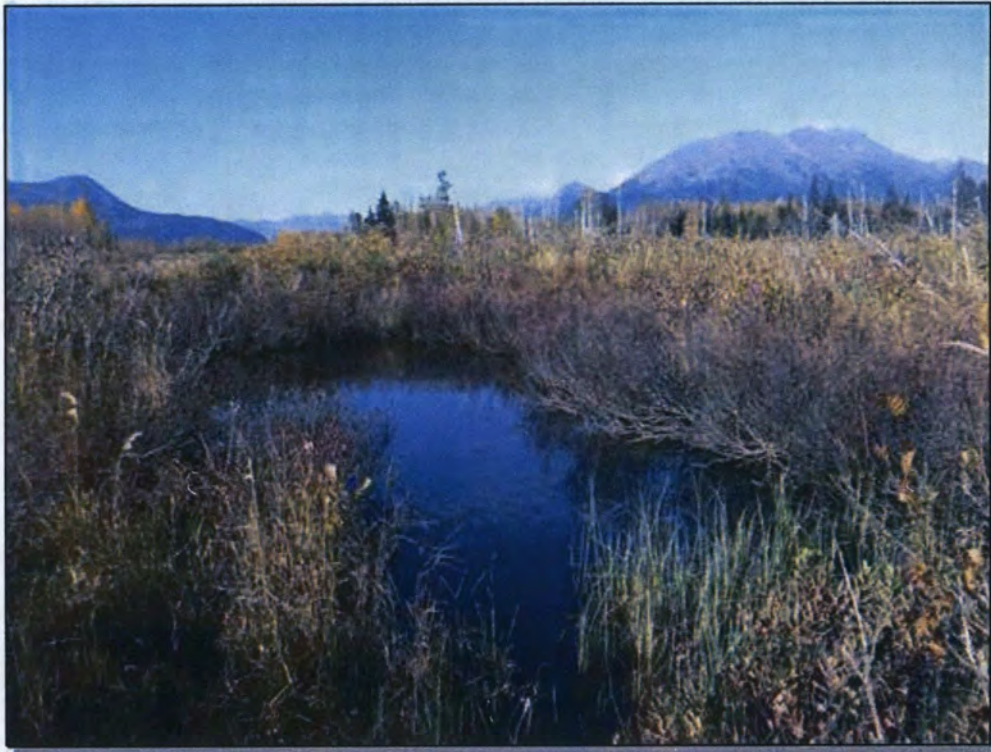
Site 20: Pond. Photo taken September 29, 2016