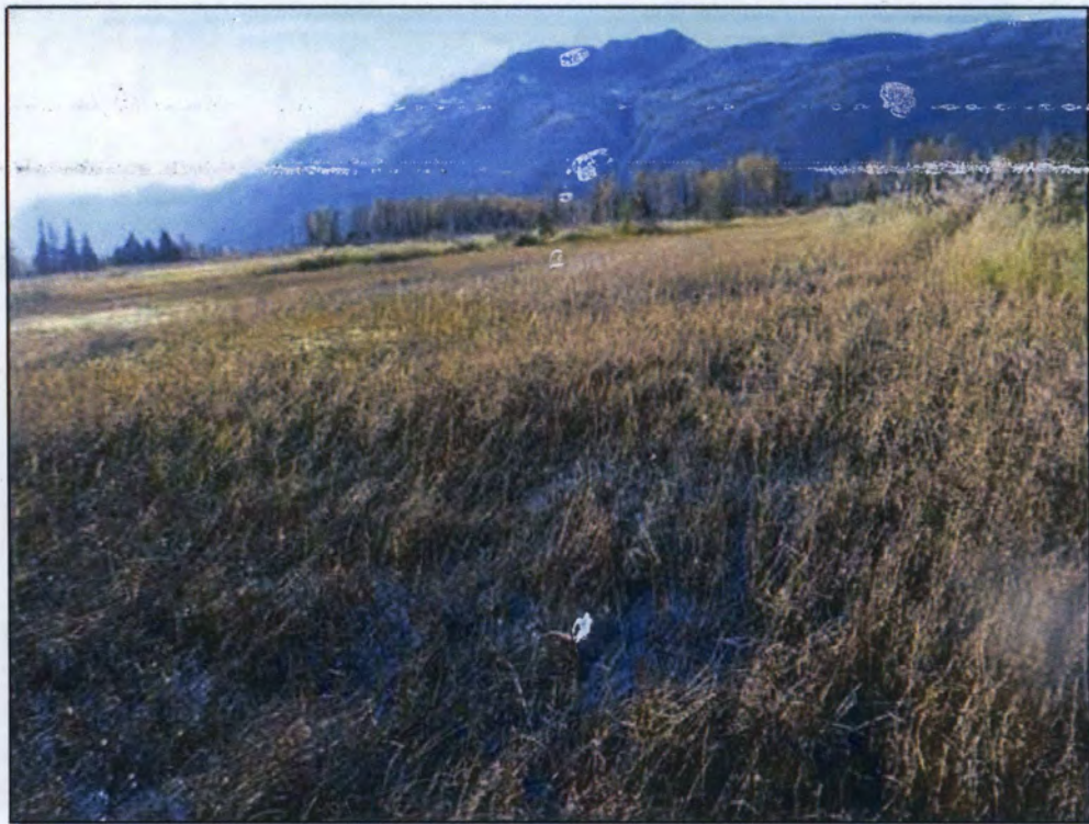
Site 65: Vegetation. Photo taken September 30, 2016