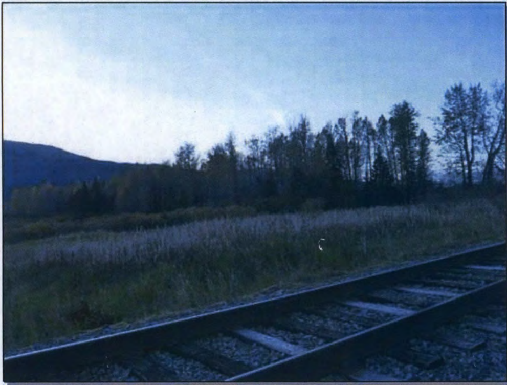
Site 40: North. Photo taken September 29, 2016