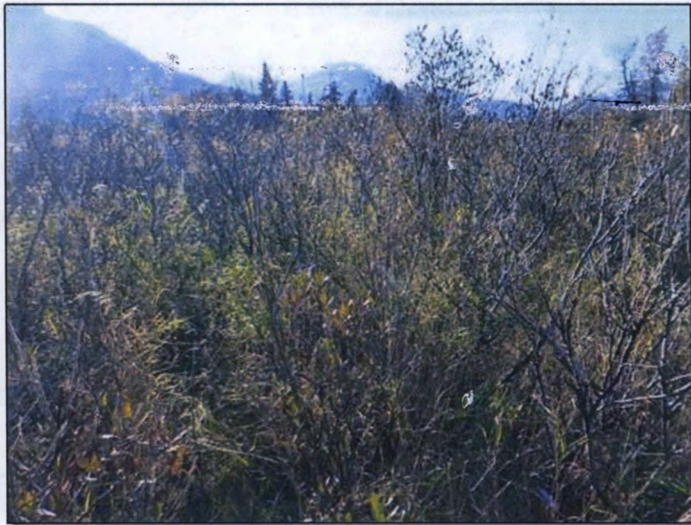
Site 57: Vegetation. Photo taken September 30, 2016