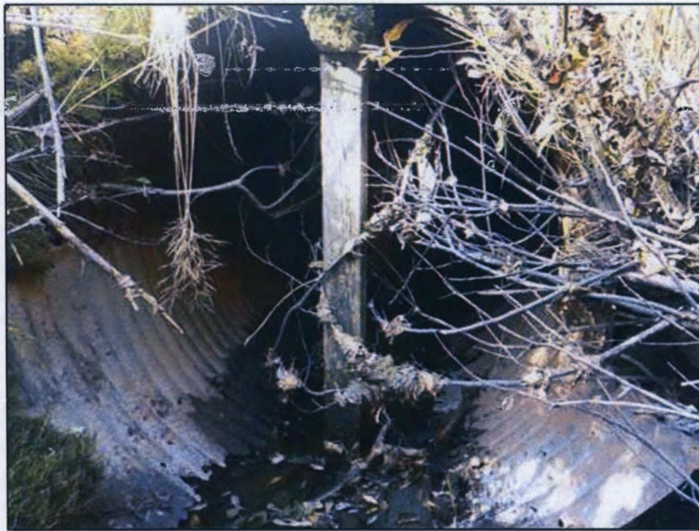
Site 9: Culvert. Photo taken September 29, 2016