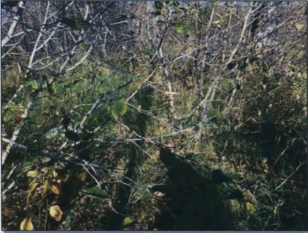
Site 69: Vegetation. Photo taken September 30, 2016