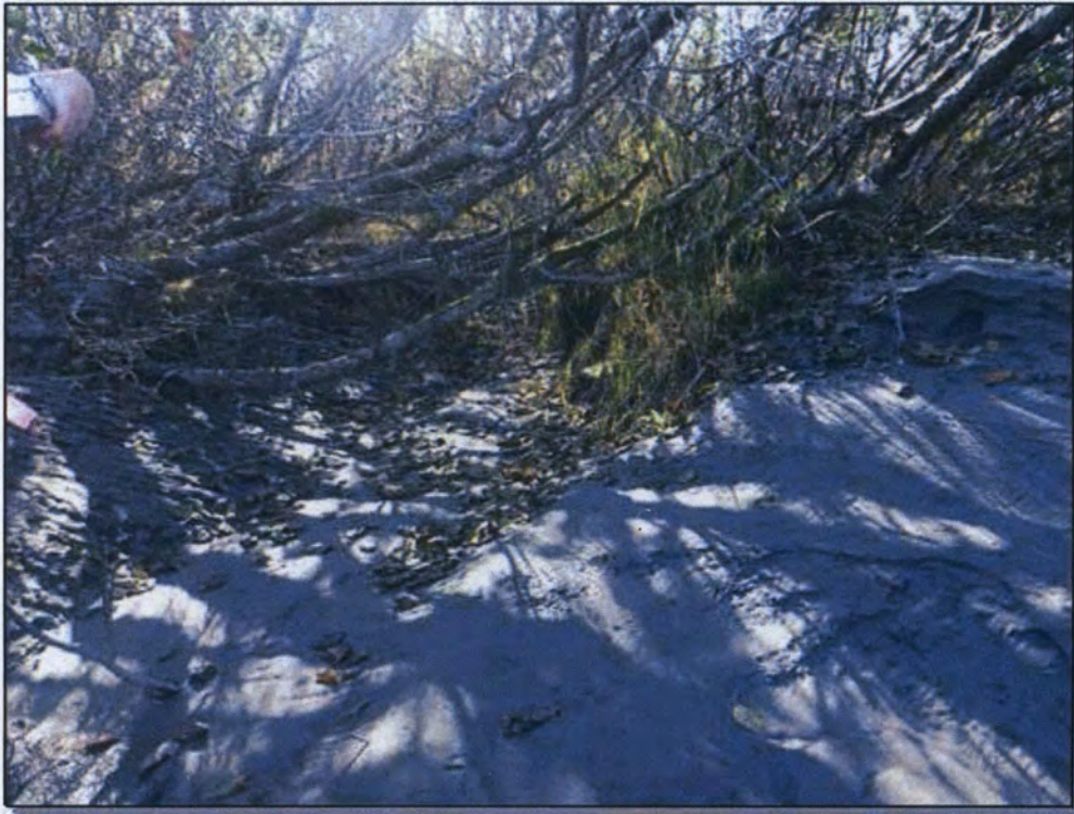
Site 17: Waterbody, upstream. Photo taken September 29, 2016