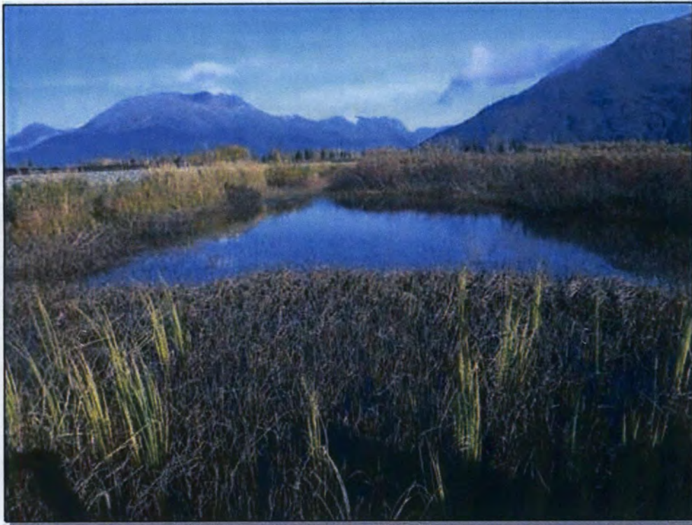
Site 7: Vegetation. Photo taken September 29, 2016