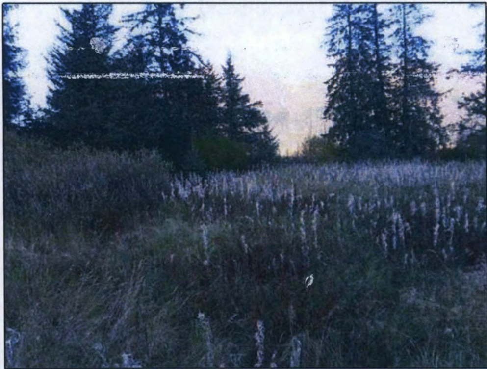
Site 40: East. Photo taken September 29, 2016