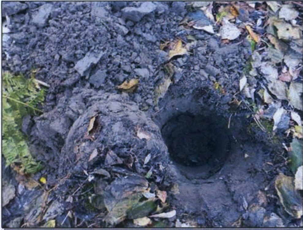
Site 42: Soil. Photo taken September 29, 2016