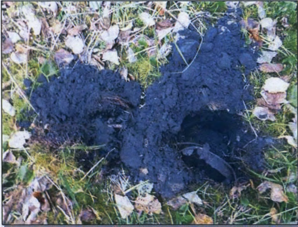
Site 48: Soil. Photo taken September 30, 2016