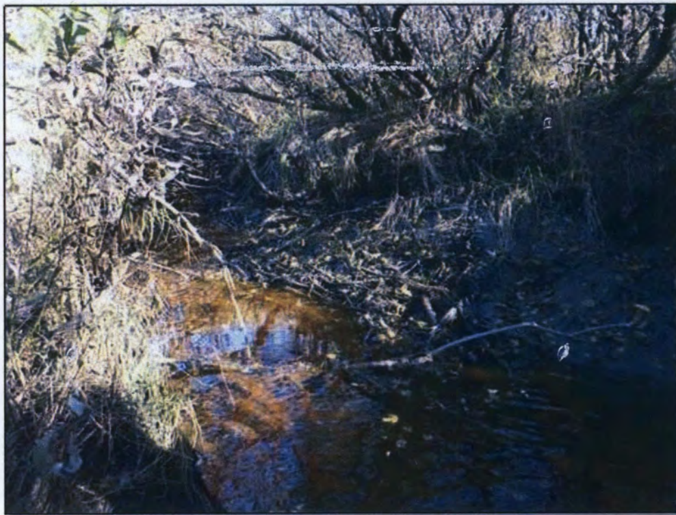
Site 30: Waterbody, upstream. Photo taken September 29, 2016