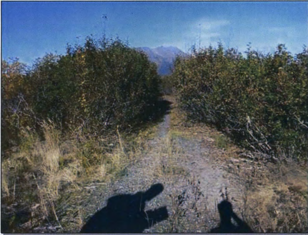
Site 66: Vegetation. Photo taken September 30, 2016