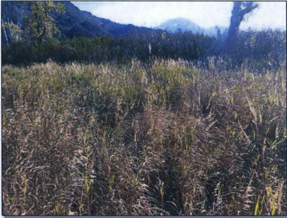
Site 25: Vegetation. Photo taken September 29, 2016