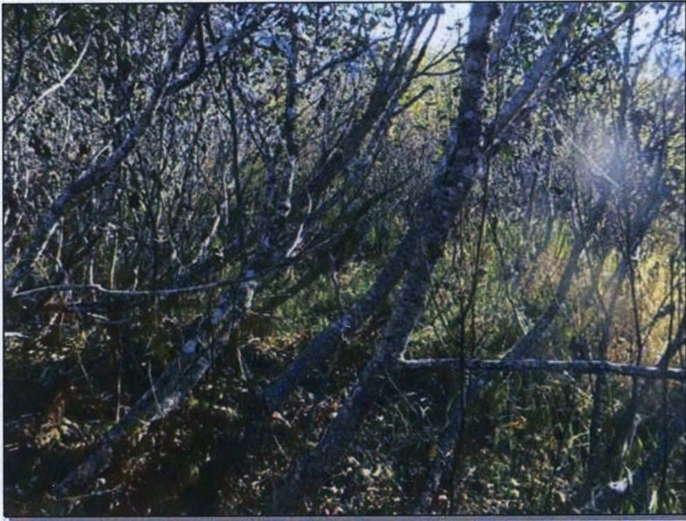
Site 28: Vegetation. Photo taken September 29, 2016