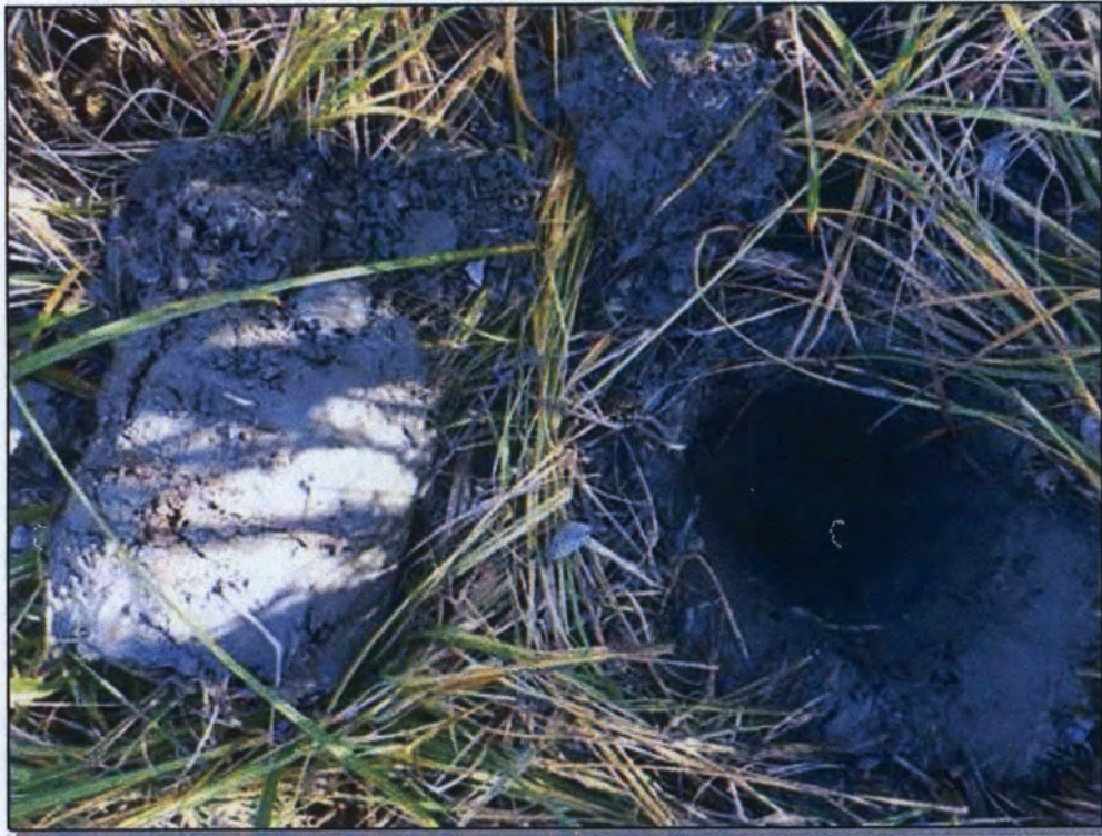
Site 26: Soil. Photo taken September 29, 2016