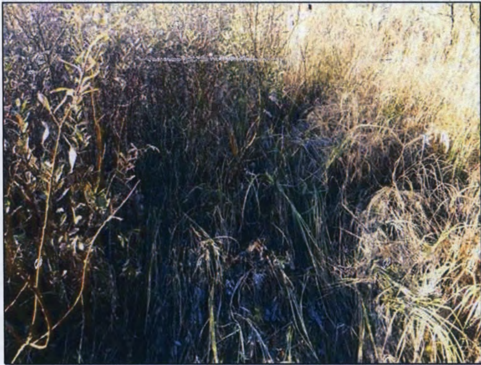
Site 5: Vegetation. Photo taken September 29, 2016