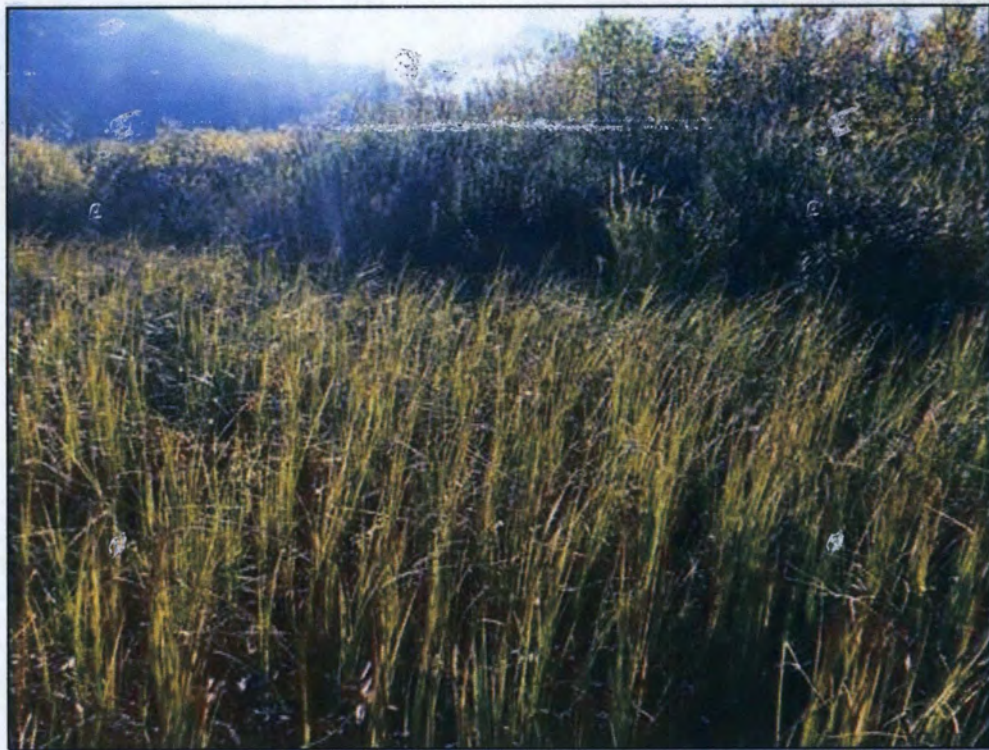
Site 7: Vegetation. Photo taken September 29, 2016