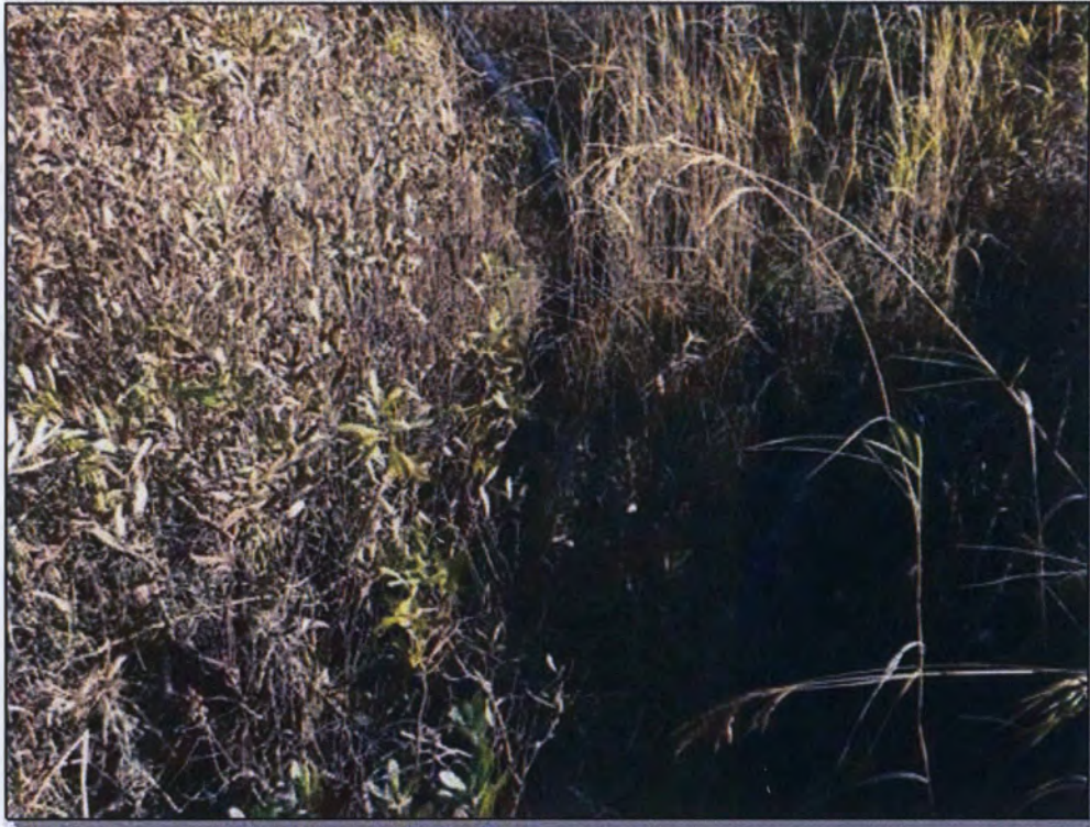
Site 55: Vegetation. Photo taken September 30, 2016