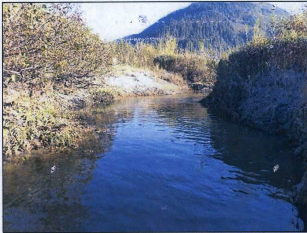
Site 27: Upstream. Photo taken September 29, 2016