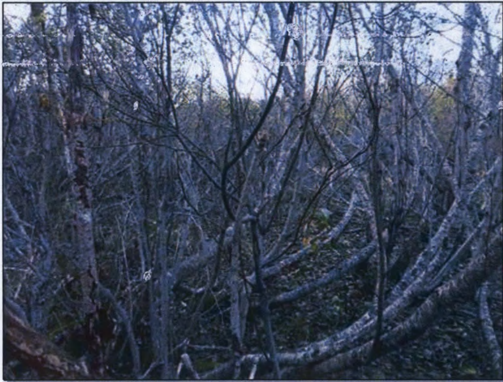
Site 42: Vegetation. Photo taken September 29, 2016