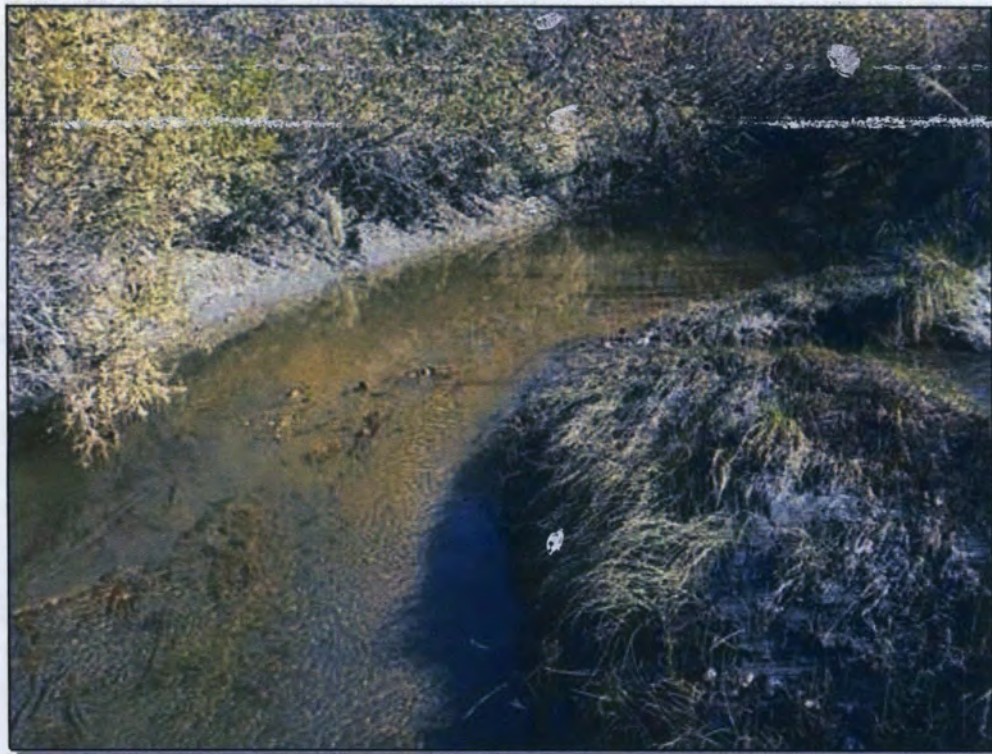
Site 16: Waterbody, upstream. Photo taken September 29, 2016