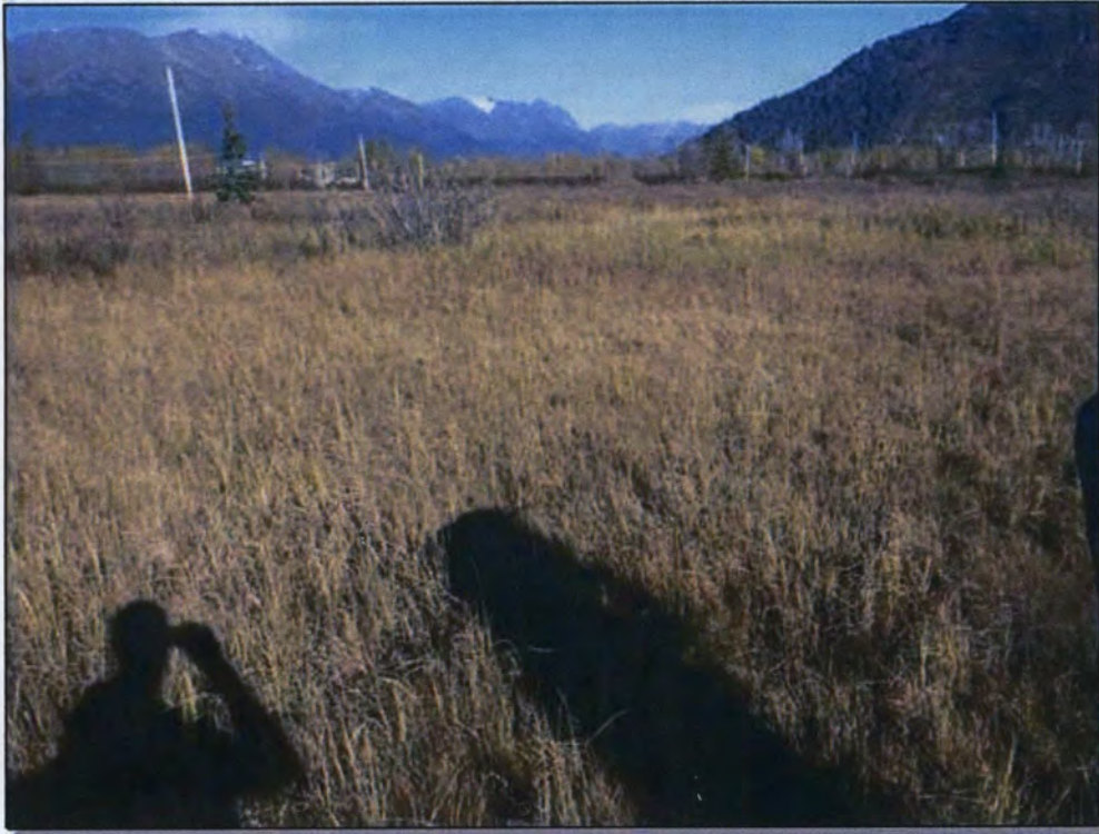
Site 61: Vegetation. Photo taken September 30, 2016