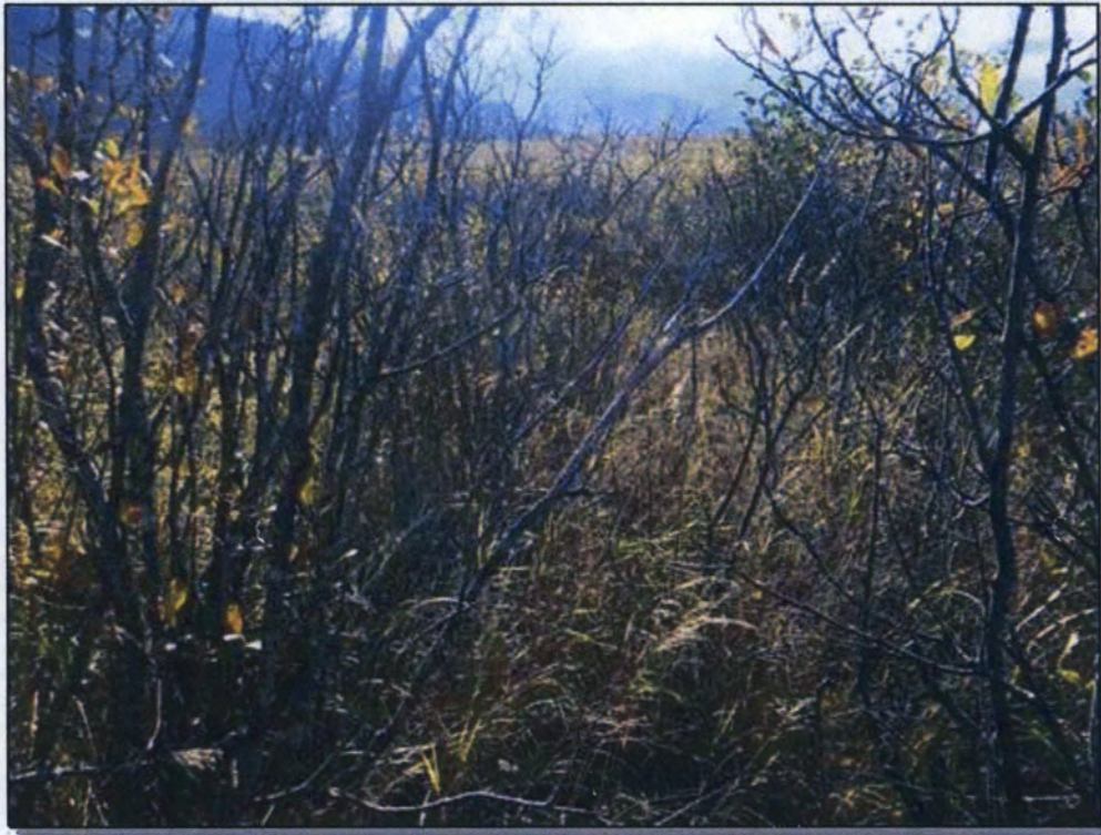
Site 14: Vegetation. Photo taken September 29, 2016