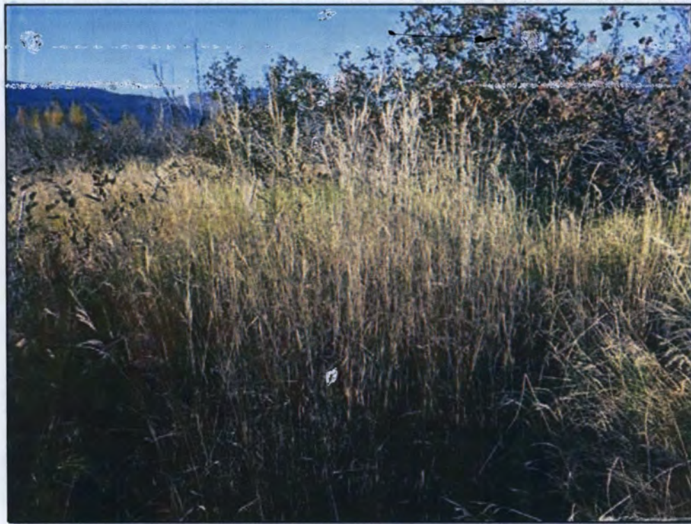
Site 21: Vegetation. Photo taken September 29, 2016