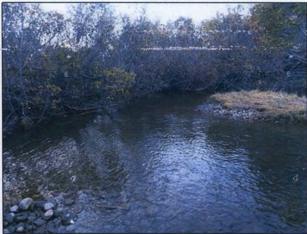
Site 41: Downstream. Photo taken September 29, 2016