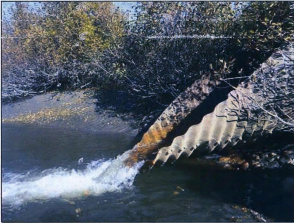
Site 15: North culvert. Photo taken September 29, 2016