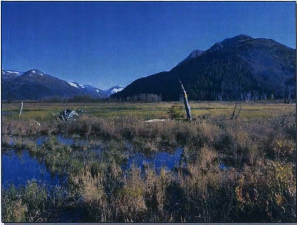
Site 29: Vegetation. Photo taken September 29, 2016