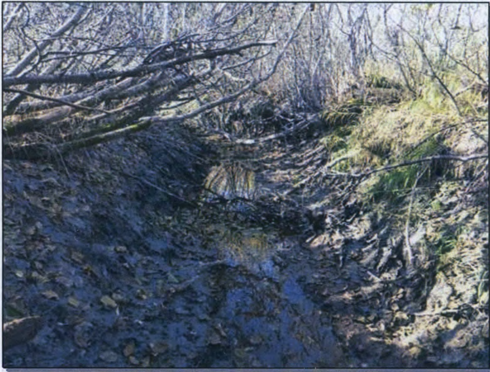
Site 18: Waterbody, upstream. Photo taken September 29, 2016