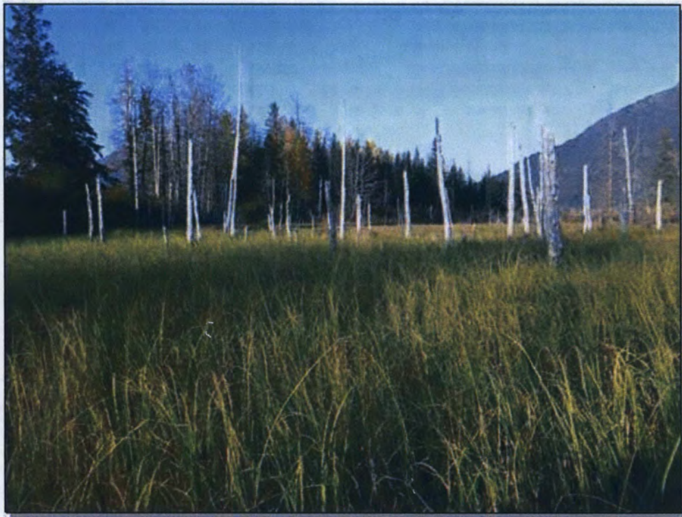
Site 37: Vegetation. Photo taken September 29, 2016