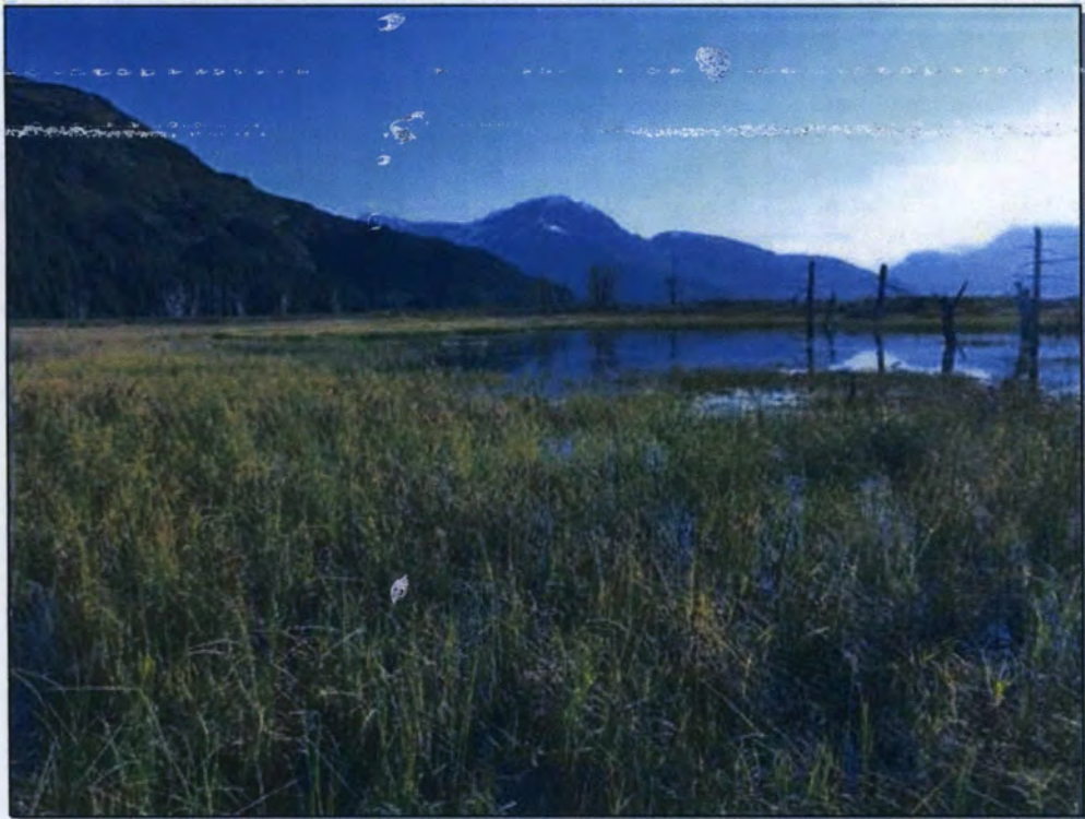
Site 32: Vegetation. Photo taken September 29, 2016