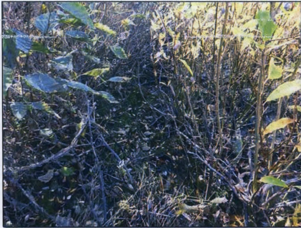
Site 8: Vegetation. Photo taken September 29, 2016