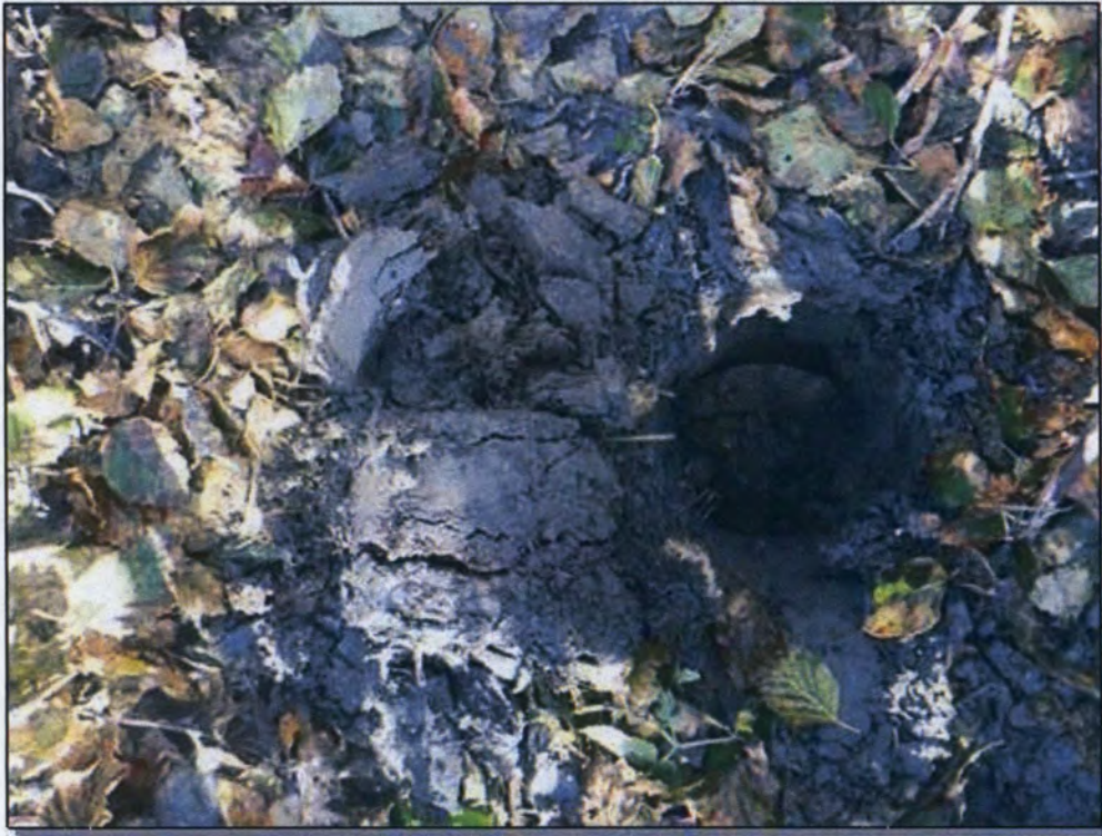
Site 11: Soil. Photo taken September 29, 2016