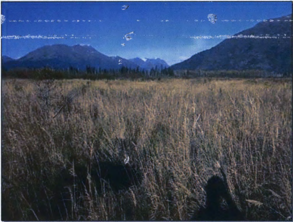
Site 25: Vegetation. Photo taken September 29, 2016