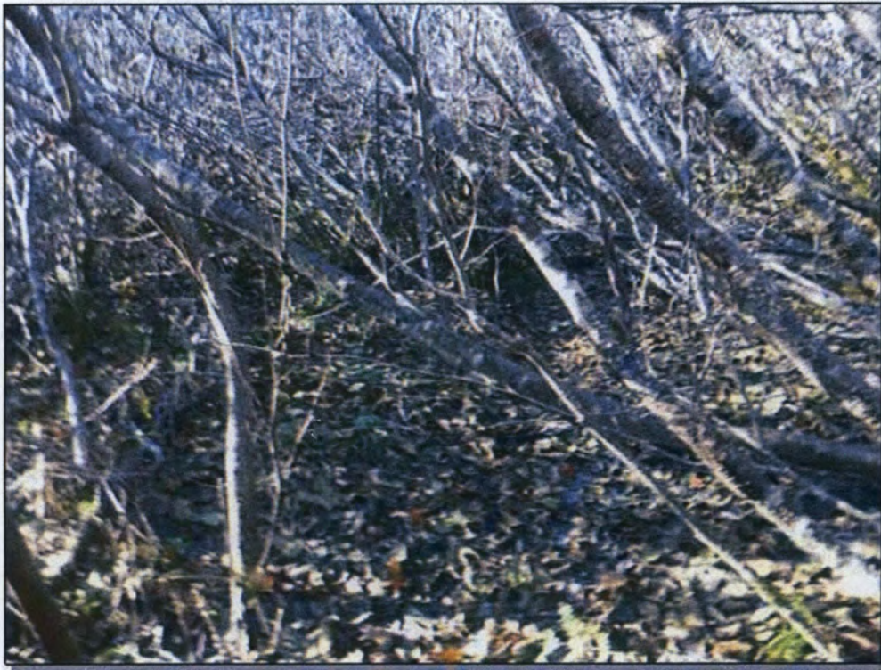
Site 11: Vegetation. Photo taken September 29, 2016