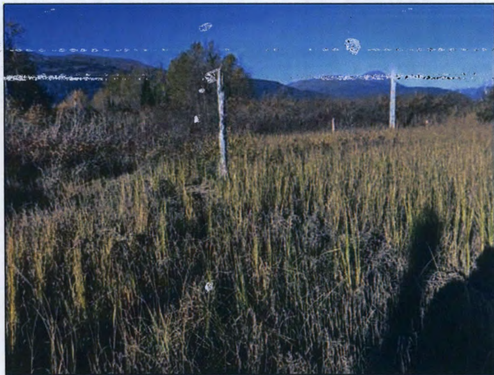
Site 51: Vegetation. Photo taken September 30, 2016