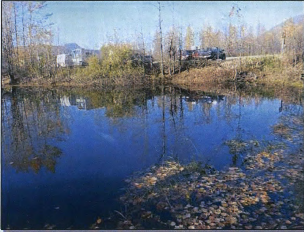
Site 70: Waterbody. Photo taken September 30, 2016