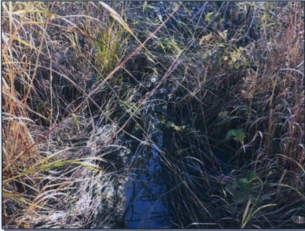
Site 21: Vegetation. Photo taken September 29, 2016