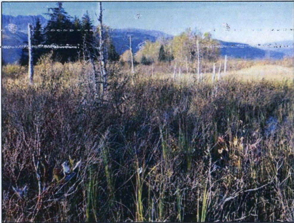
Site 52: Vegetation. Photo taken September 30, 2016