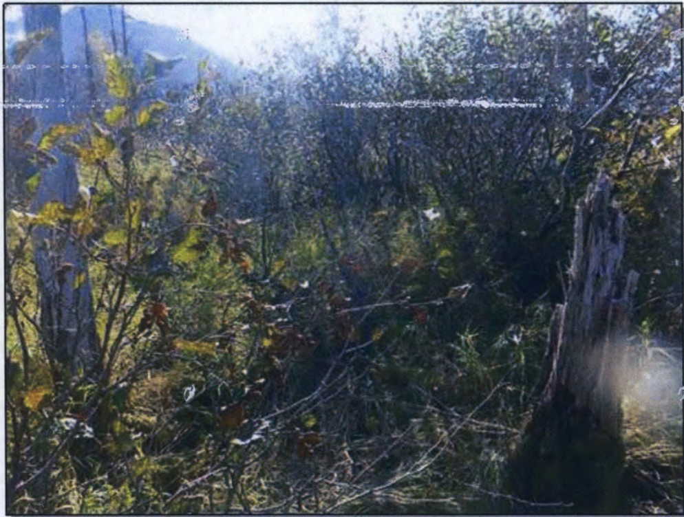
Site 60: Vegetation. Photo taken September 30, 2016