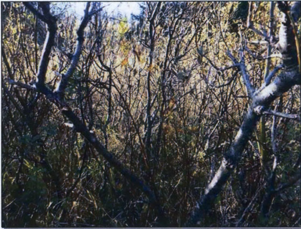
Site 50: Vegetation. Photo taken September 30, 2016