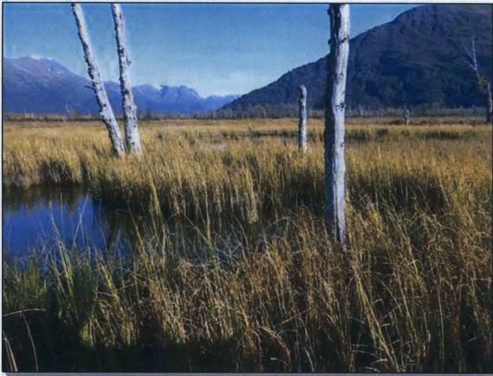
Site 54: Vegetation. Photo taken September 30, 2016