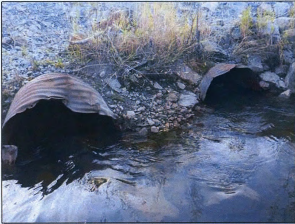
Site 43: Culvert. Photo taken September 29, 2016