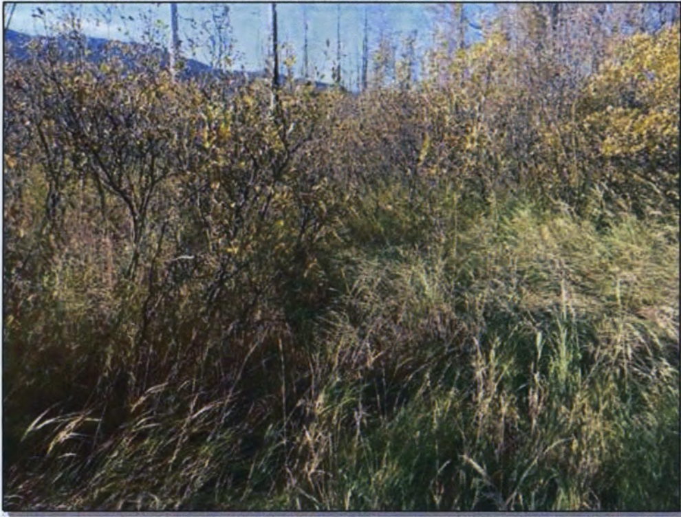
Site 68: Vegetation. Photo taken September 30, 2016