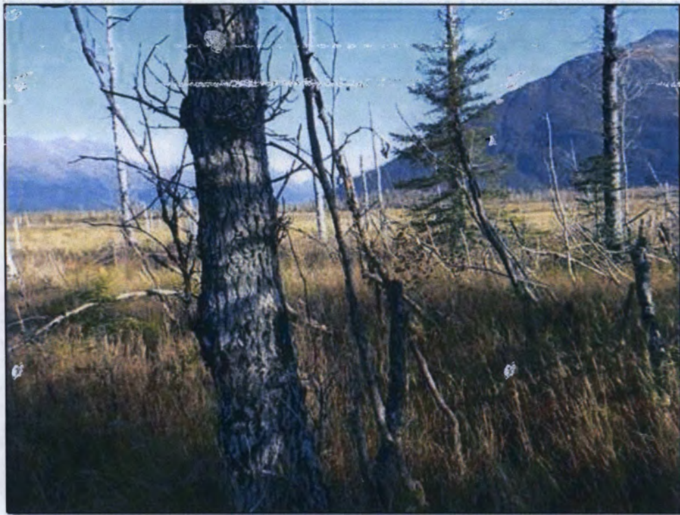
Site 53: Vegetation. Photo taken September 30, 2016