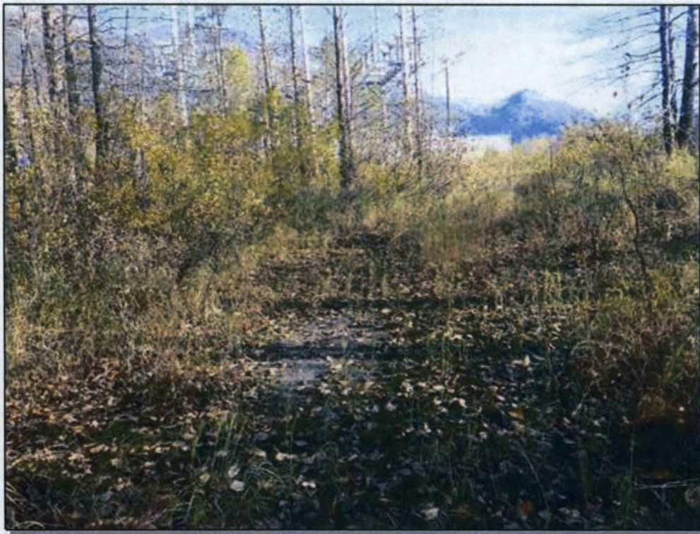
Site 71: Vegetation. Photo taken September 30, 2016