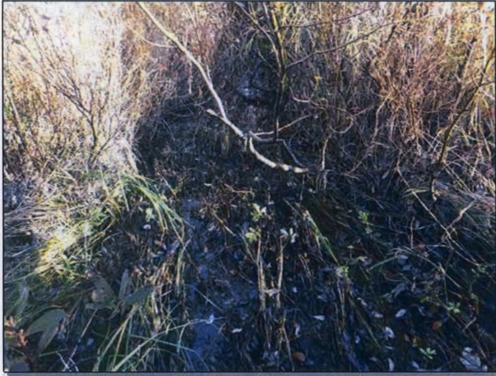
Site 5: Vegetation. Photo taken September 29, 2016