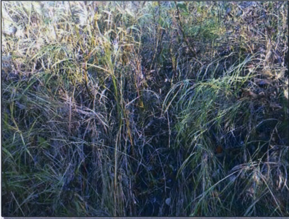
Site 8: Vegetation. Photo taken September 29, 2016