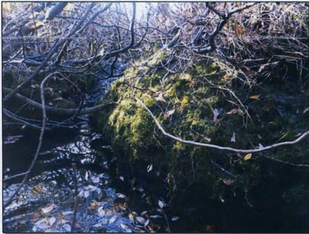
Site 4: Waterbody, upstream south. Photo taken September 29, 2016