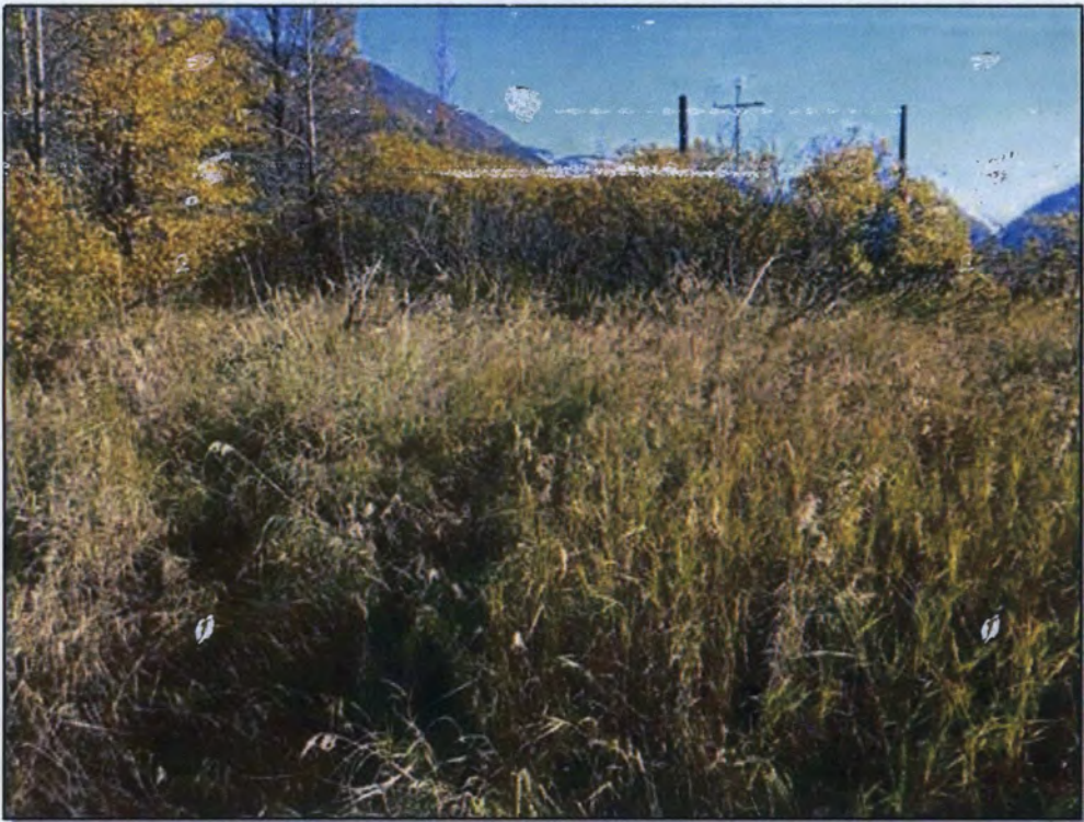
Site 68: Vegetation. Photo taken September 30, 2016