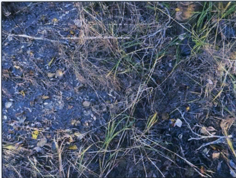
Site 35: Vegetation. Photo taken September 29, 2016