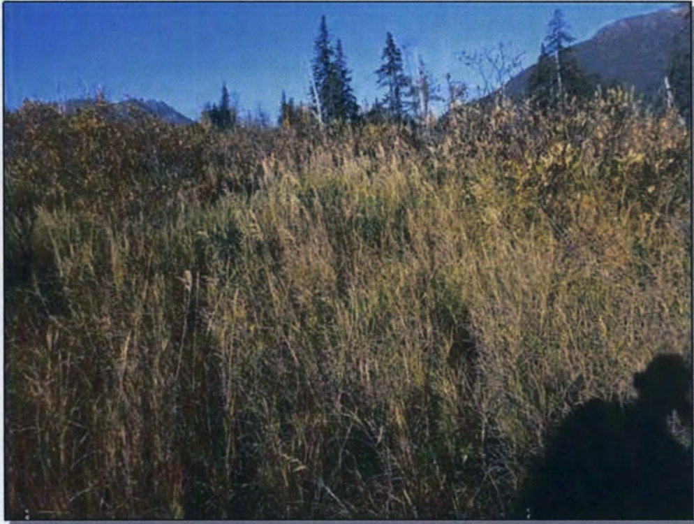
Site 32: Vegetation. Photo taken September 29, 2016