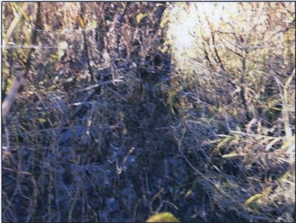
Site 55: Vegetation. Photo taken September 30, 2016