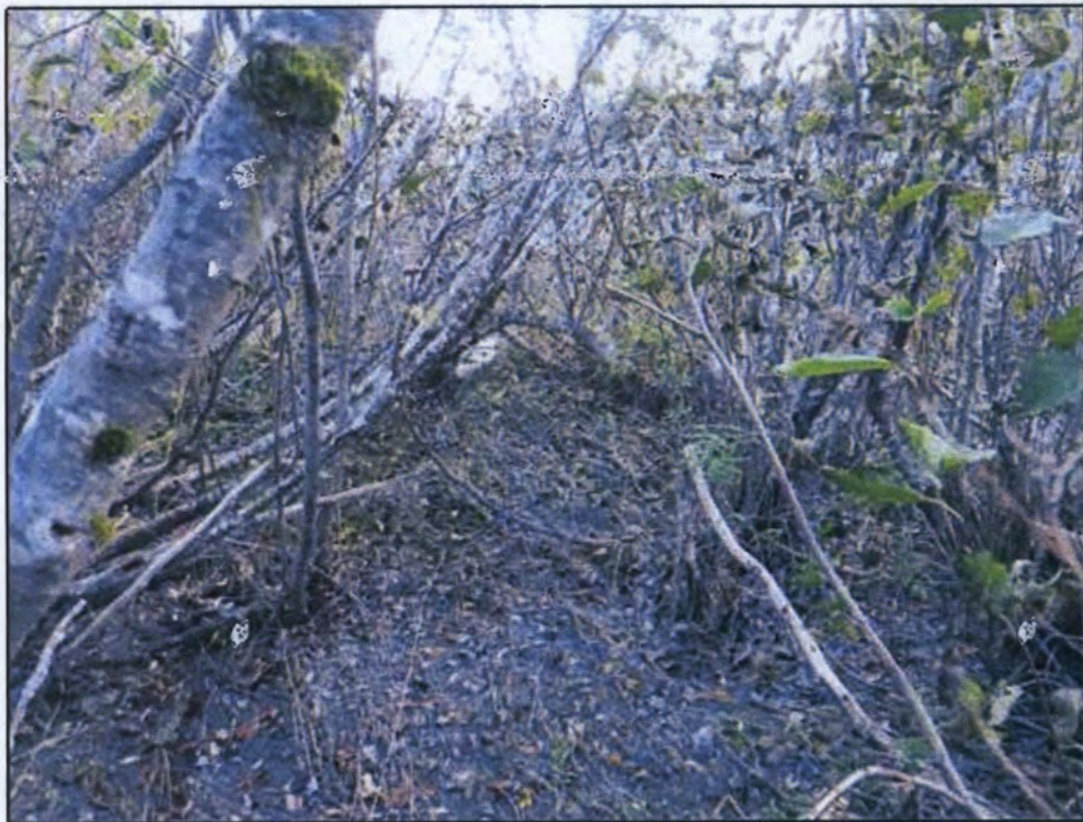
Site 45: Vegetation. Photo taken September 29, 2016