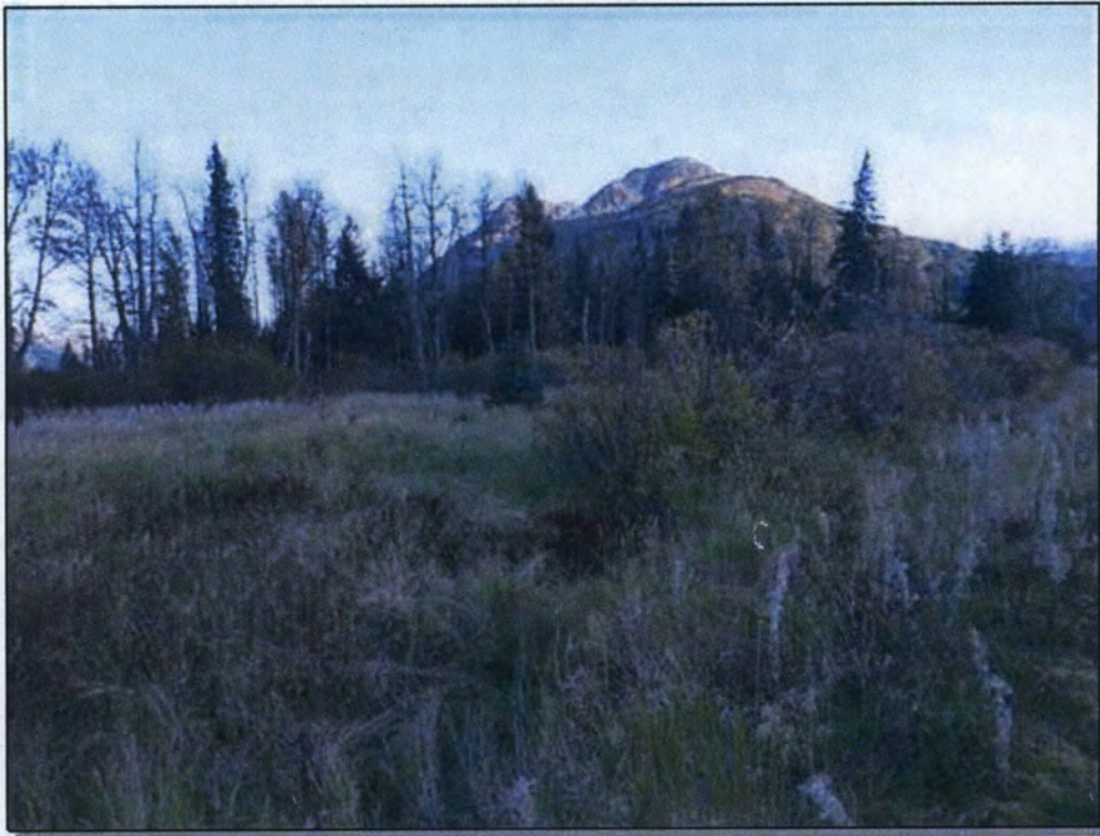
Site 40: South. Photo taken September 29, 2016