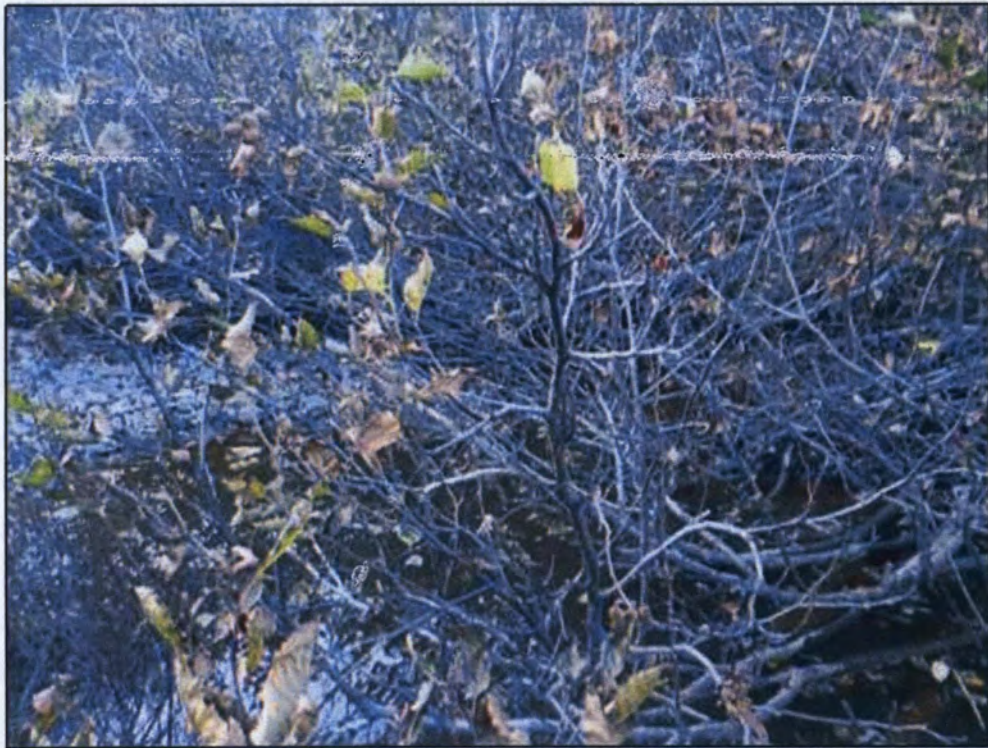
Site 39: Downstream. Photo taken September 29, 2016