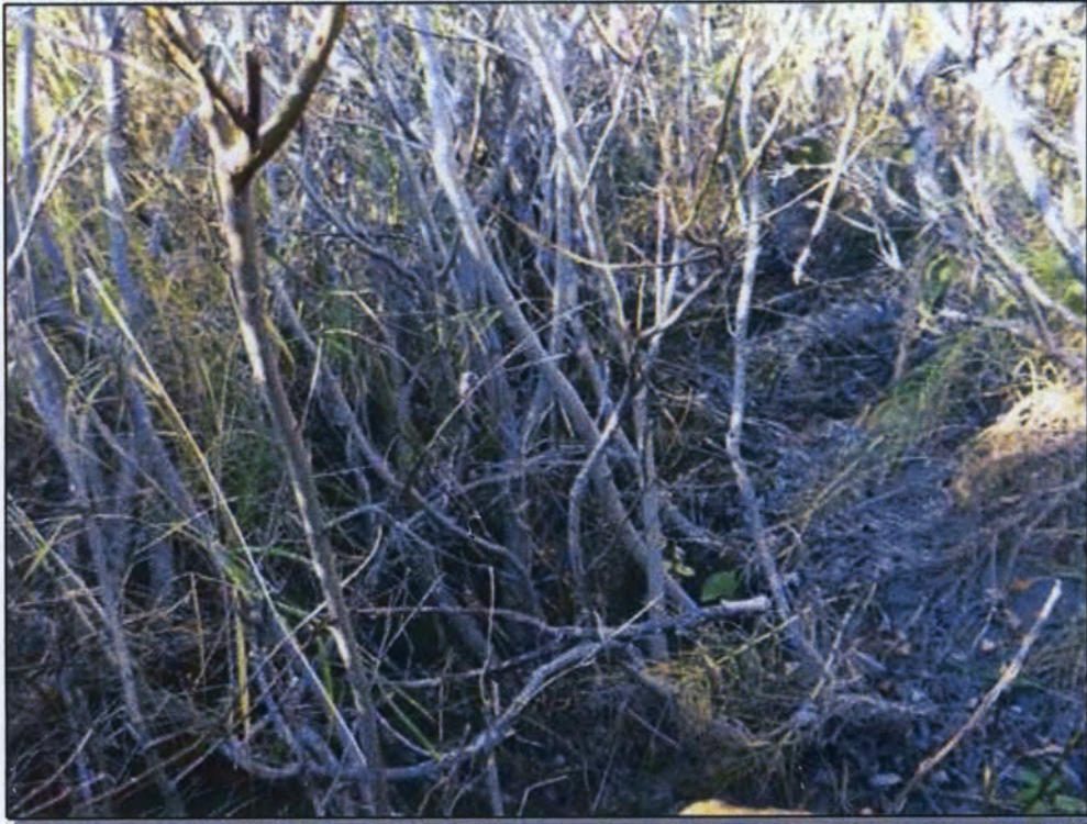
Site 33: Vegetation. Photo taken September 29, 2016