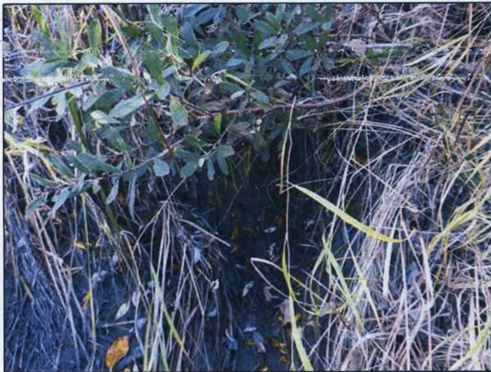
Site 33: Dry stream channel. Photo taken September 29, 2016