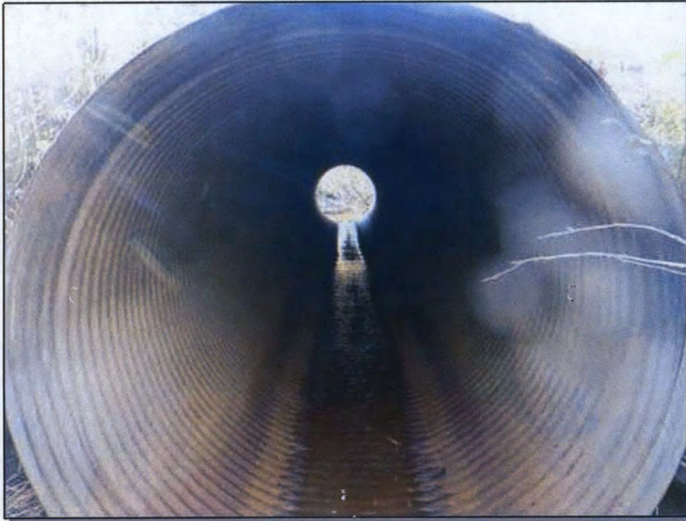
Site 30: Culvert. Photo taken September 29, 2016