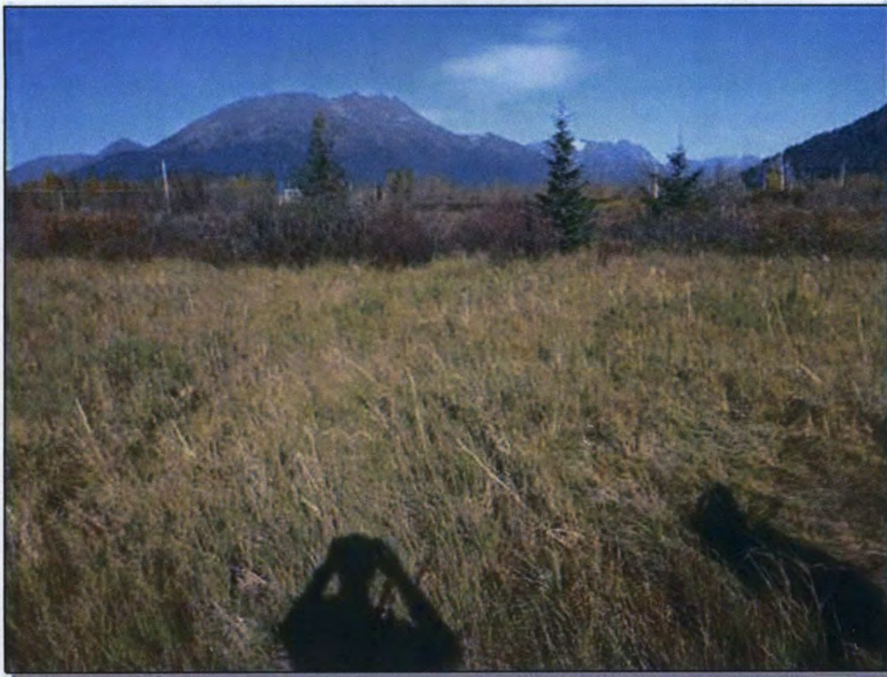
Site 62: Vegetation. Photo taken September 30, 2016