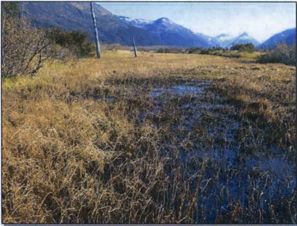
Site 65: Vegetation. Photo taken September 30, 2016