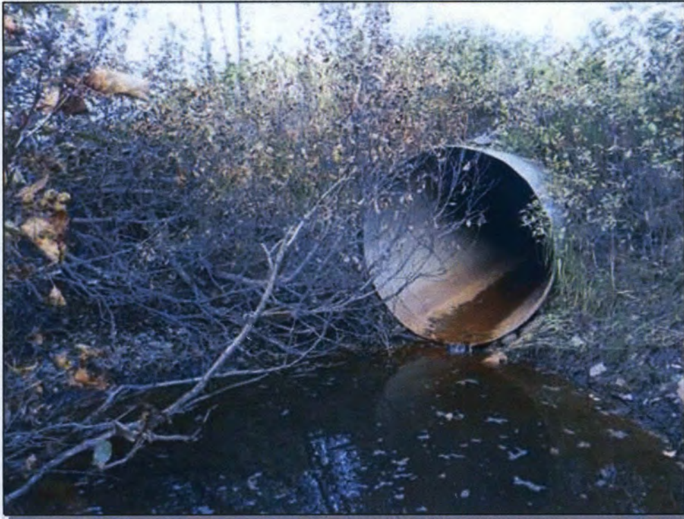
Site 39: Culvert. Photo taken September 29, 2016