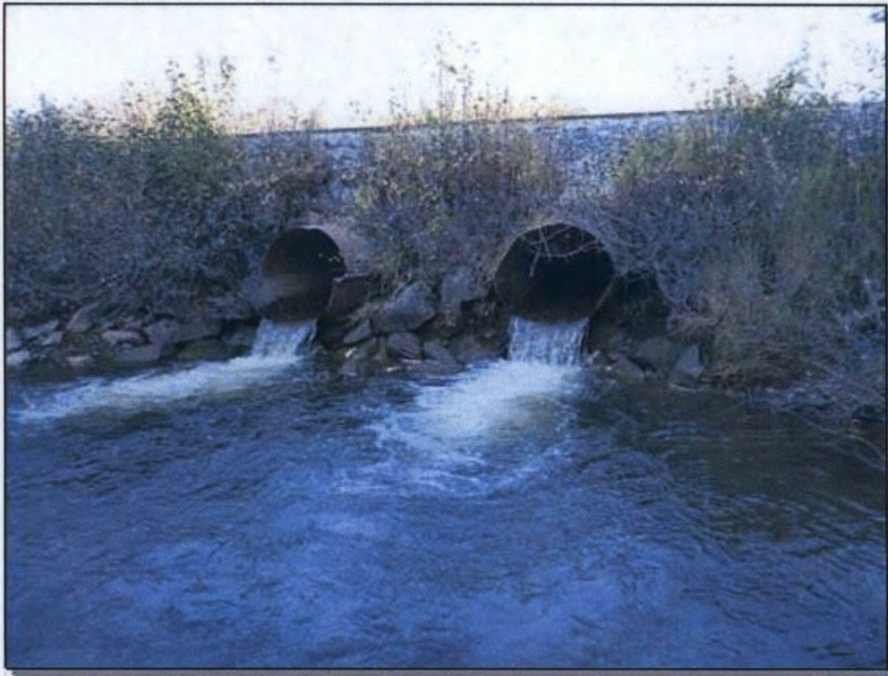
Site 41: Culvert. Photo taken September 29, 2016