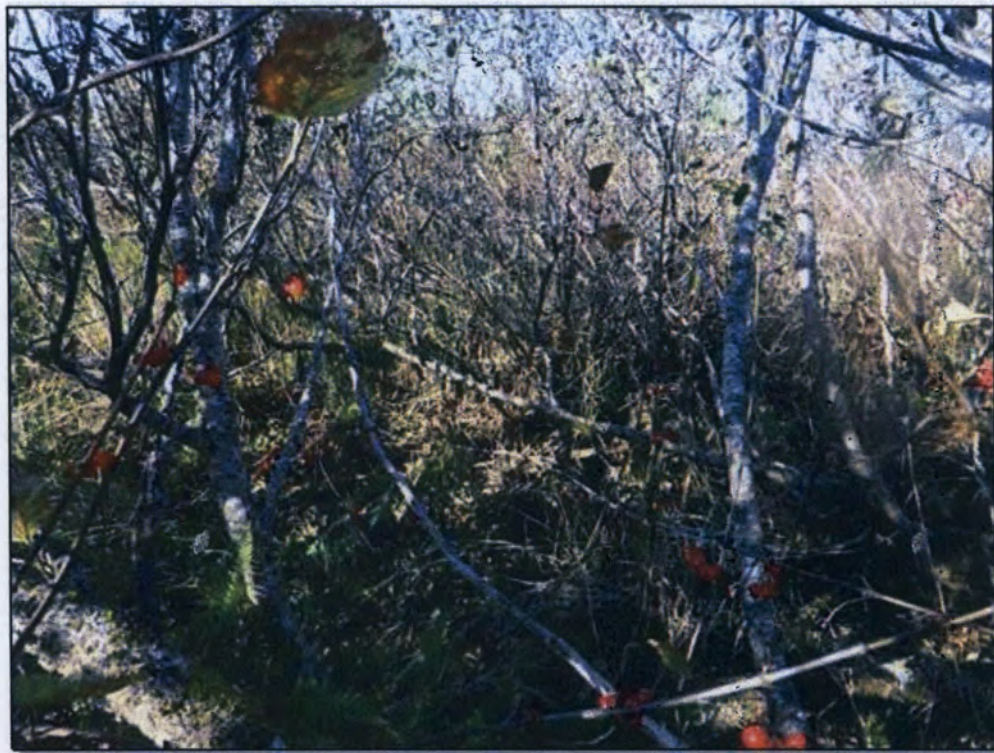
Site 28: Vegetation. Photo taken September 29, 2016