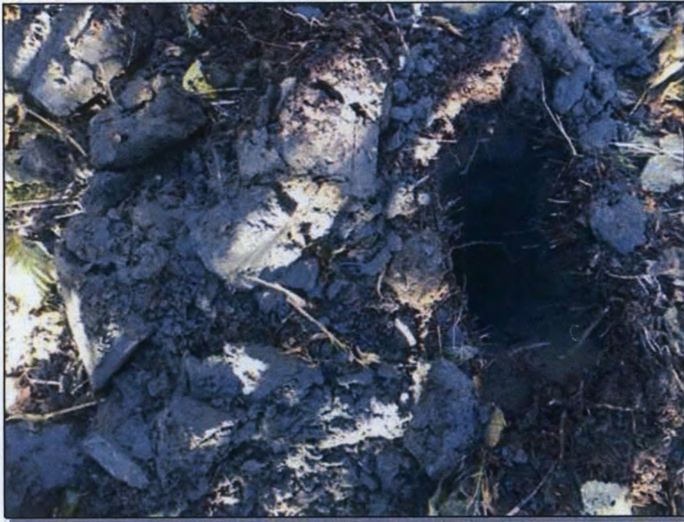
Site 24: Soil. Photo taken September 29, 2016