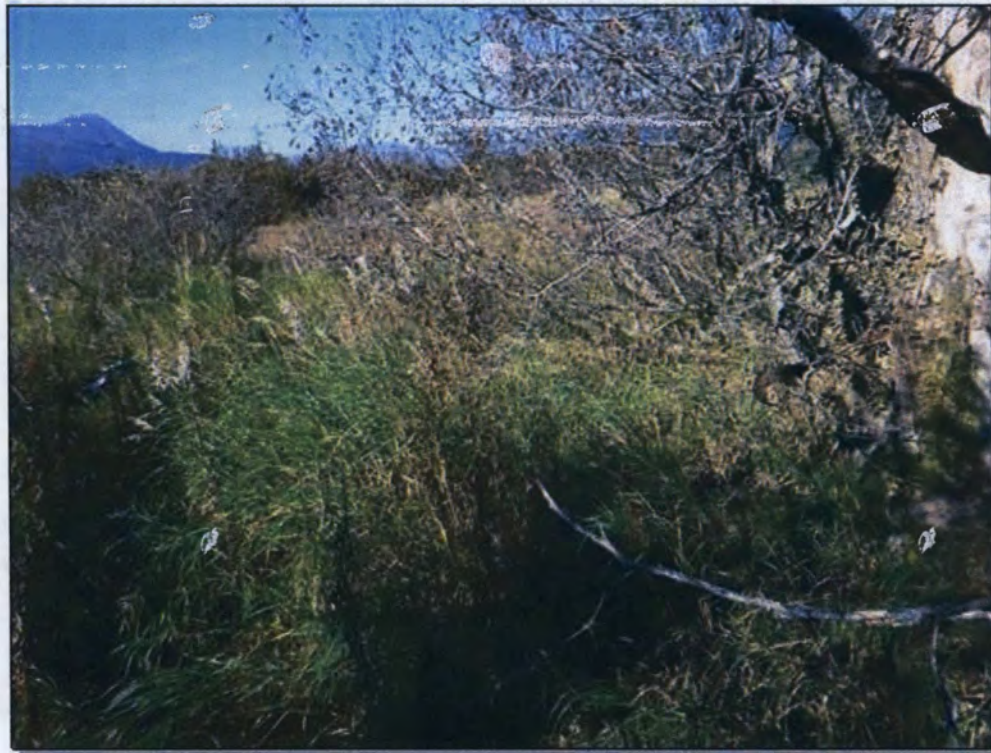
Site 64: Vegetation. Photo taken September 30, 2016