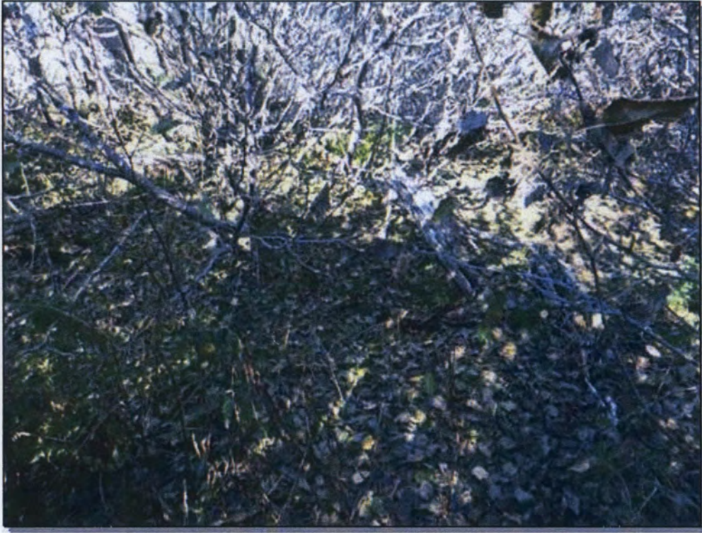
Site 24: Vegetation. Photo taken September 29, 2016