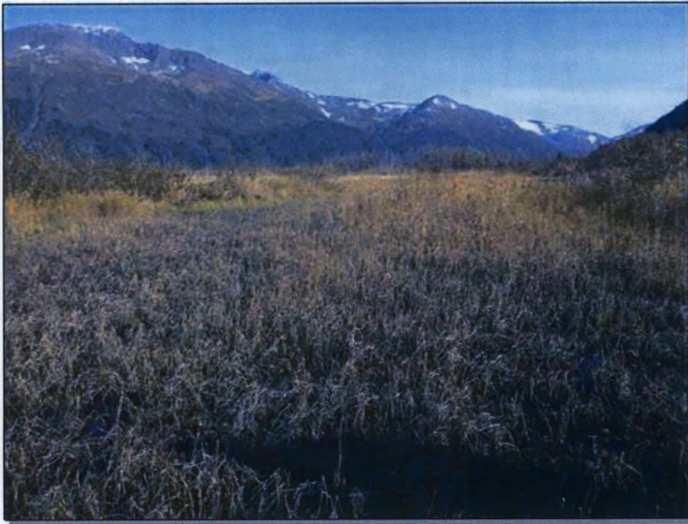
Site 22: Vegetation. Photo taken September 29, 2016