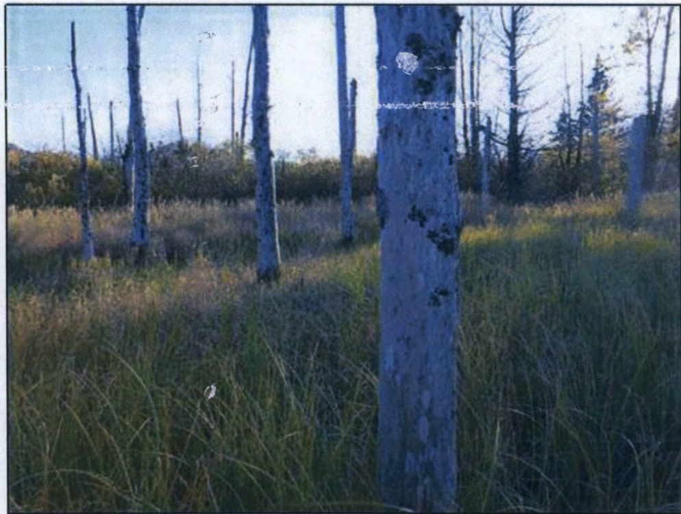
Site 37: Vegetation. Photo taken September 29, 2016