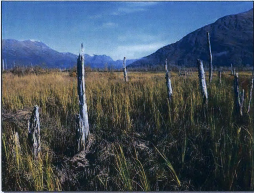
Site 51: Vegetation. Photo taken September 30, 2016