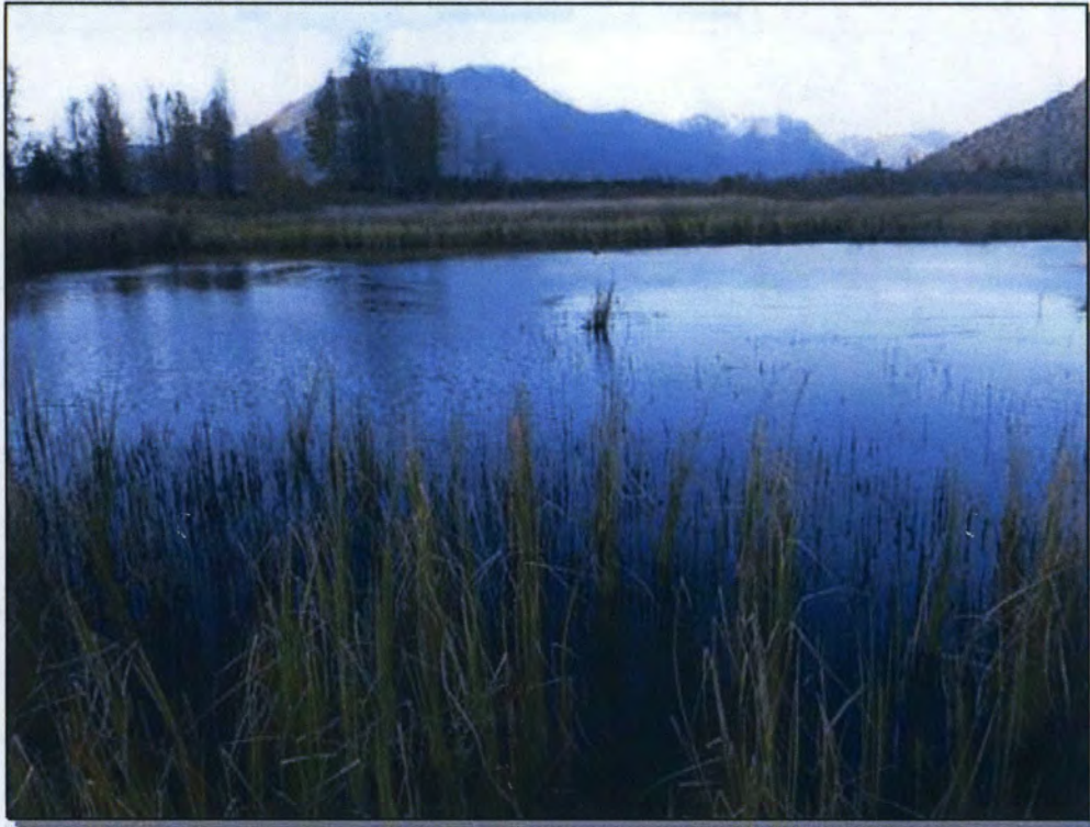
Site 44: Waterbody. Photo taken September 29, 2016